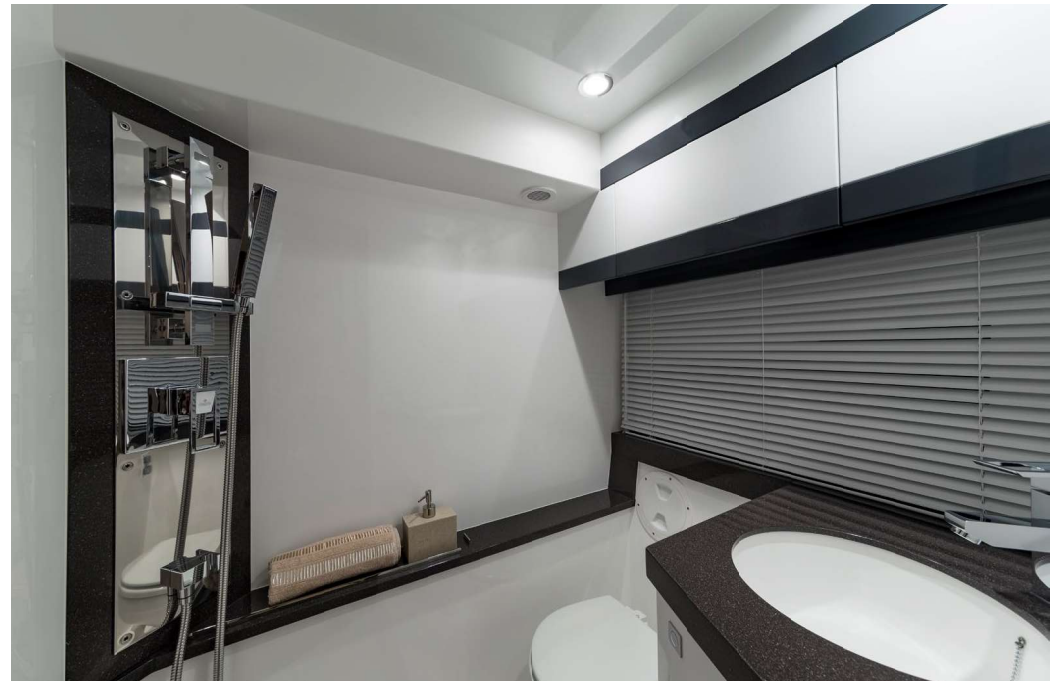
Guest bathroom complete with shower —