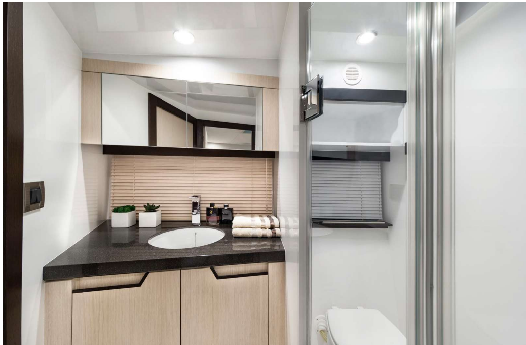
The master bathroom has a separate shower —