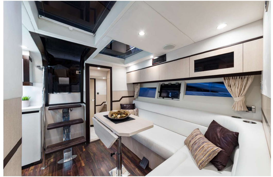
Dinette and rest area