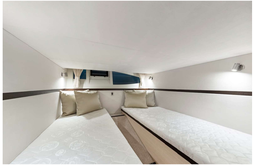
Slide the twin beds together when needed- smart! —