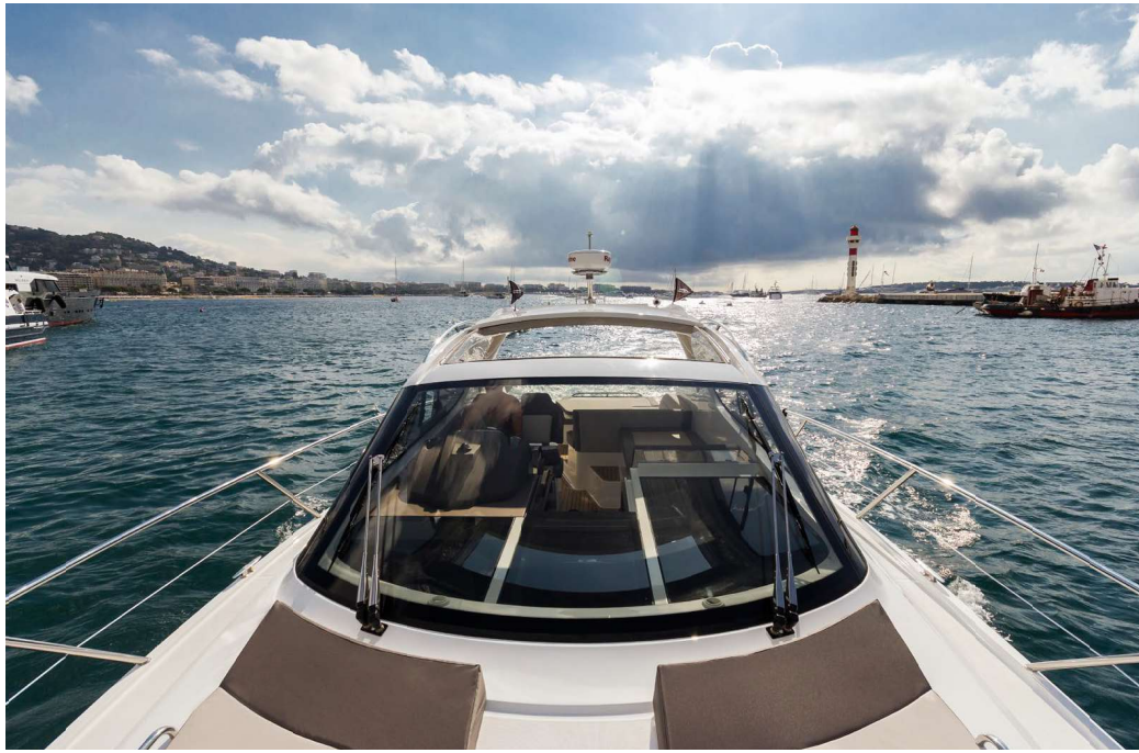
— The one-piece windscreen is impressive