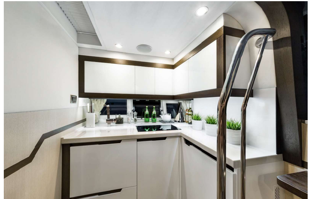
The galley will serve all guests on board