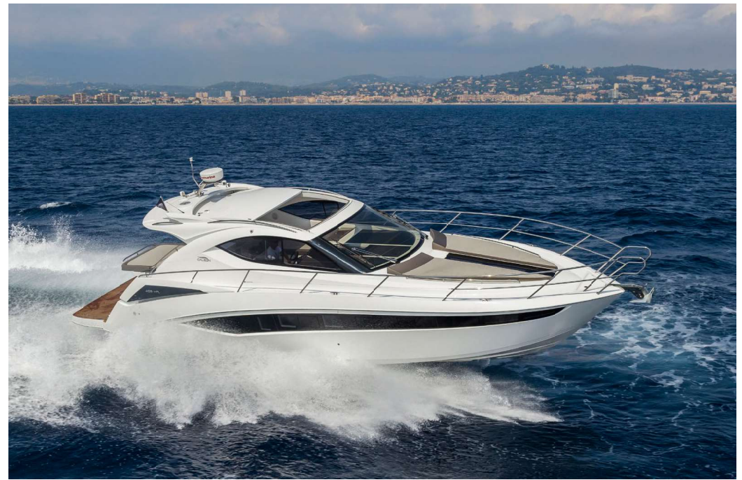
A sleek and dynamic exterior of the 405 —