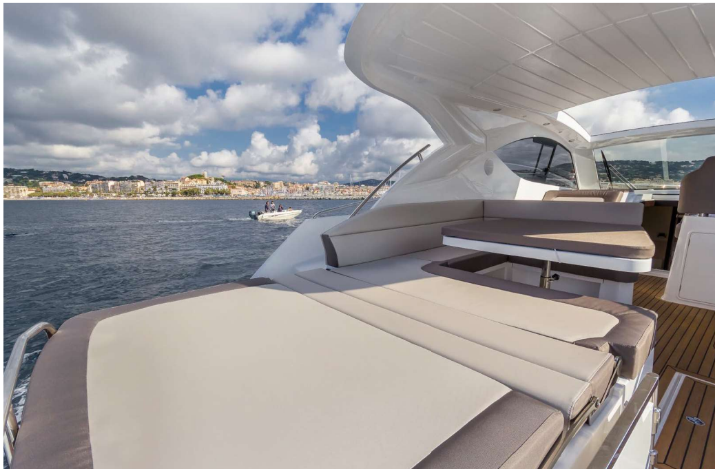
— A large sundeck and rest area