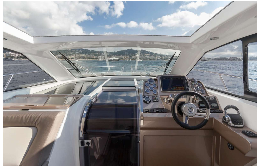
— Great visibility all around