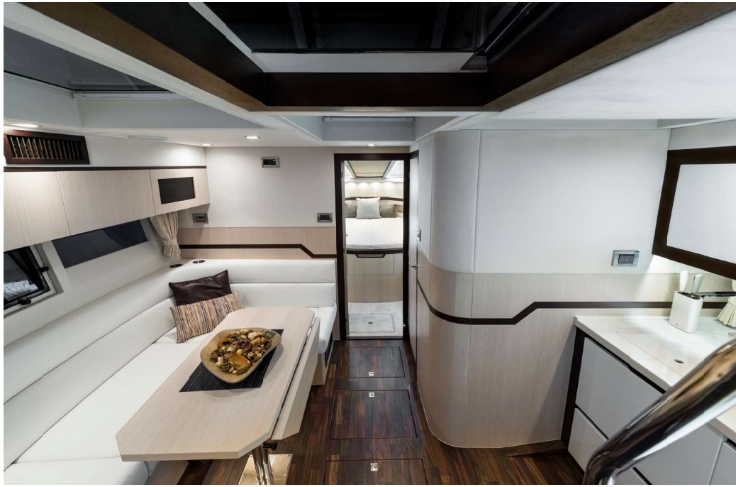
A well lit saloon is located below deck