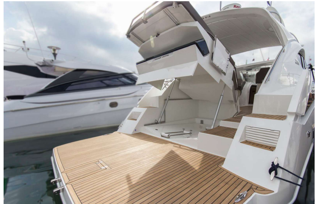
— The garage will hold a tender and is great for storage