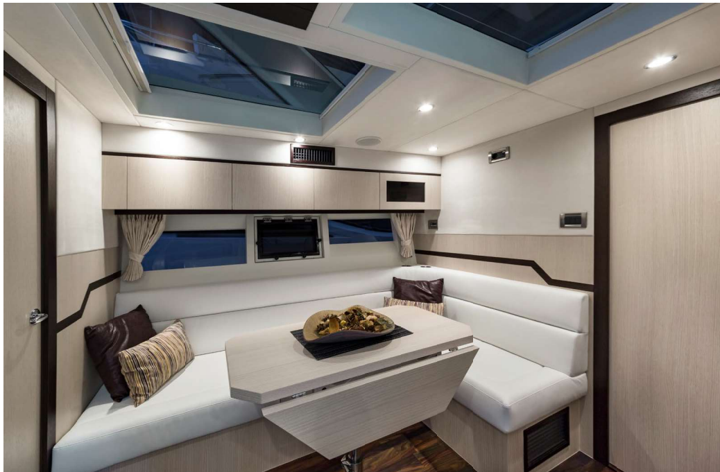
Notice the skylights above