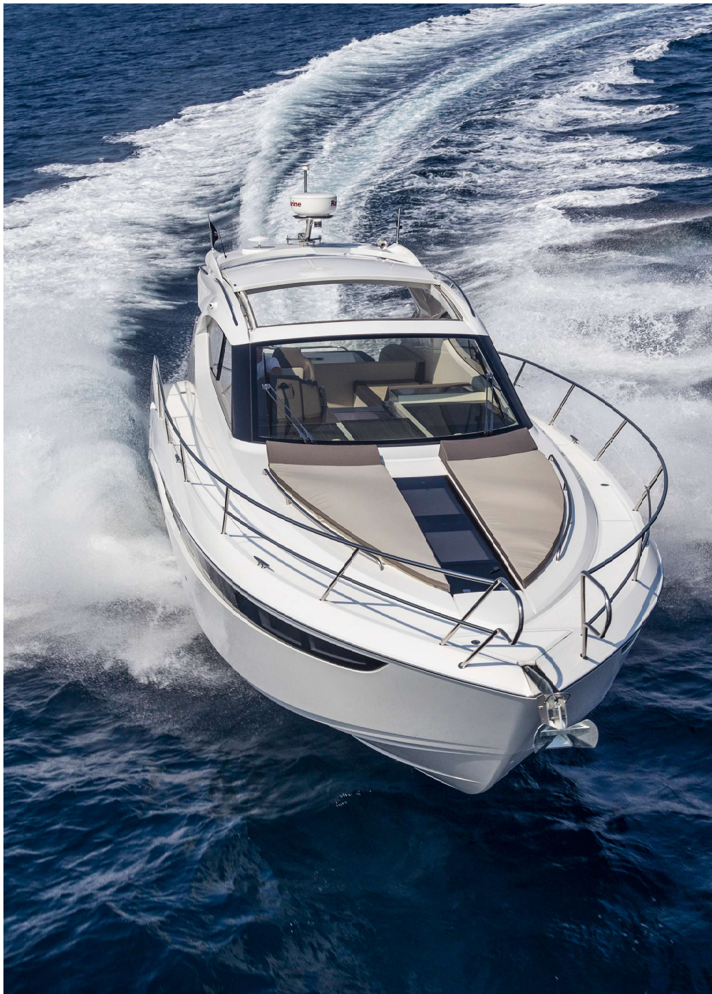
Open up the sunroof for a more exciting ride —