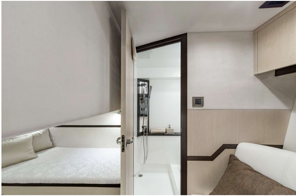
The guest cabin comes with a private bathroom —