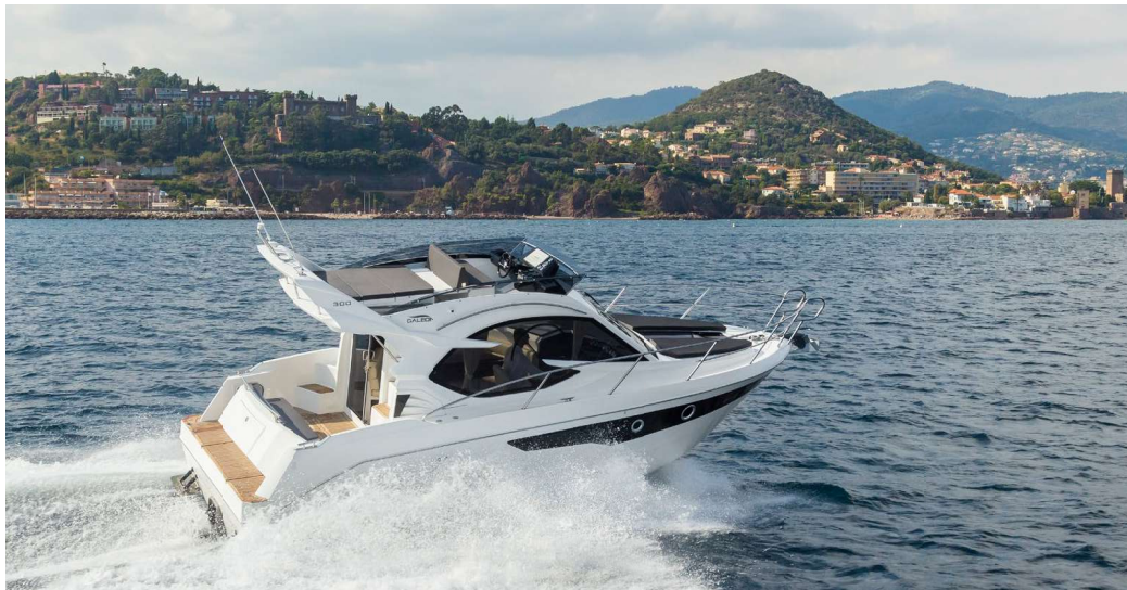
— Swift handling in all weather conditions