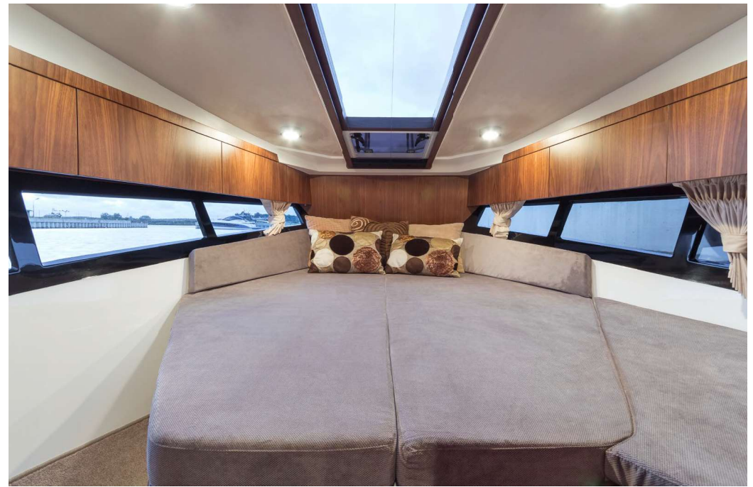
— Forward owner's cabin with double bed