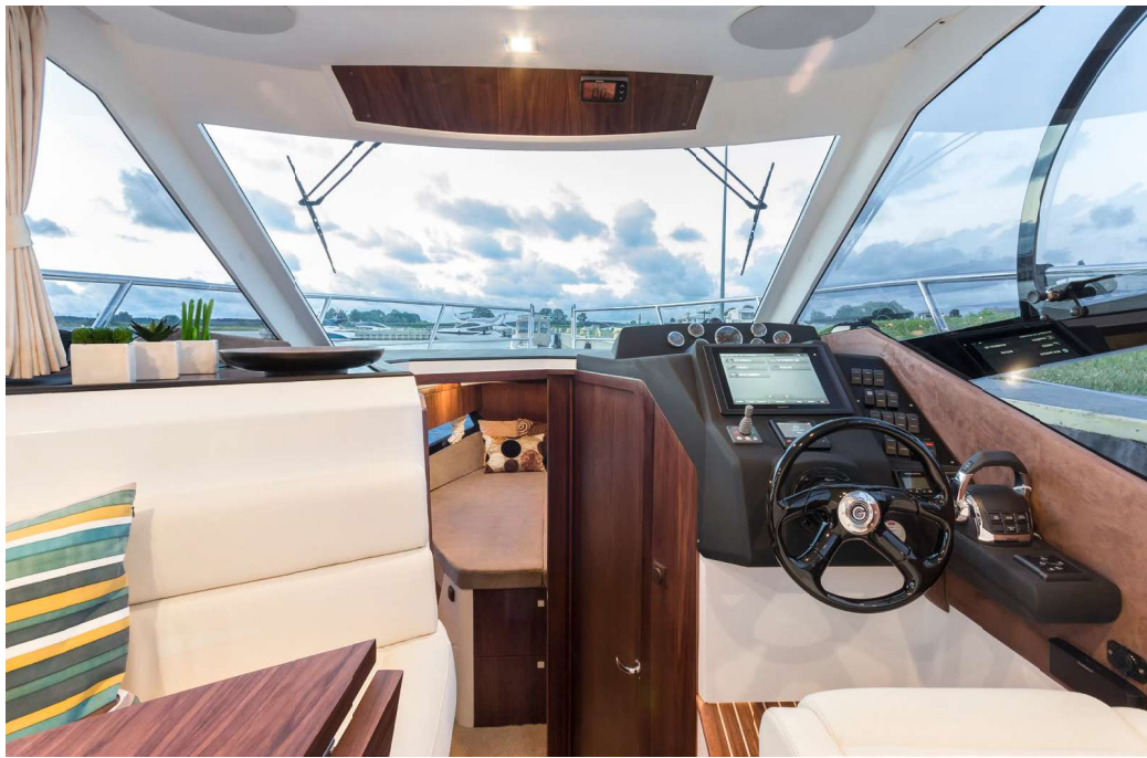
— The side window will open manually to let the breeze in