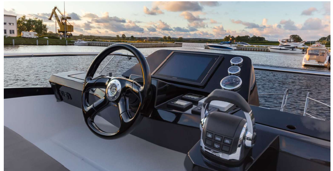
— Second steering is available on the top deck