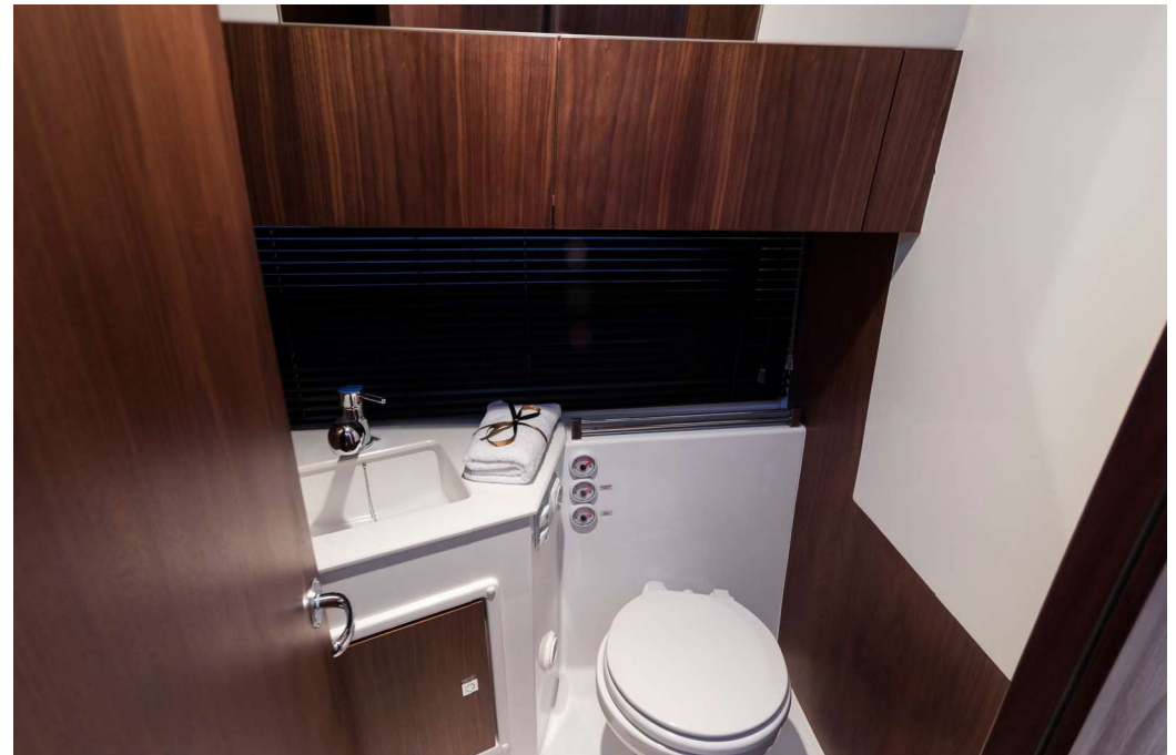
— Bathroom with head and shower