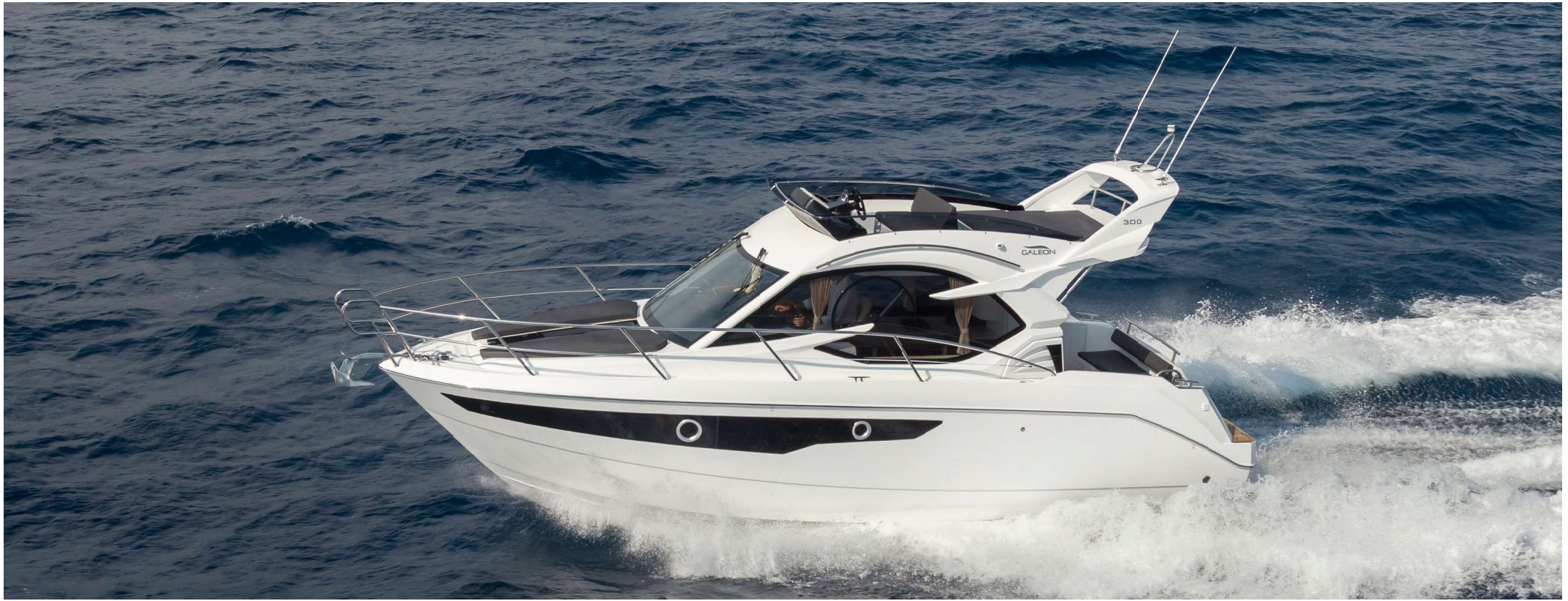
— The entry level flybridge model offers plenty of space on board