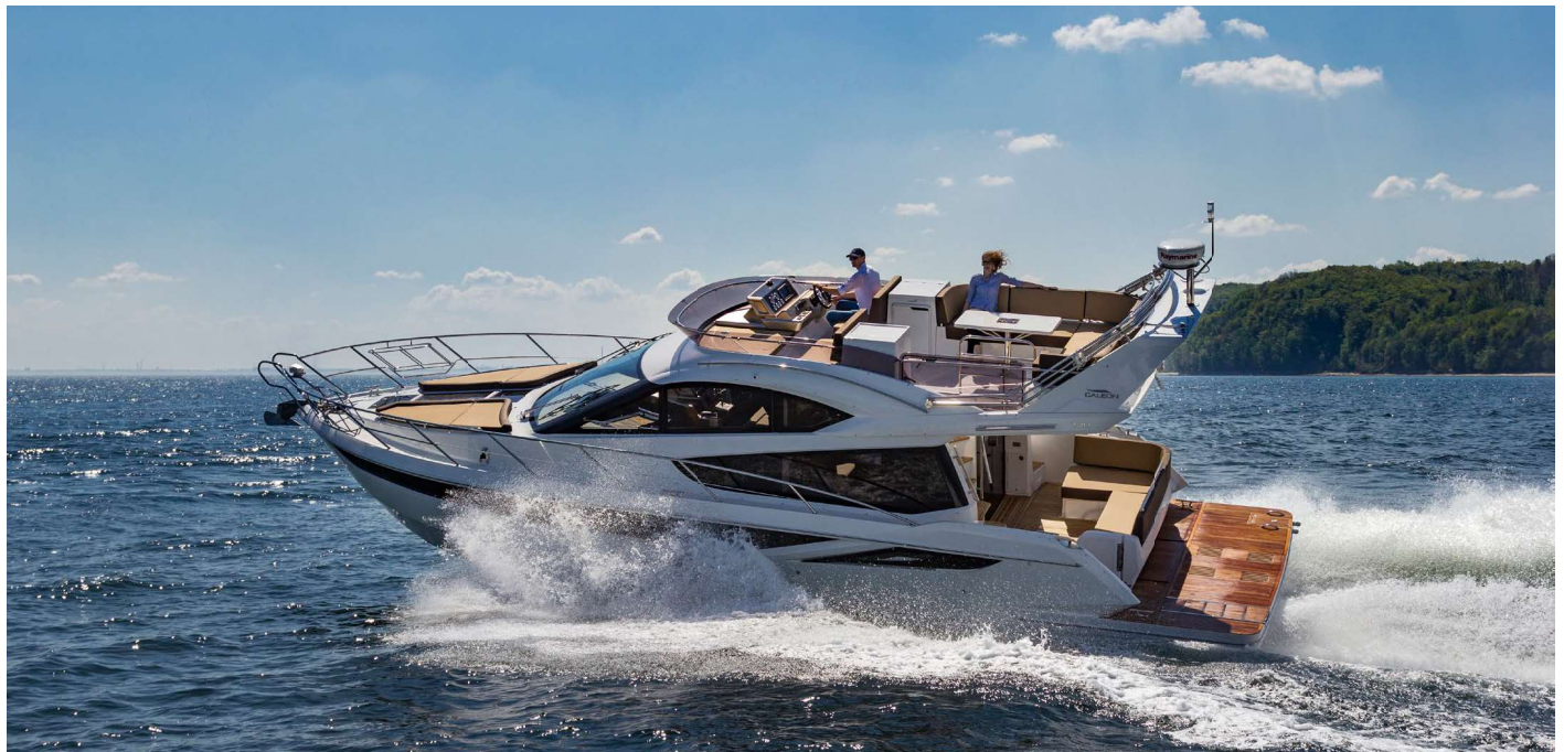
The 420 FLY handles well even during difficult manoeuvring

The modern and functional exterior has made the 420 FLY extremely popular over the years