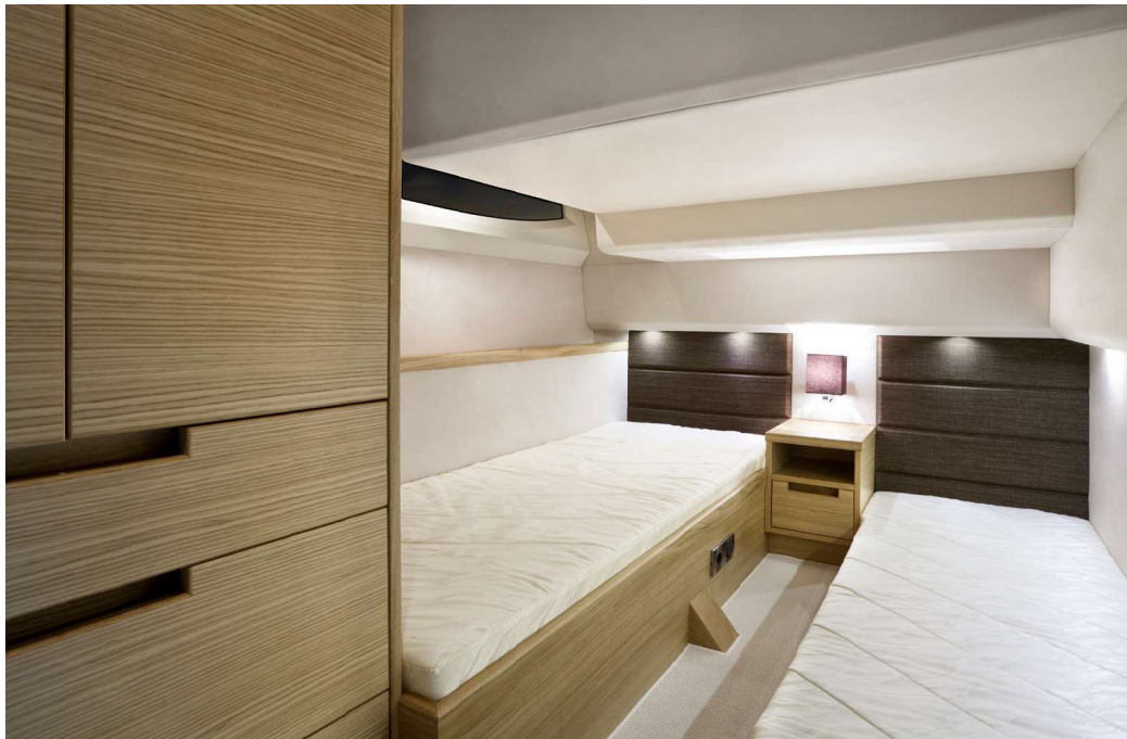
Twin guest cabin