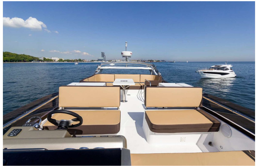
— A very spacious flybridge