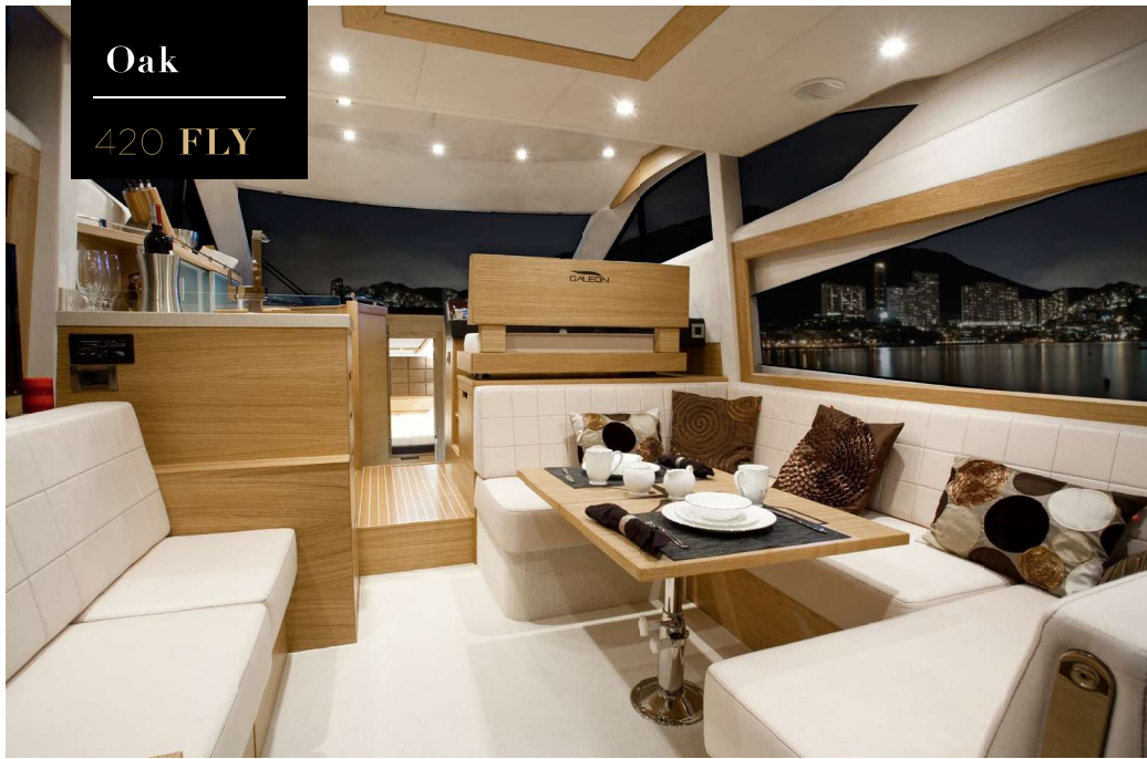
— A large dinette in the saloon