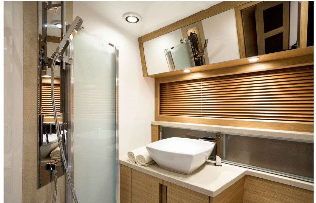
One of two bathrooms down below