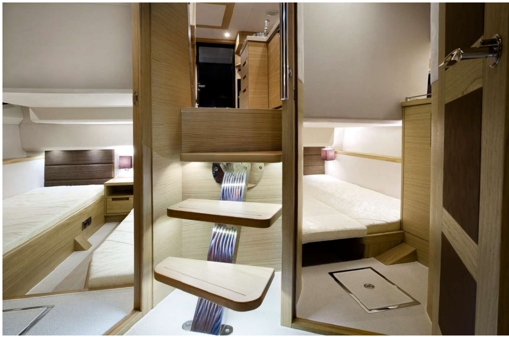
An incredible, three cabins down below