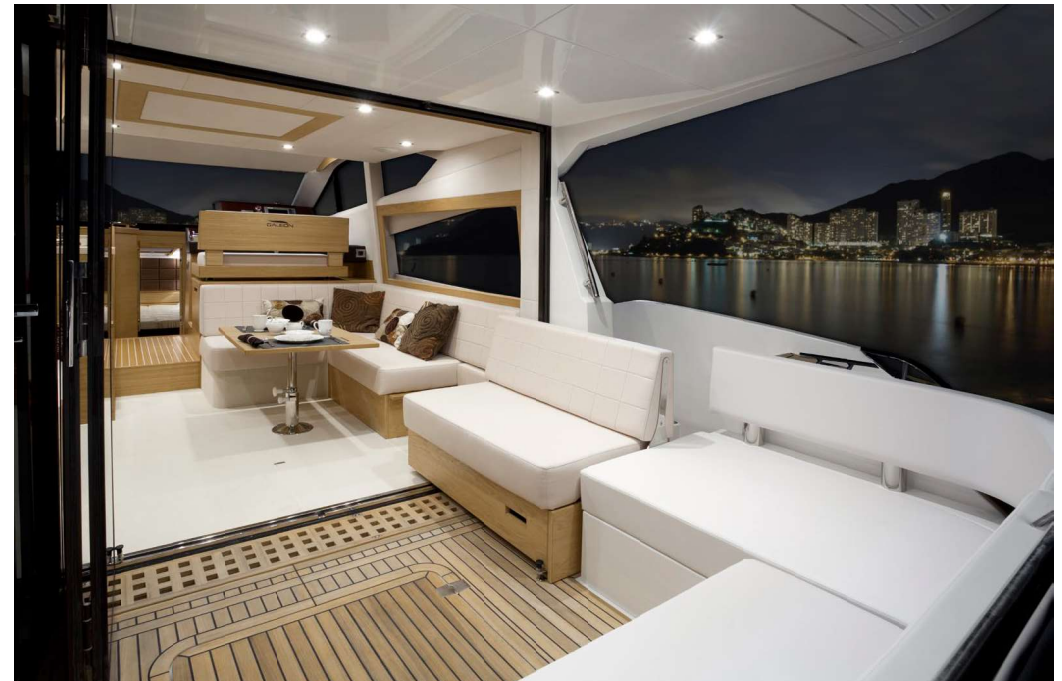
— Move the sofa to create a completely open cockpit space