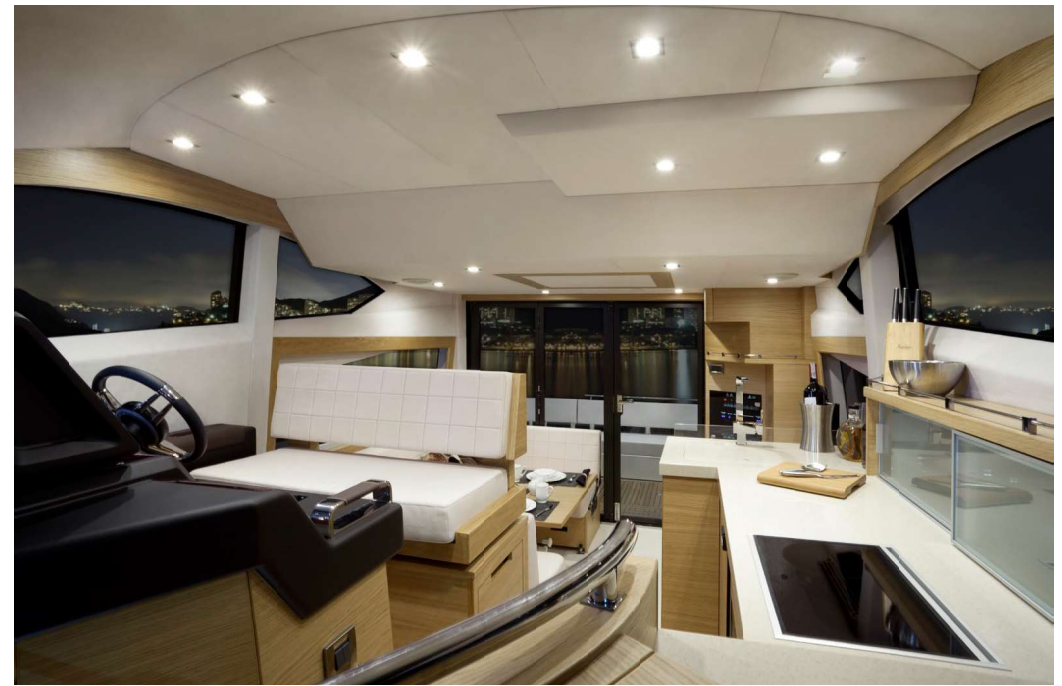
— The galley can be located next to the helm