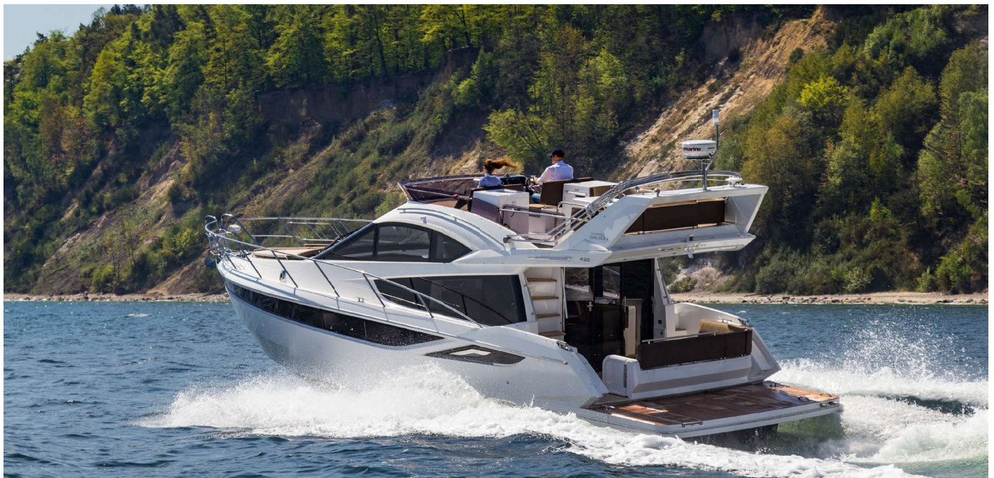
A hydraulic bath platform is available