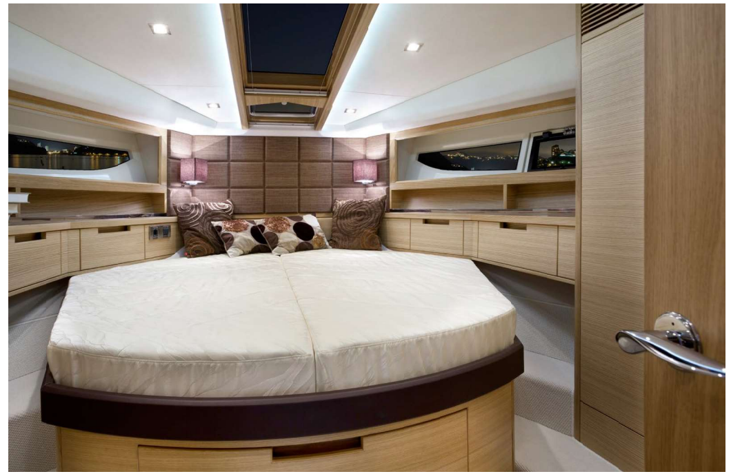
Forward owner's cabin