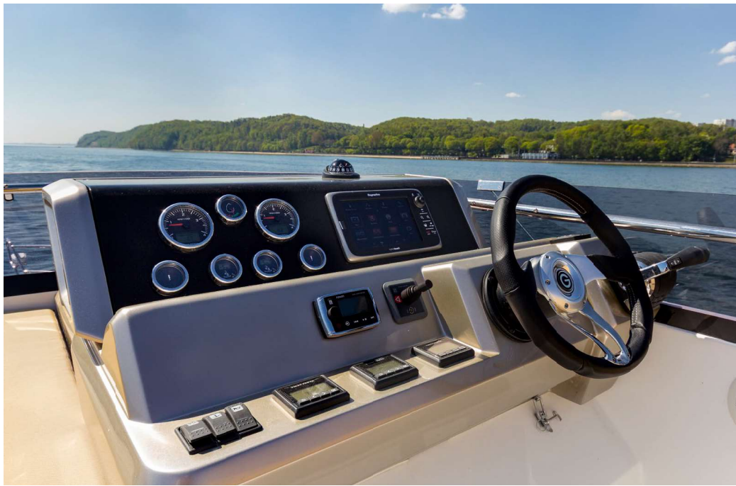
— All the controls are available on the top deck