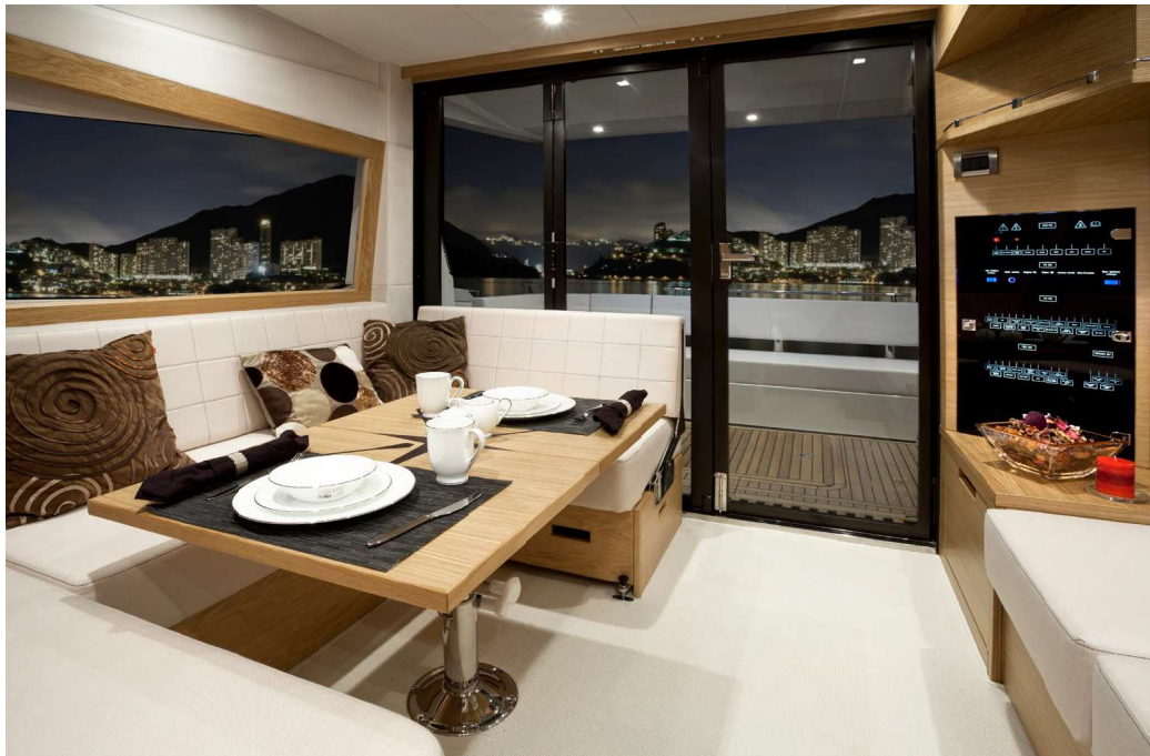
— The table folds out for proper dining