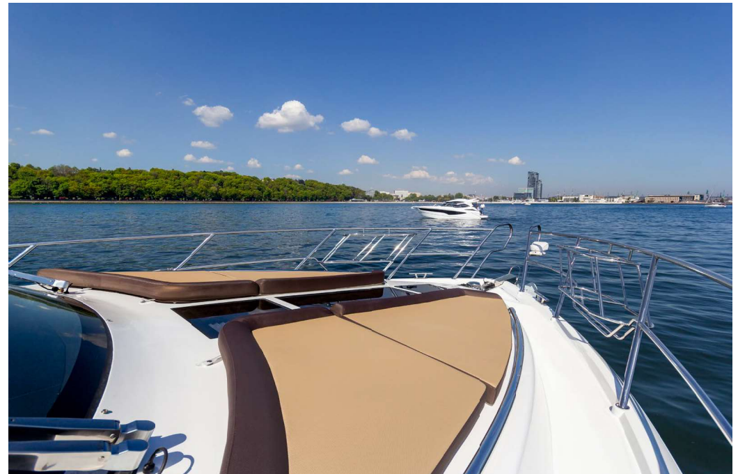
— Two sun pads on the bow