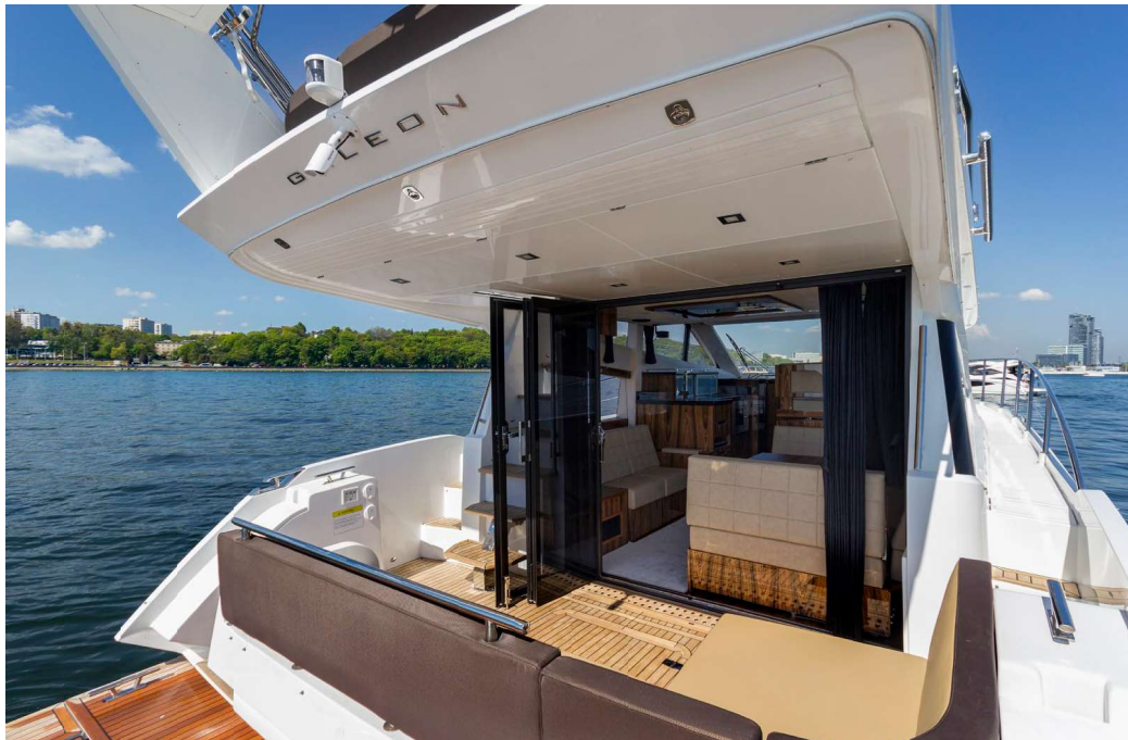
— Glass doors open all the way to reveal the interior