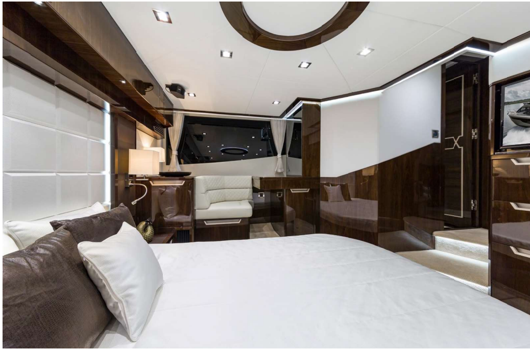
A make-up station or shezlong options are available