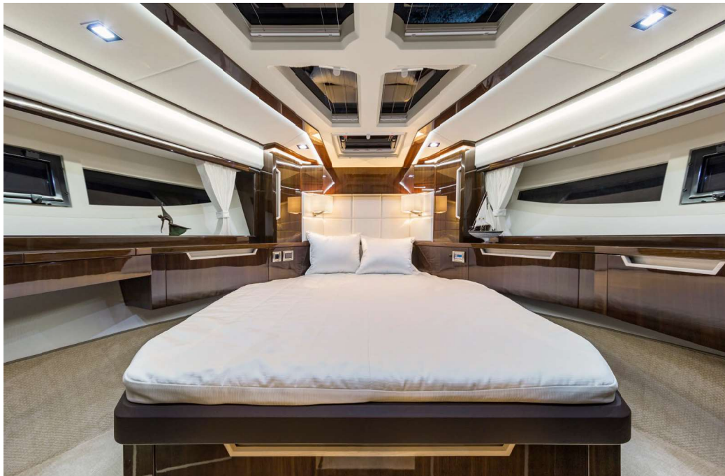
Forward VIP cabin with skylights