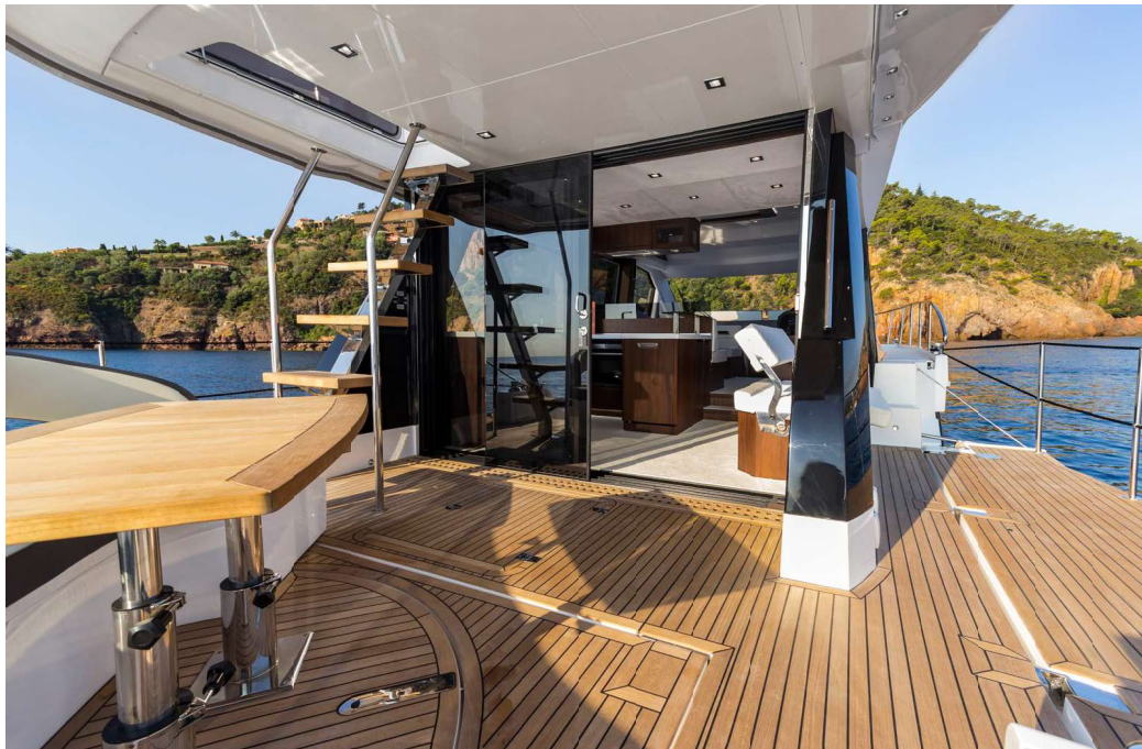
— Drop down the sides and enjoy the incredible cockpit area