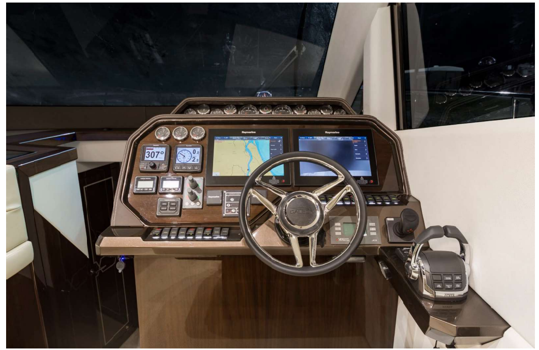
A low profile helm station for better visibility