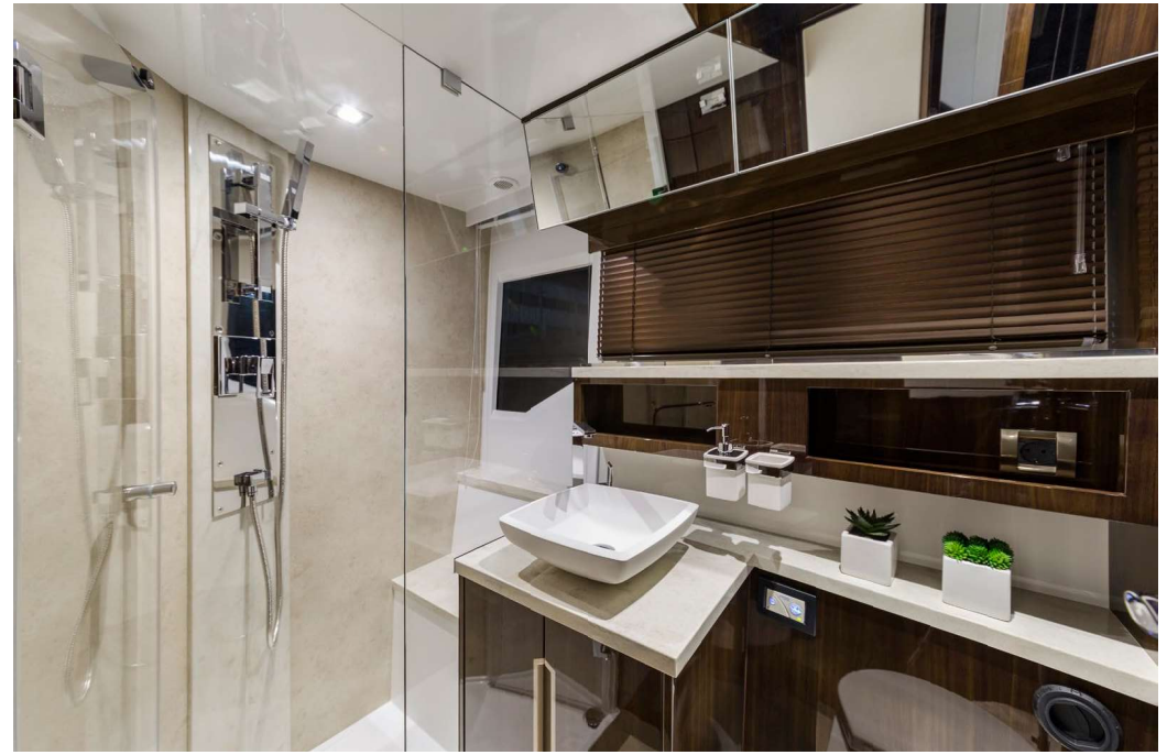
Two bathrooms are available down below