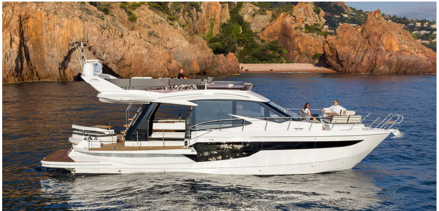
Find an amazing variety of leisure space all around the yacht —

The incredible beach mode extends the available beam to six meters! Serve drinks to the port side bar for your guests enjoyment.