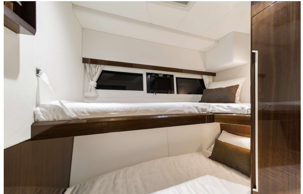
Guest cabin with bunk beds can serve as storage