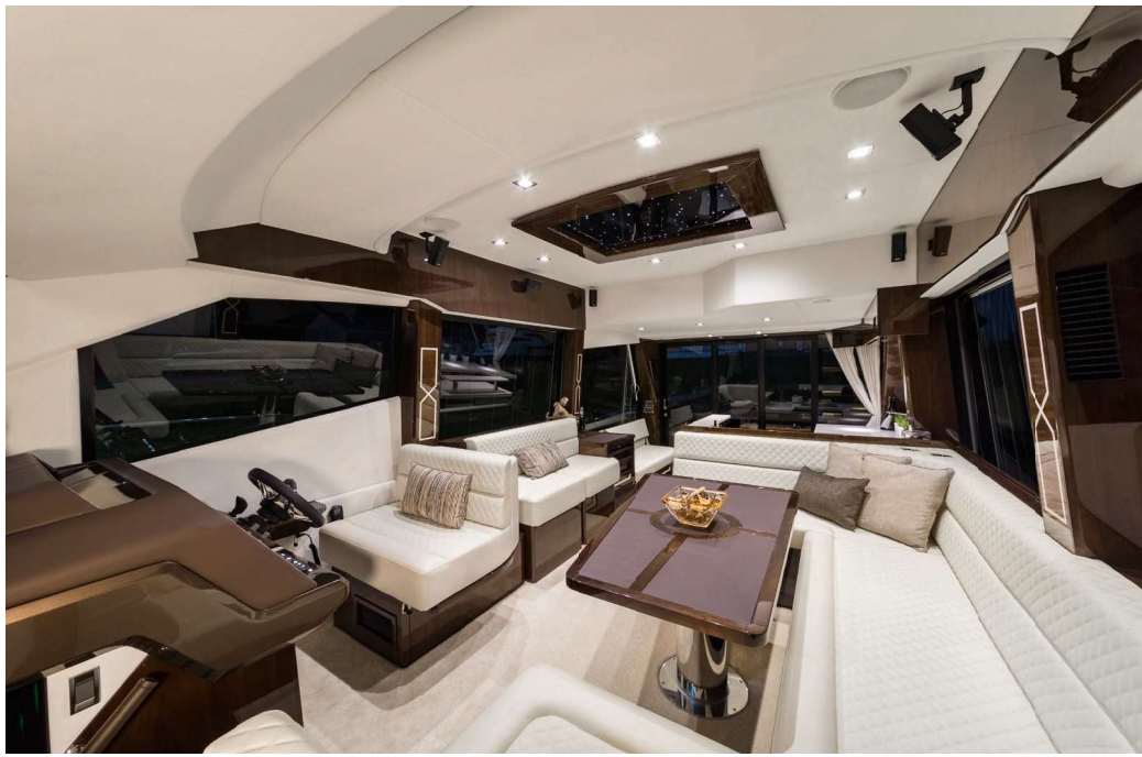
An incredible amount of windows all around