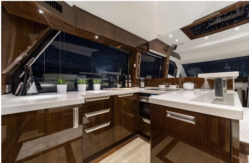
Kitchen area may service the outside bar