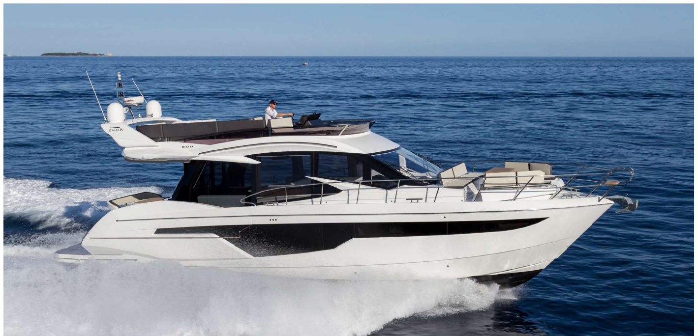
The stunning exterior of the 500 FLY —