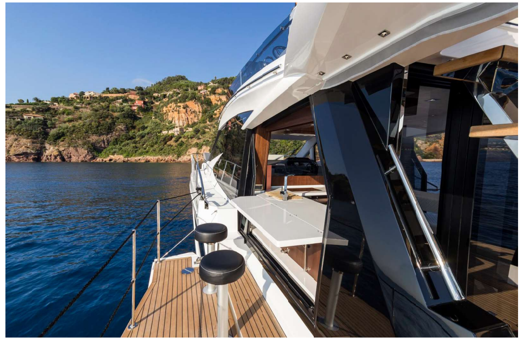
— Serve drinks outside and impress your guests