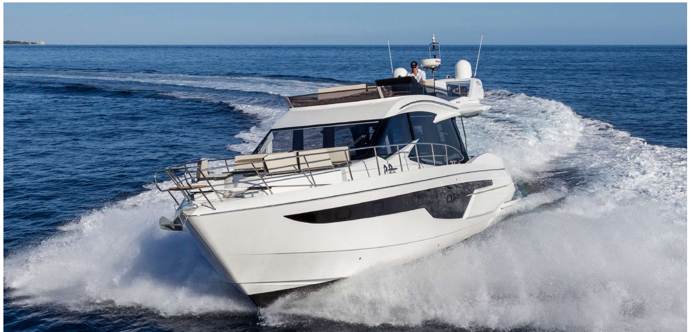
Supreme handling and performance —