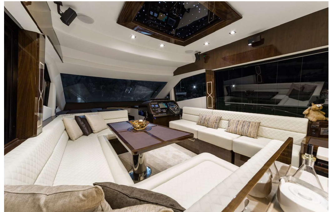
Turn the drivers seat to create a large leisure or dining area