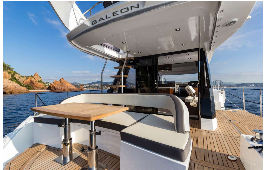
— Rotate the aft seat 360°