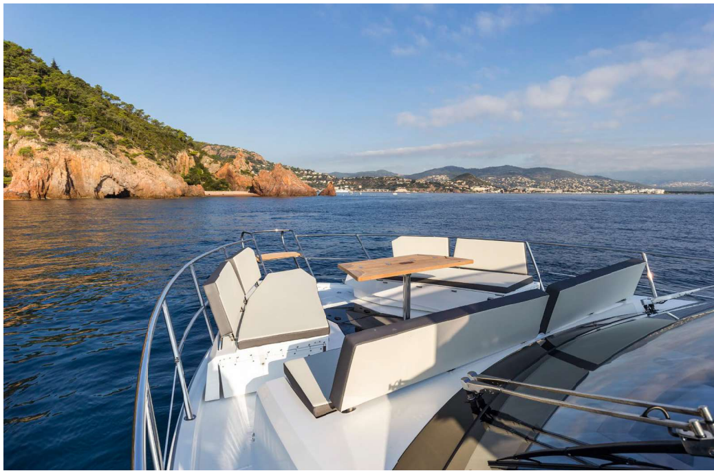
— Quickly drop the back rests and stow away the seats - smart!