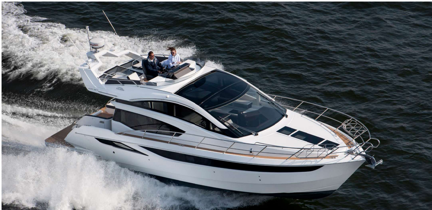
The SKYDECK features both a top deck and a sunroof over the helm