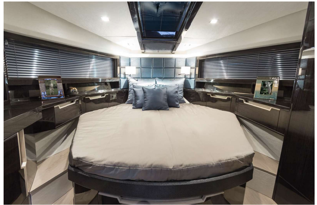
— Forward owner's cabin