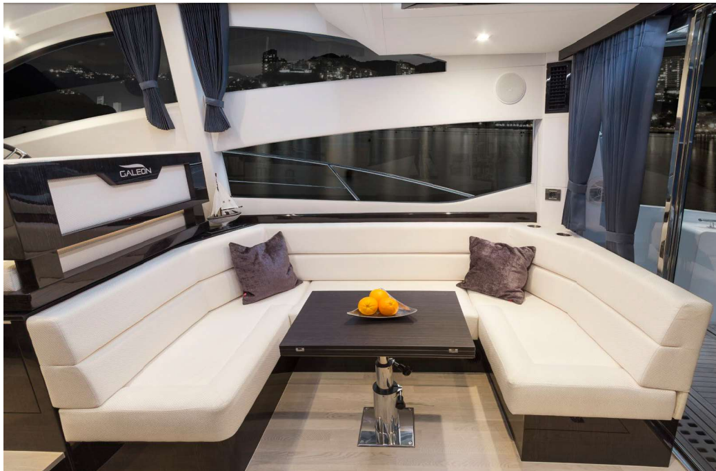
The sizable dinette will seat plenty