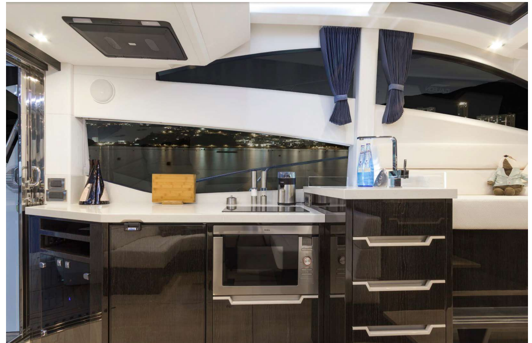
Functional galley area