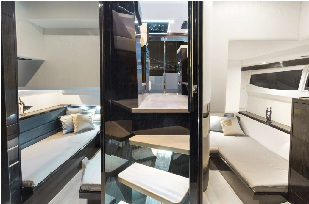
— Wide steps lead to cabins down below