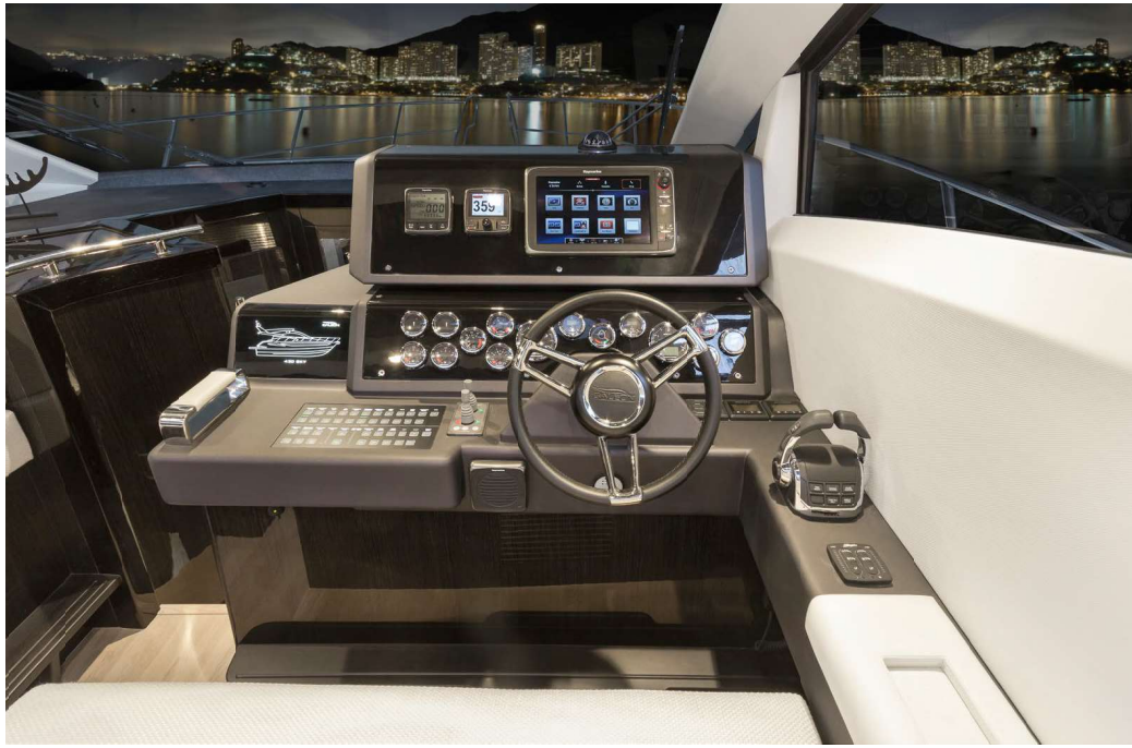
The main helm station