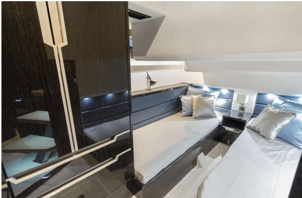
— Twin guest cabin