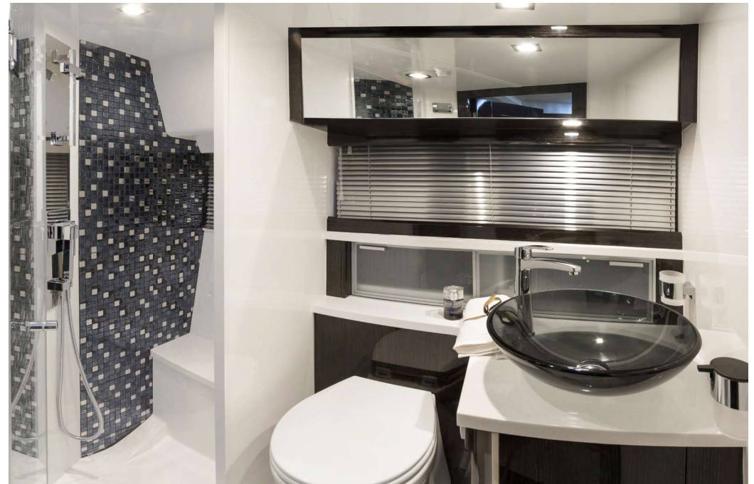
— A full-sized, enclosed shower in one of the bathrooms