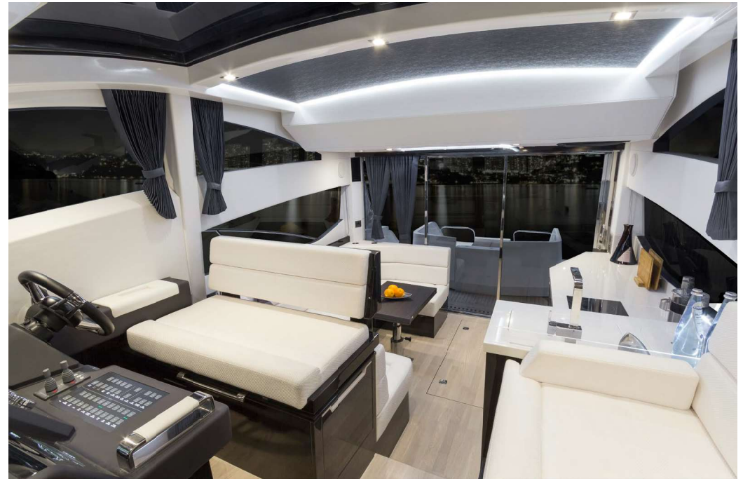
Saloon with galley moved back