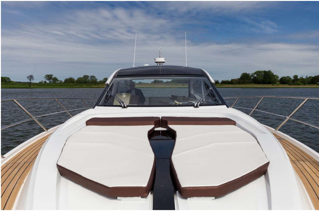
— Bow sundeck area