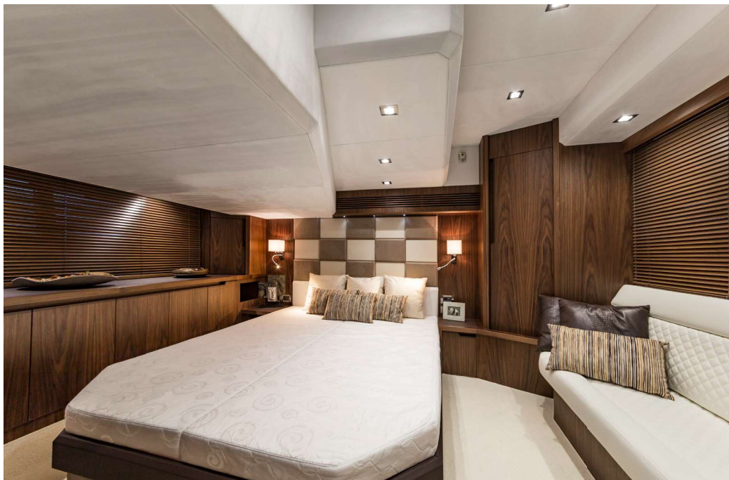
The master cabin offers a full size double bed