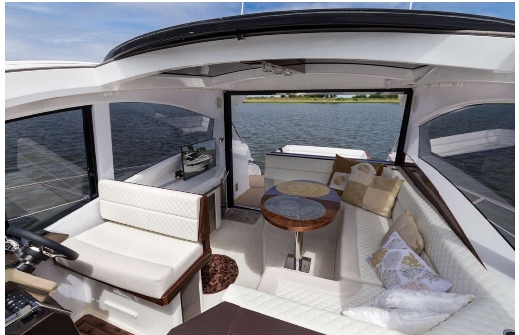
— Open the glass doors and drop the window for an open cockpit experience