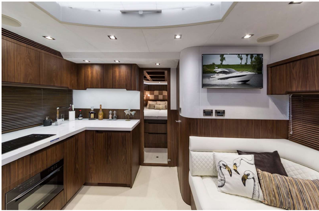
A cozy and relaxing saloon down below