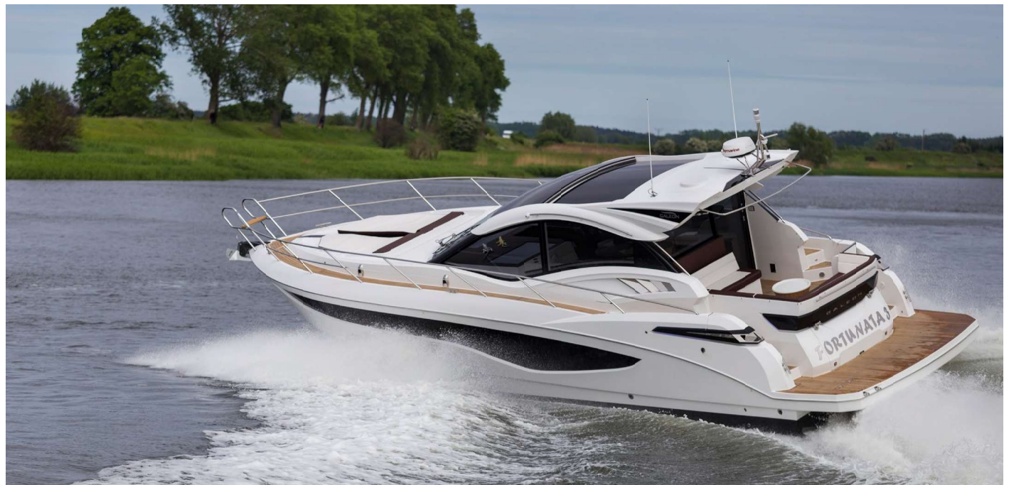
Make use of the available bath platform —