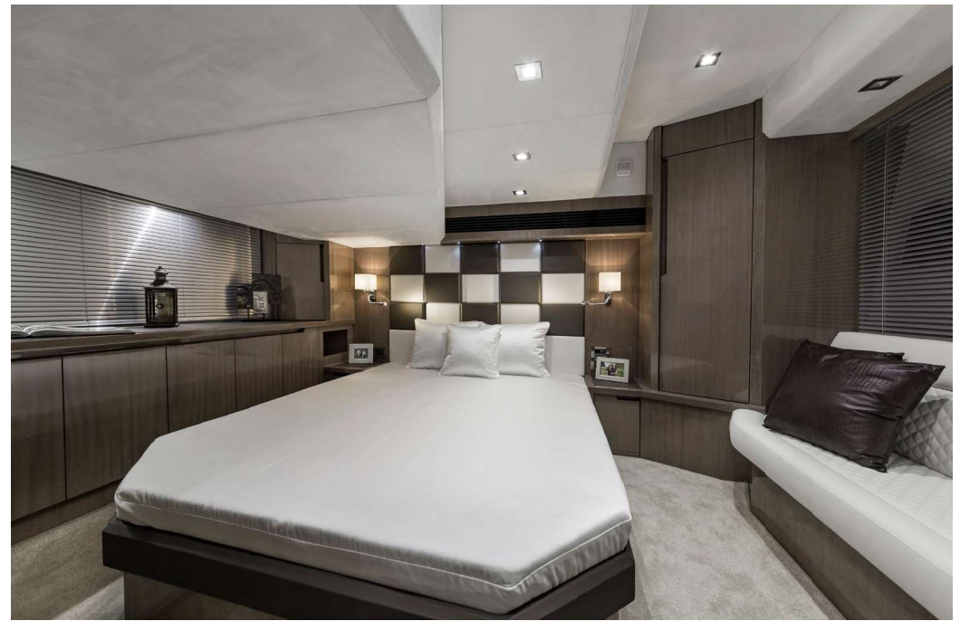
The master cabin is located midship —