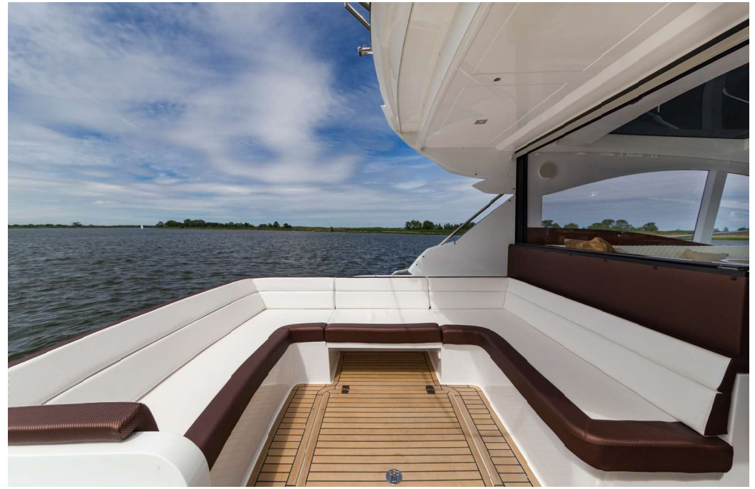
— Outside rest area