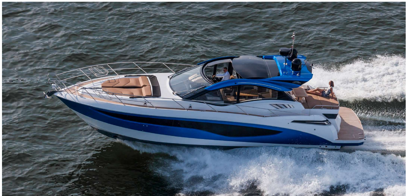
Perfect proportions compliment the sleek design —