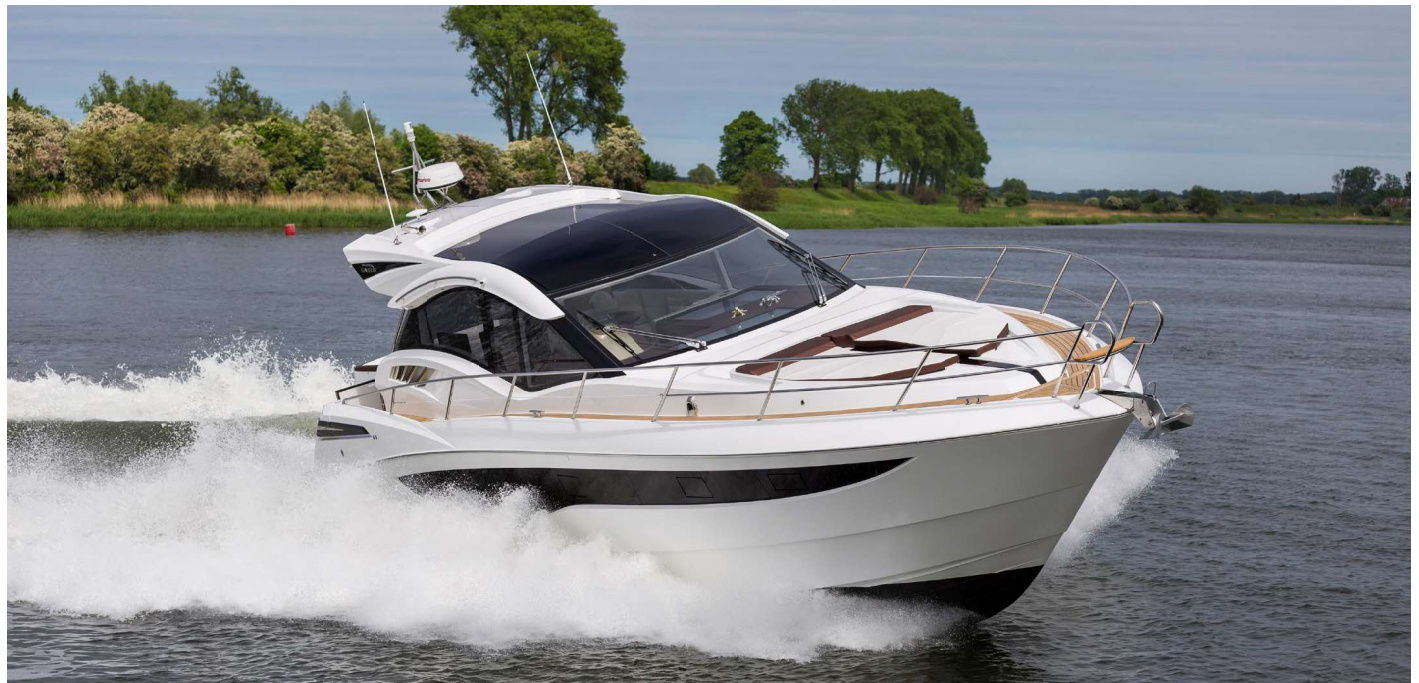
Tight handling and great performance —