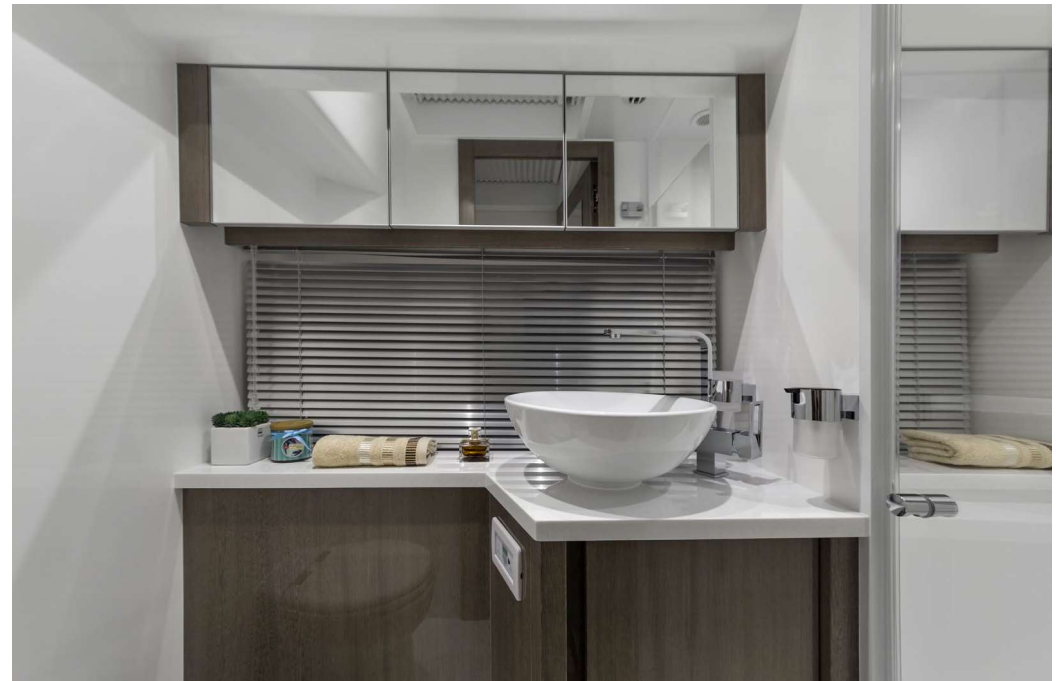
One of two bathrooms down below —