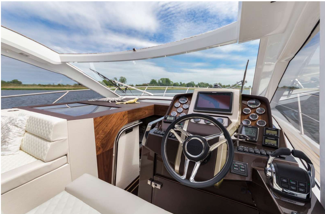
— Open the large sunroof and enjoy the breeze