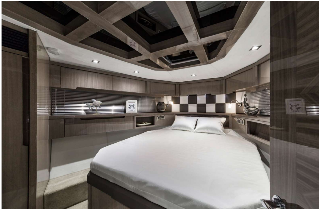
Forward VIP guest cabin with a series of skylights —