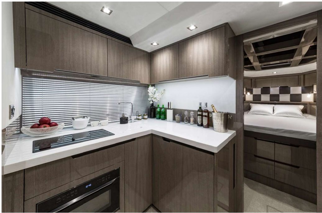
The galley is down below —