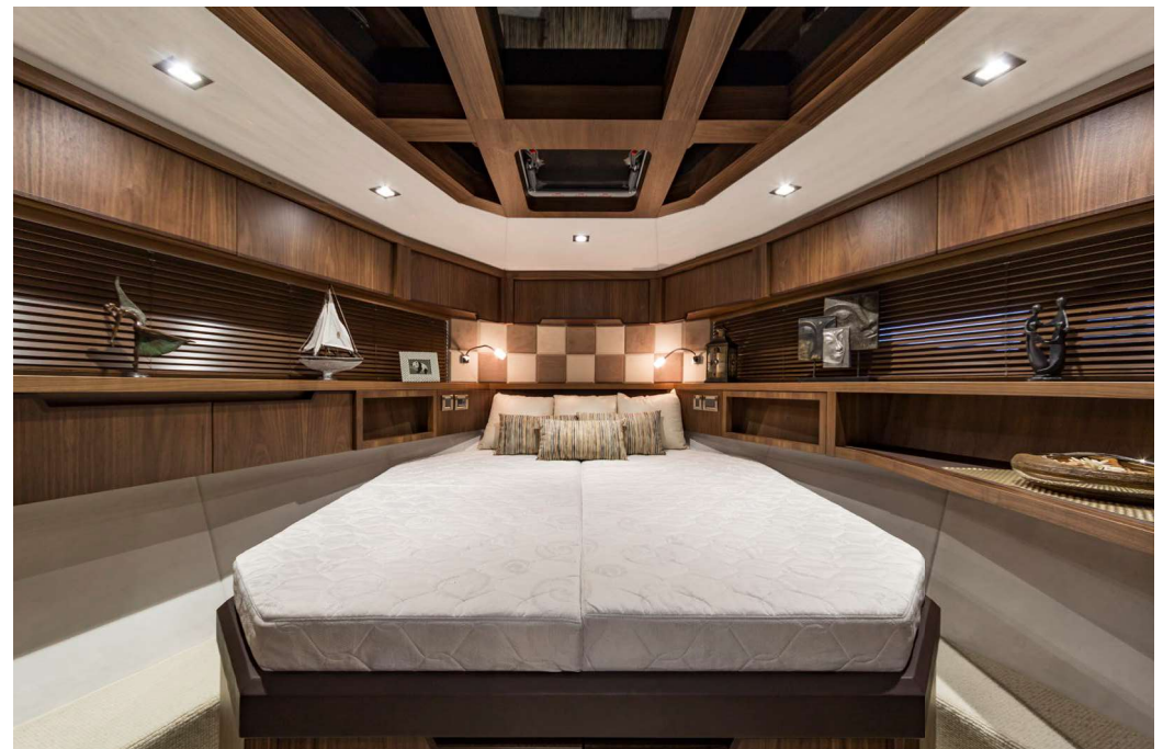
The forward cabin will hold plenty of additional storage