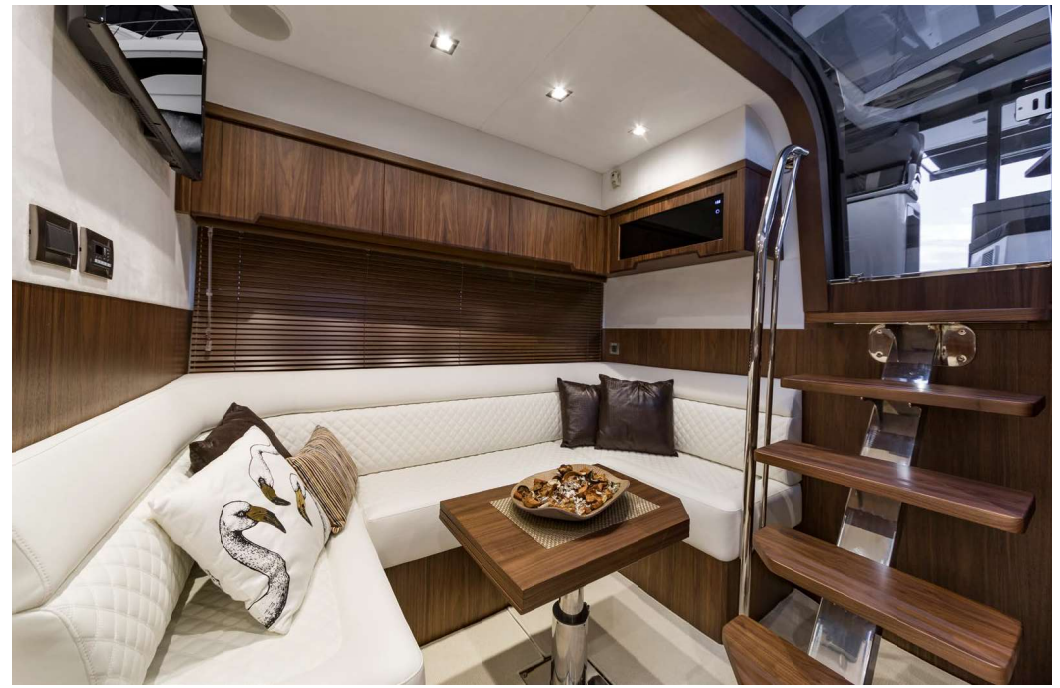
The dinette and rest area