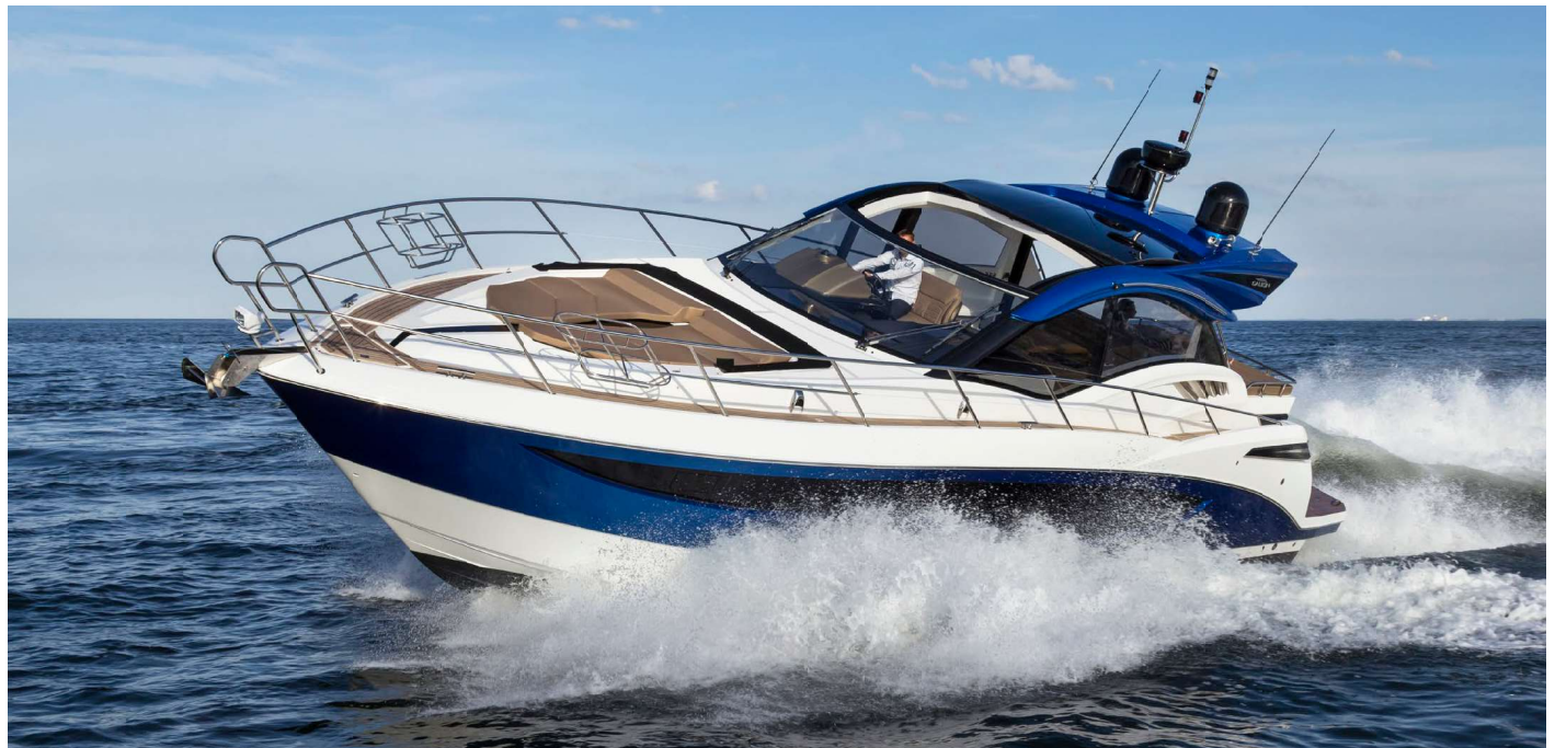
A sporty disposition of the 485 HTS —