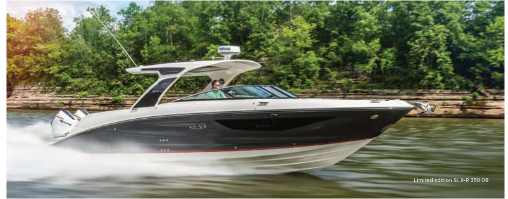
Limited edition SLX-R 350 OB