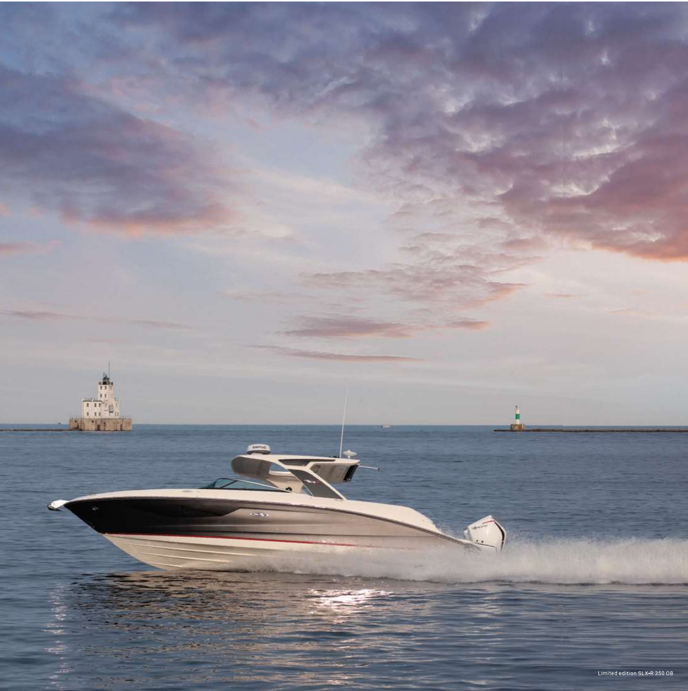
Limited edition SLX-R 350 OB