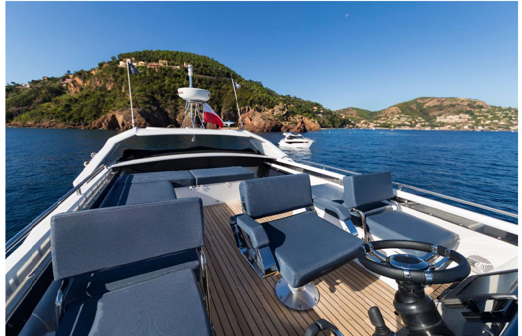
— The top deck offers sufficient space and can be closed off completely