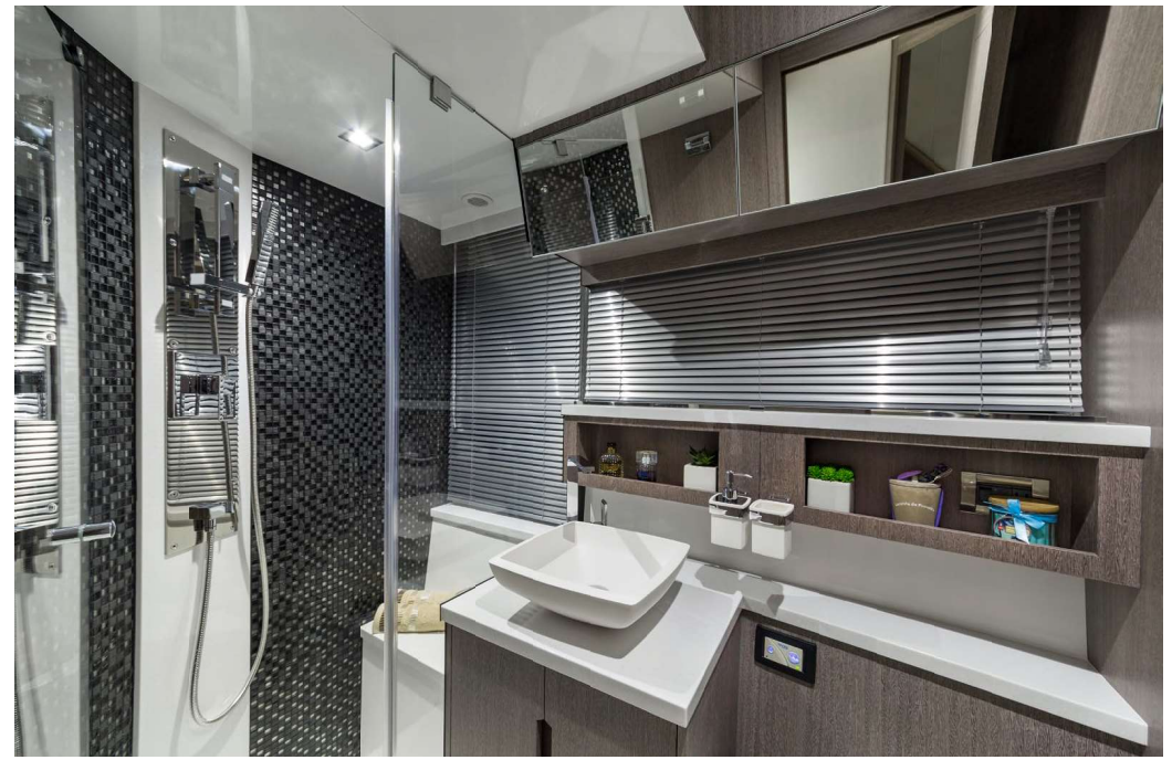
One of two bathrooms down below