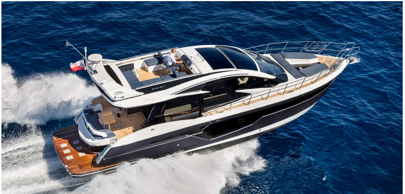
The SKYDECK boasts extravagant design yet remains surprisingly practical —