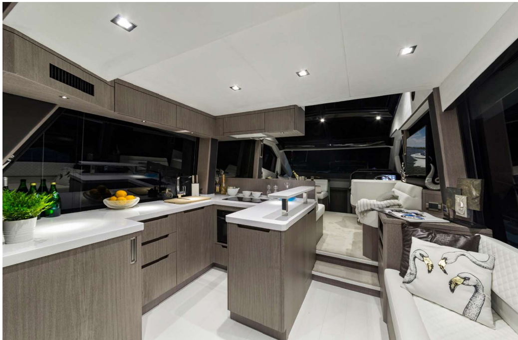
The kitchen area is moved back and can serve the outside bar