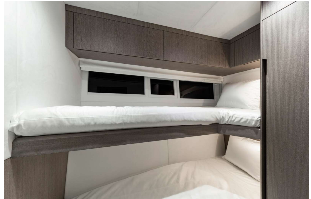
Guest cabin with bunk beds