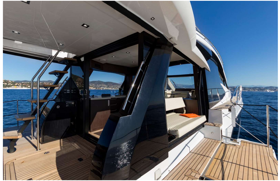
— Lots of extra space thanks to the Beach Mode