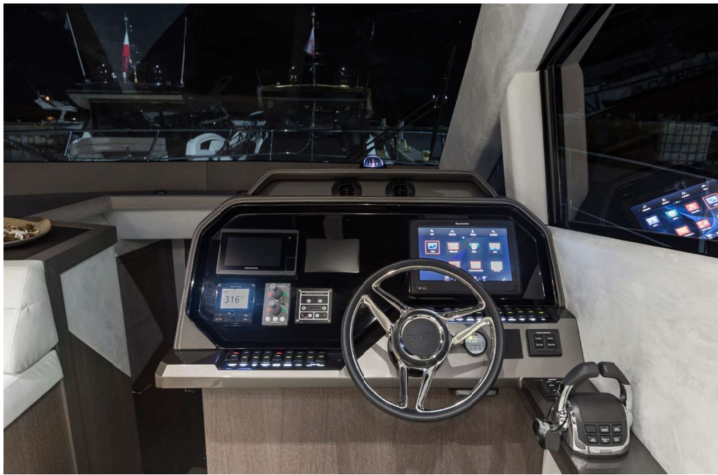
Centre console with all controls