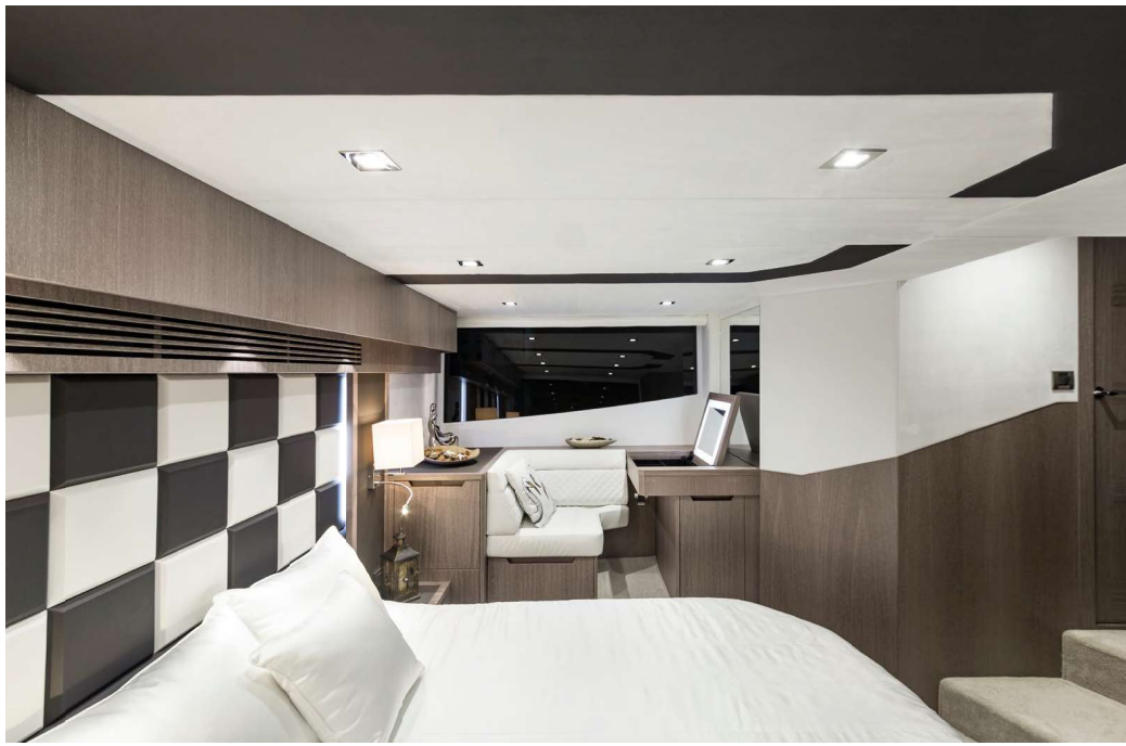
A make-up station in the master cabin