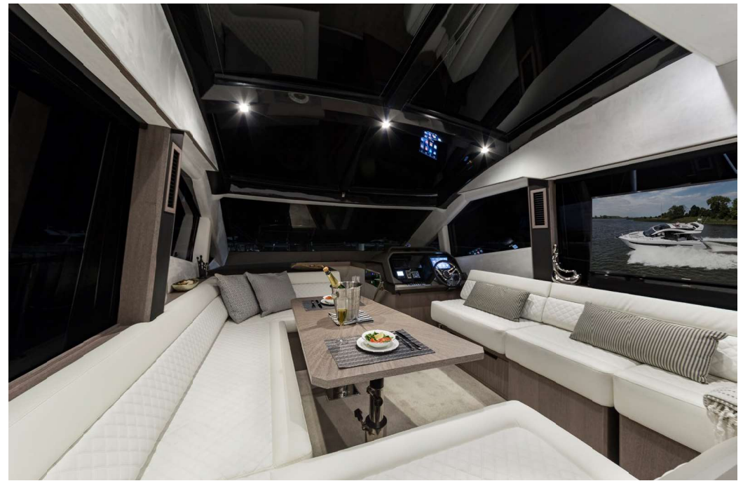
A large dinette opposite a drop down TV for entertainment