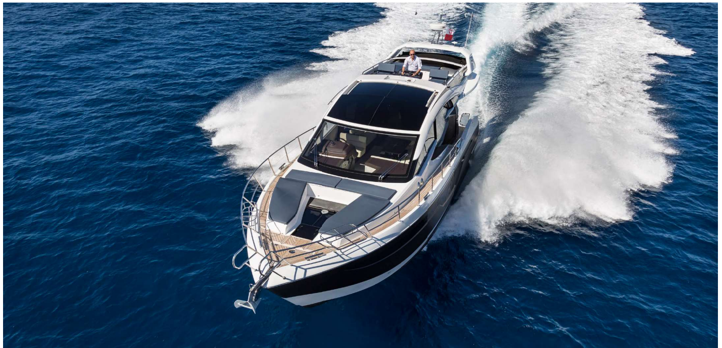
Incredible performance thanks to the Volvo IPS engine option —