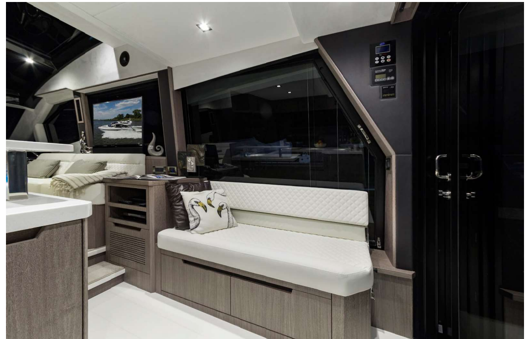
Leisure area can also face outside with the window slid open