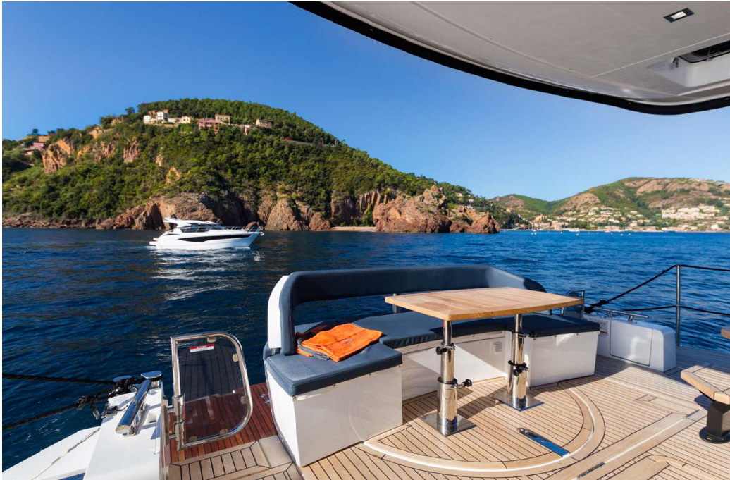
— Rotate the aft seat in any direction