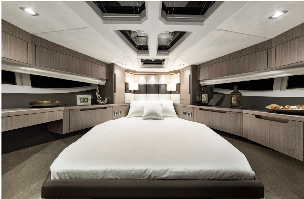
The forward VIP guest cabin with private bathroom