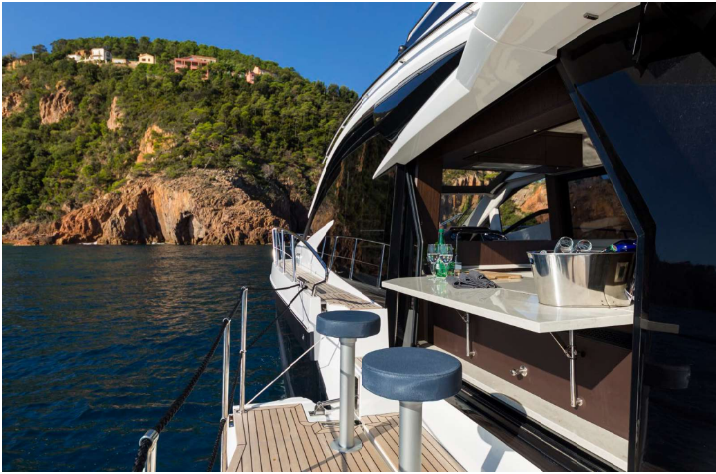
— Serve refreshments to the outside bar- amazing!