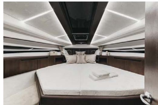
Bow bedroom sleeps two