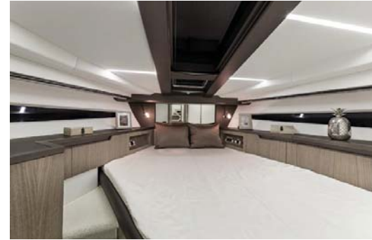
The guest's cabin holds a double bed and extra storage