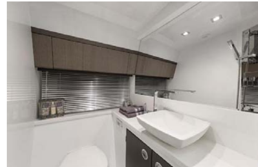
One of two bathrooms down below