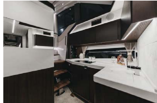
A well lit saloon is located below deck