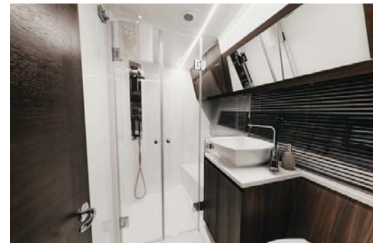
The owner's cabin has private access the bathroom