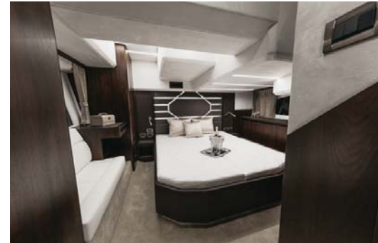
The owner's cabin offers great space and a smart arrangement