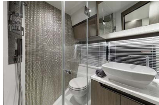
High quality fixtures in bathrooms