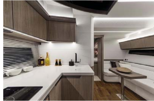
Saloon with galley area and a sizable dinette