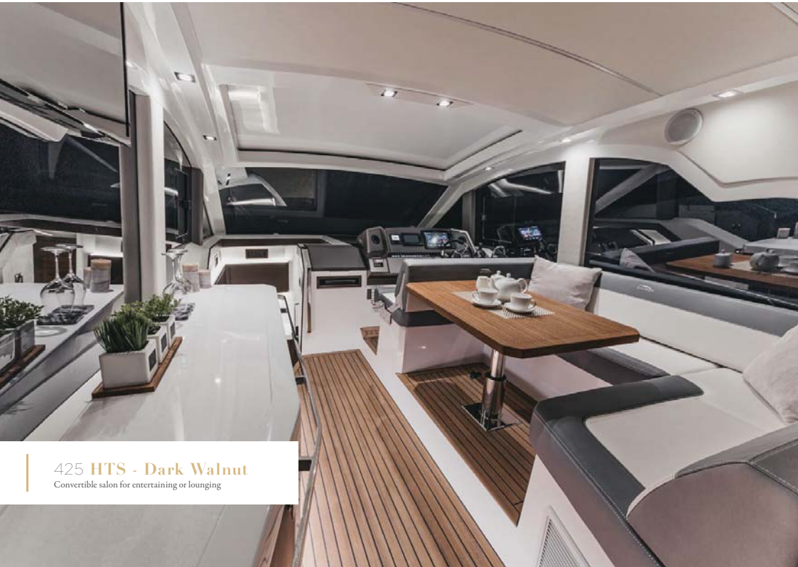
425 HTS - Dark Walnut Convertible salon for entertaining or lounging