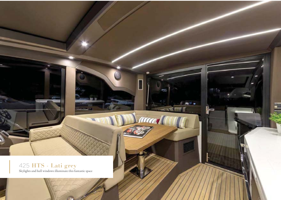
425 HTS - Lati grey Skylights and hull windows illuminate this fantastic space