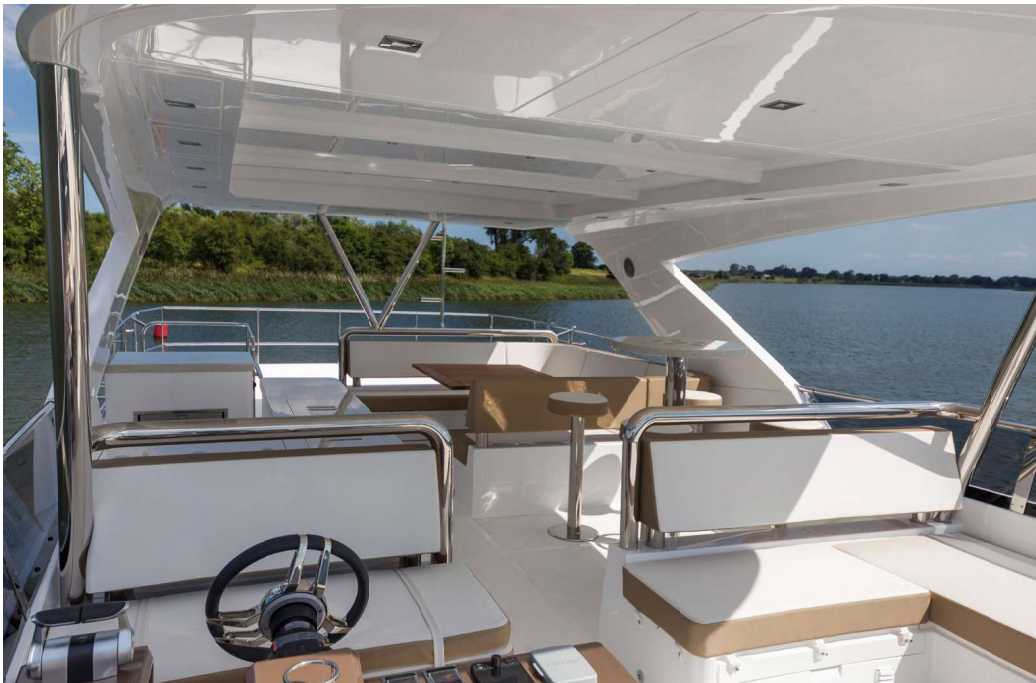
— The flybridge can be fitted with a bar and a Jacuzzi