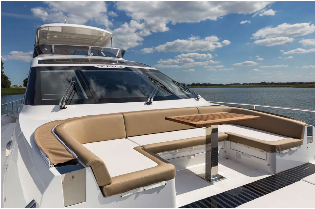
— Bow rest and leisure area