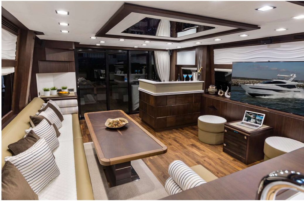
Entertainment area with a bar to serve refreshments