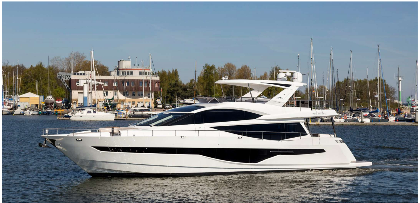
Striking exterior lines of the 780