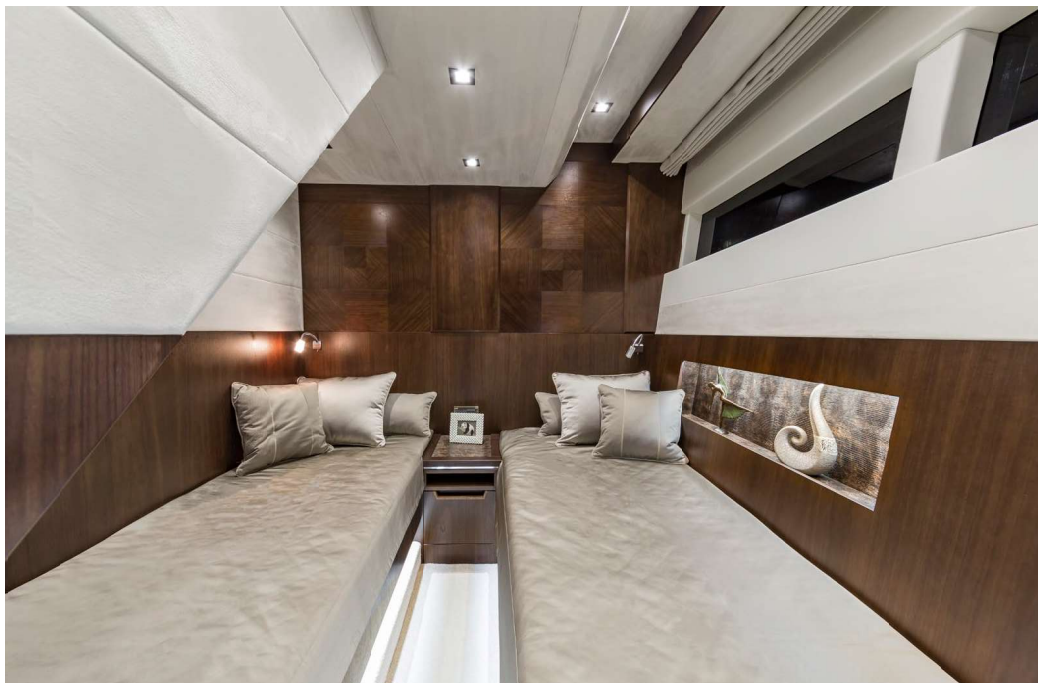
Twin, guest cabin