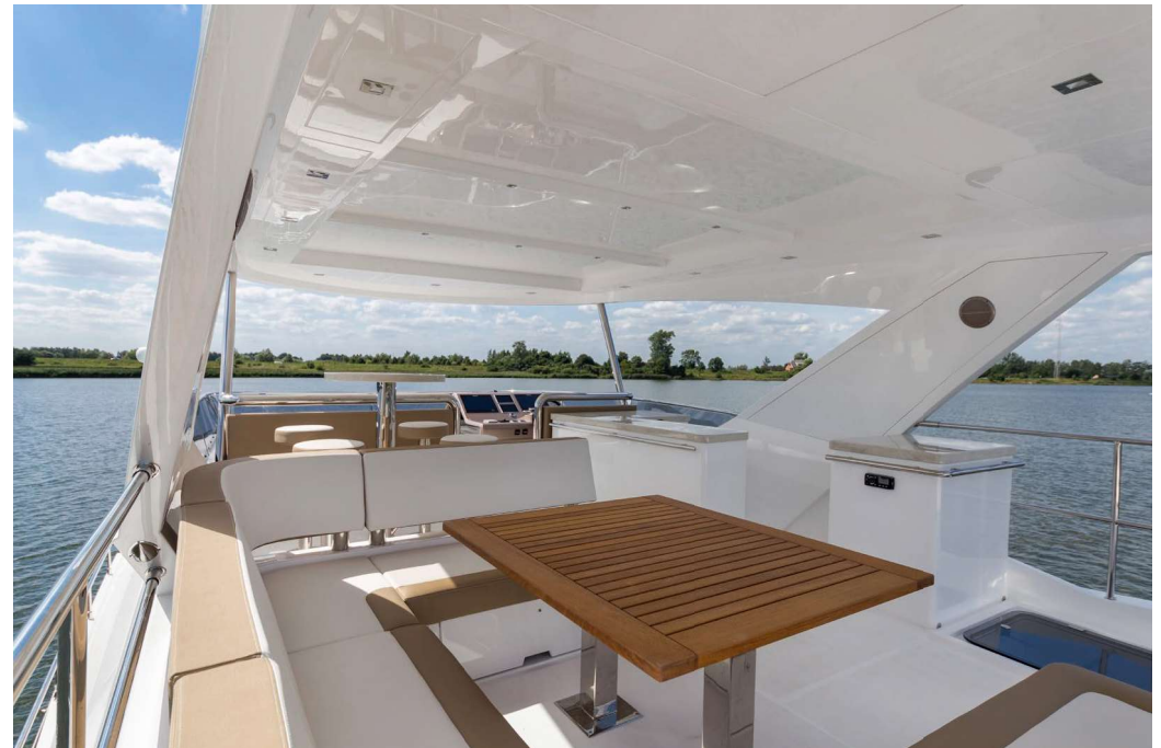
— The spacious flybridge will come in handy for entertaining guests