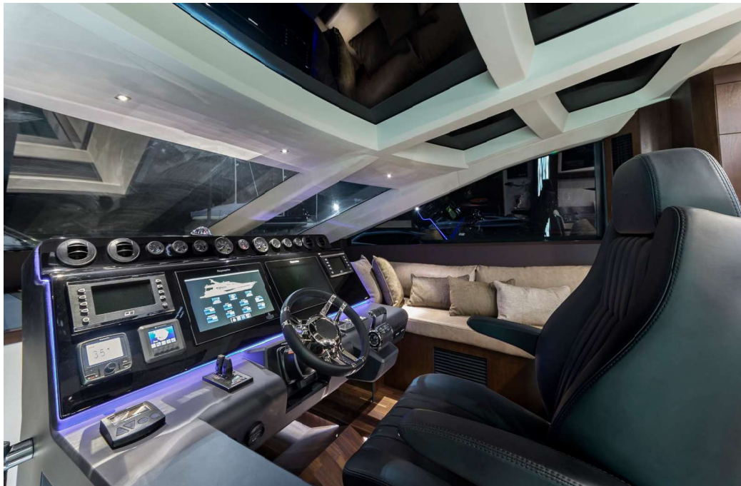
The helm station and command centre