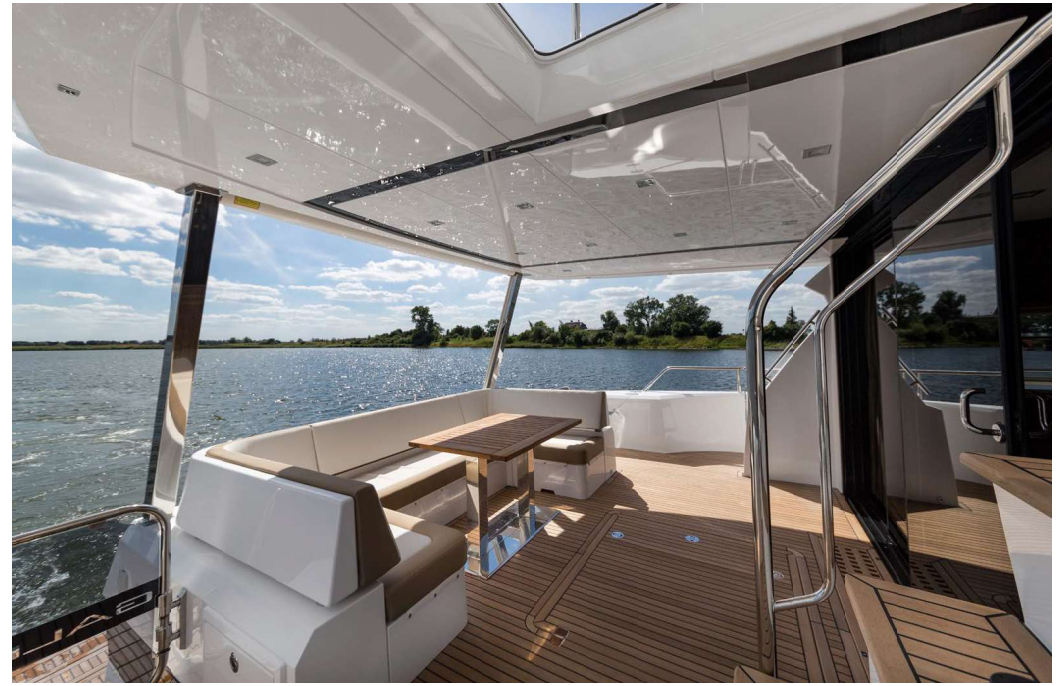
— Cockpit seating with easy access to the top deck