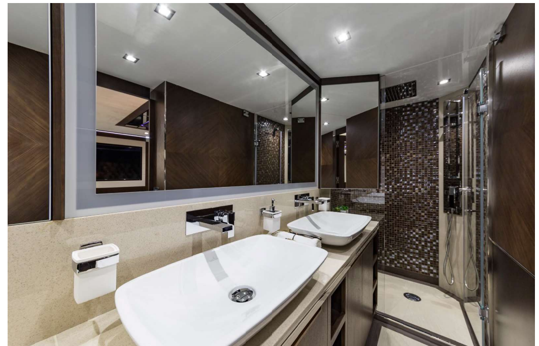
Master bathroom down below