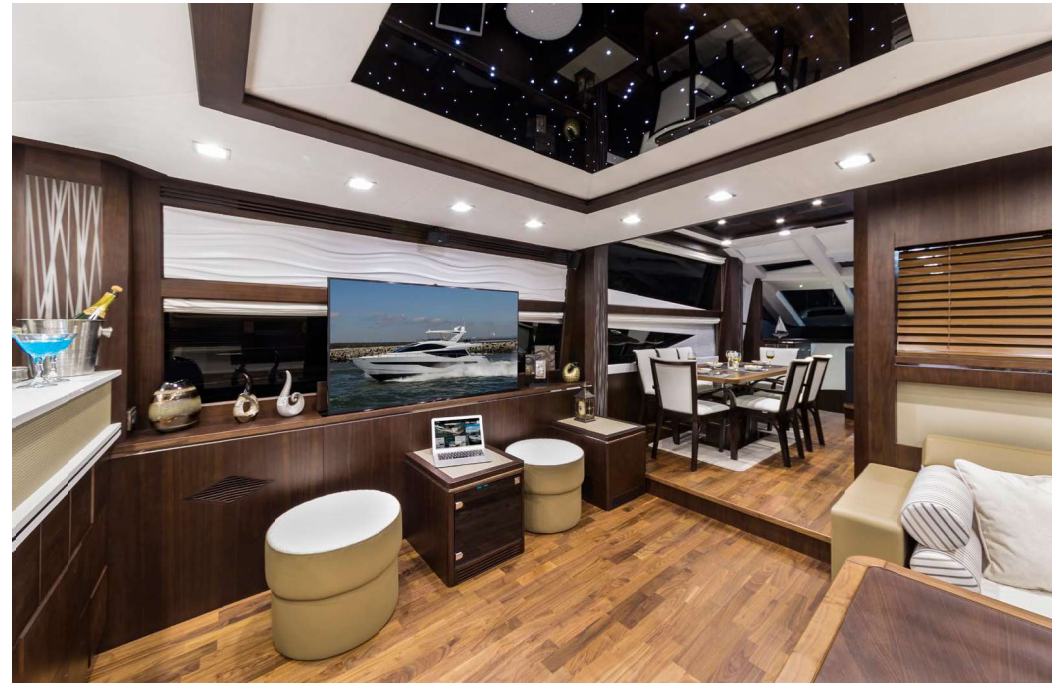
The large TV can be hidden away