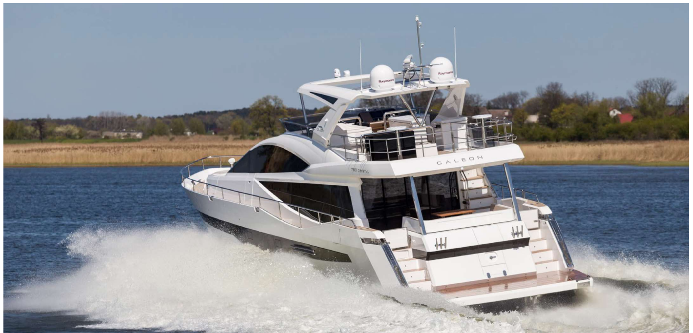
Gain access to the crew cabin from the bath platform