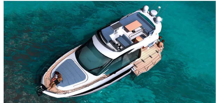
Put down the sides and extend the amount of space in the cockpit - genius!