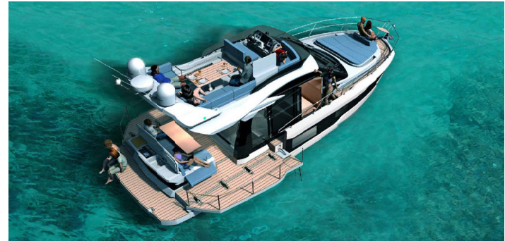
Cockpit seating can be turned into a sundeck

400 FLY The large flybridge is the centre of attention