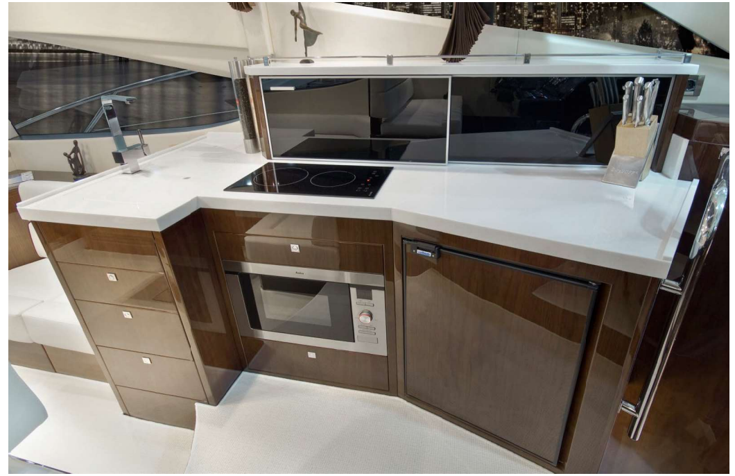
— A well equipped galley