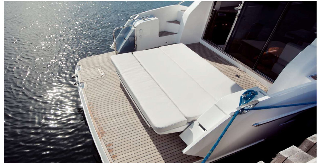
— Cockpit seating turned into a sundeck