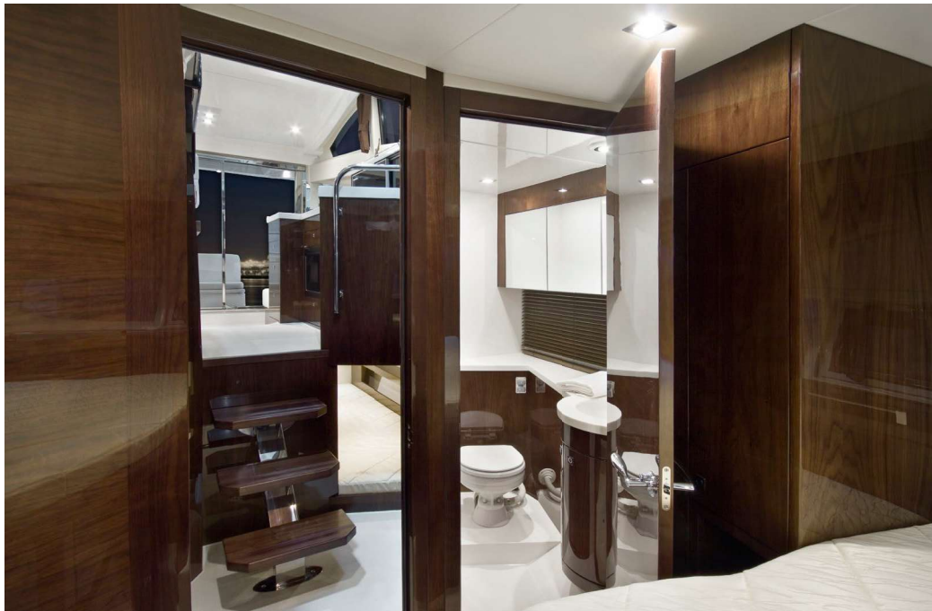
— Up to three cabins down below