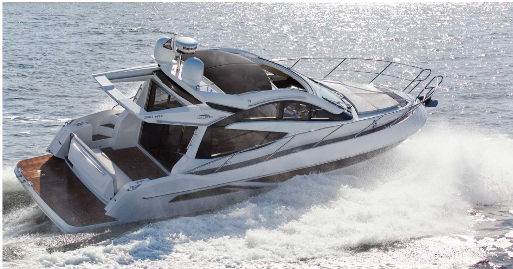
— The roof over the cockpit is retractable