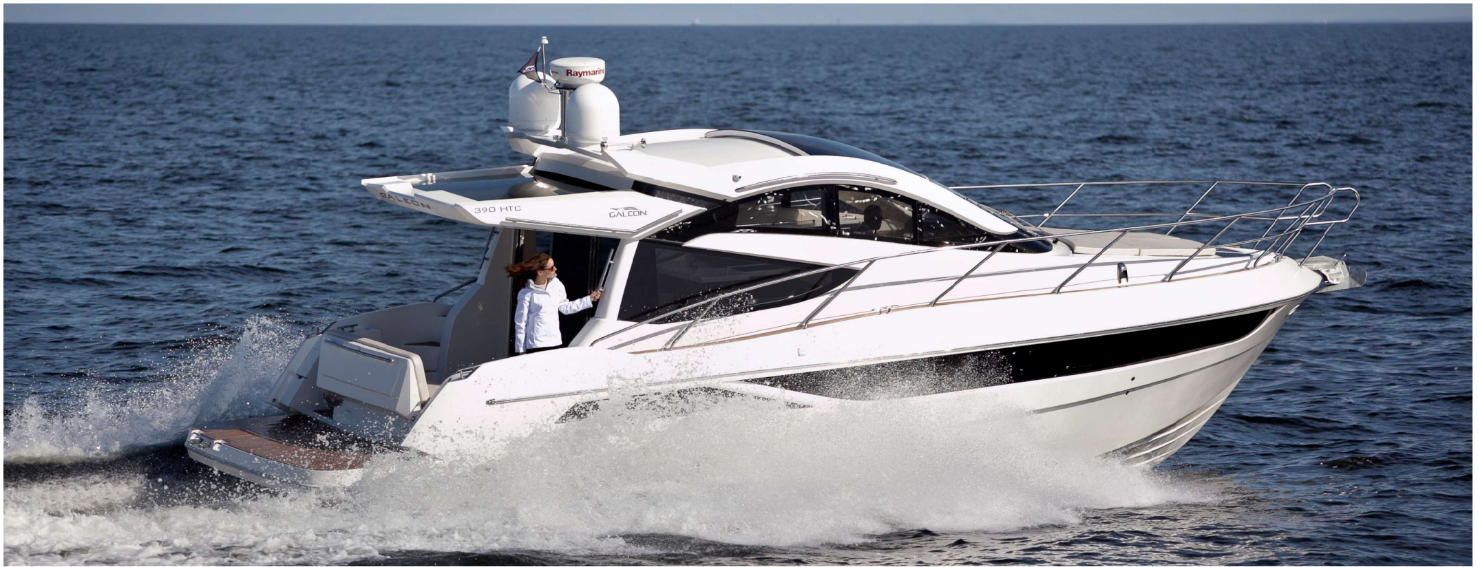
— Exciting design matched by flawless performance