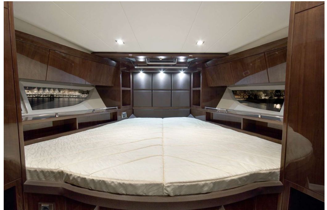
— The owner's quarters