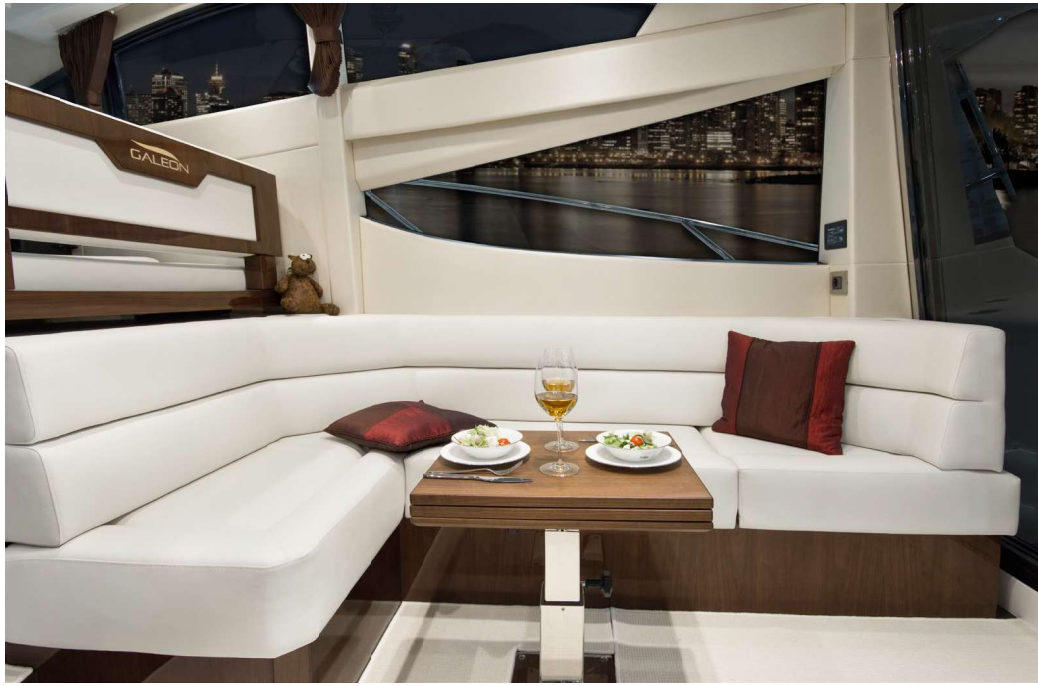
— The dinette is moved back