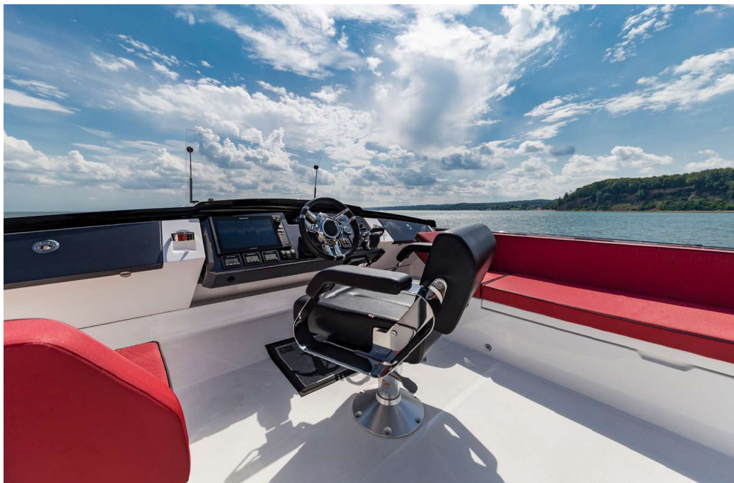
The top helm station allows for full control over the yacht