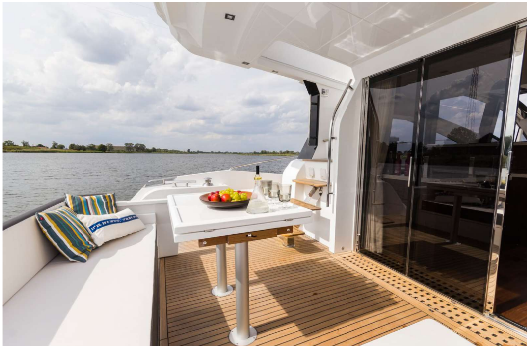
— Take respite in the cockpit area