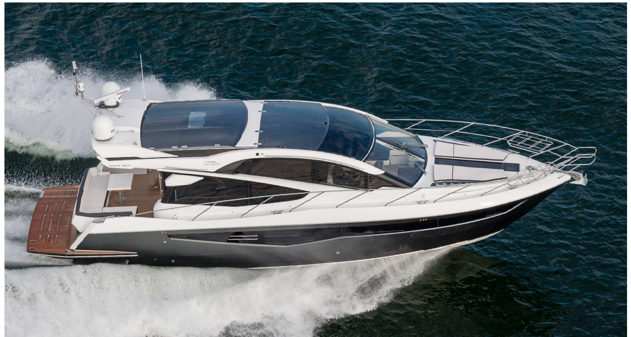
The top deck can be completely hidden away! —