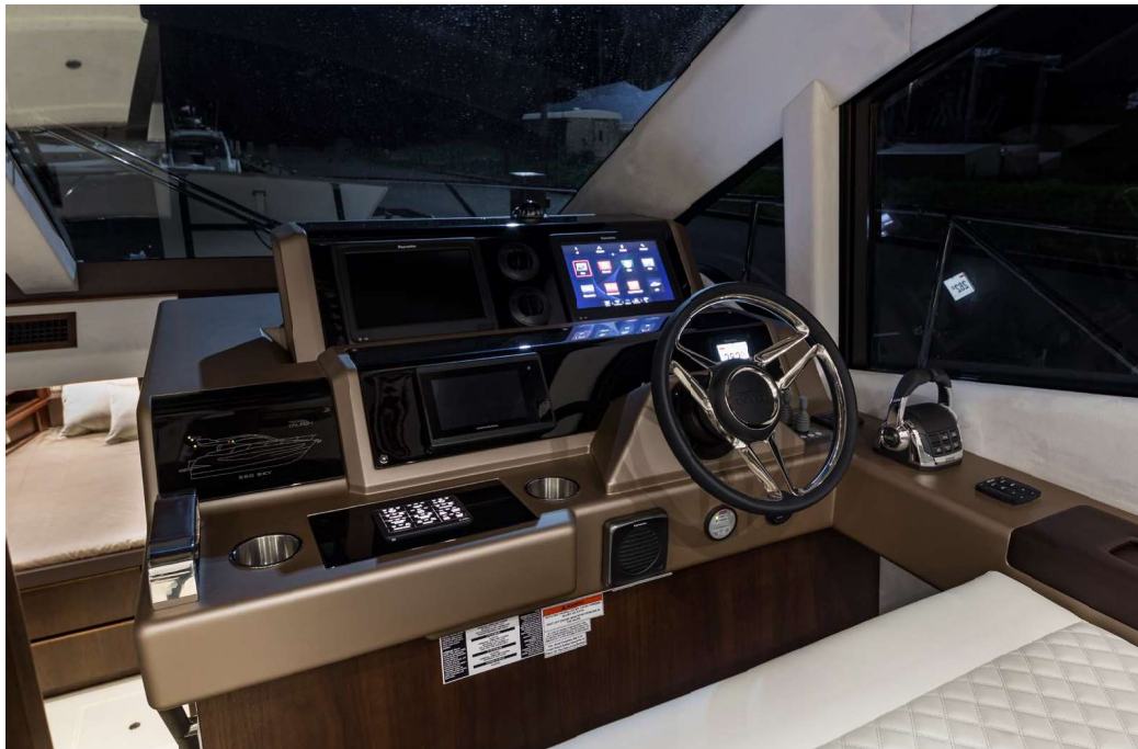
A high-tech helm station gives total control over the yacht