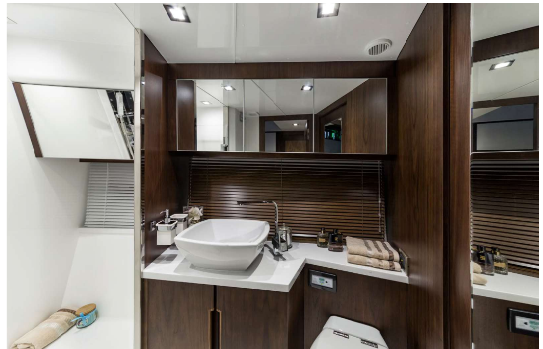
Ample bathroom space with separate shower