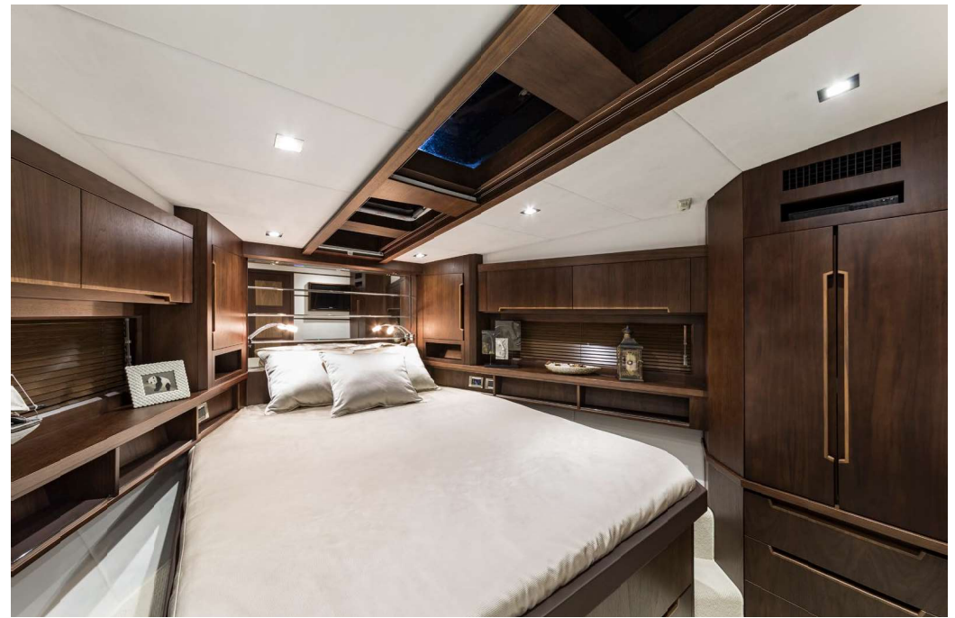
Forward VIP cabin