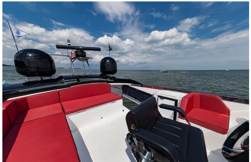
Quickly close off the SKYDECK when not in use!