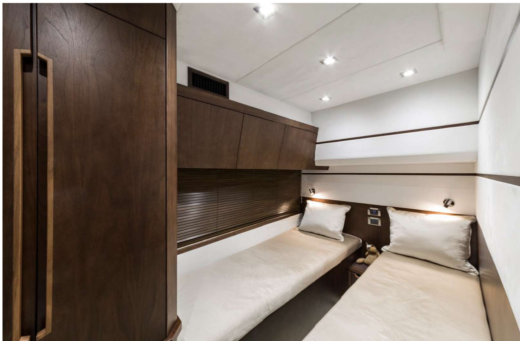
Twin beds in the guest cabin