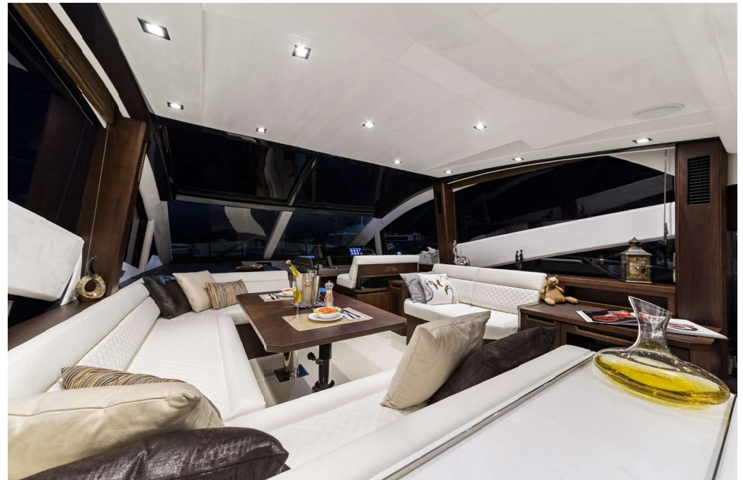
The forward facing rest areas