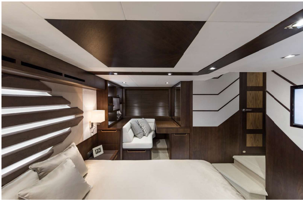
A rest and make-up area in the owner's cabin