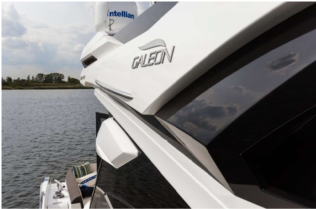
— The sleek and edgy design of the 560 SKYDECK