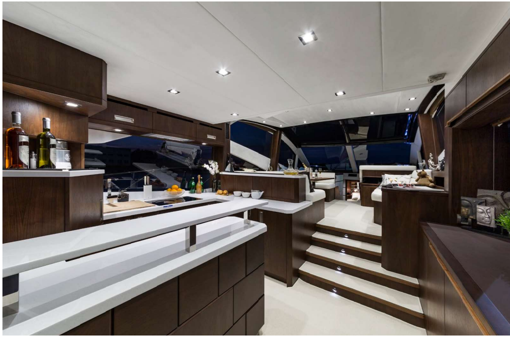
Kitchen area is moved back