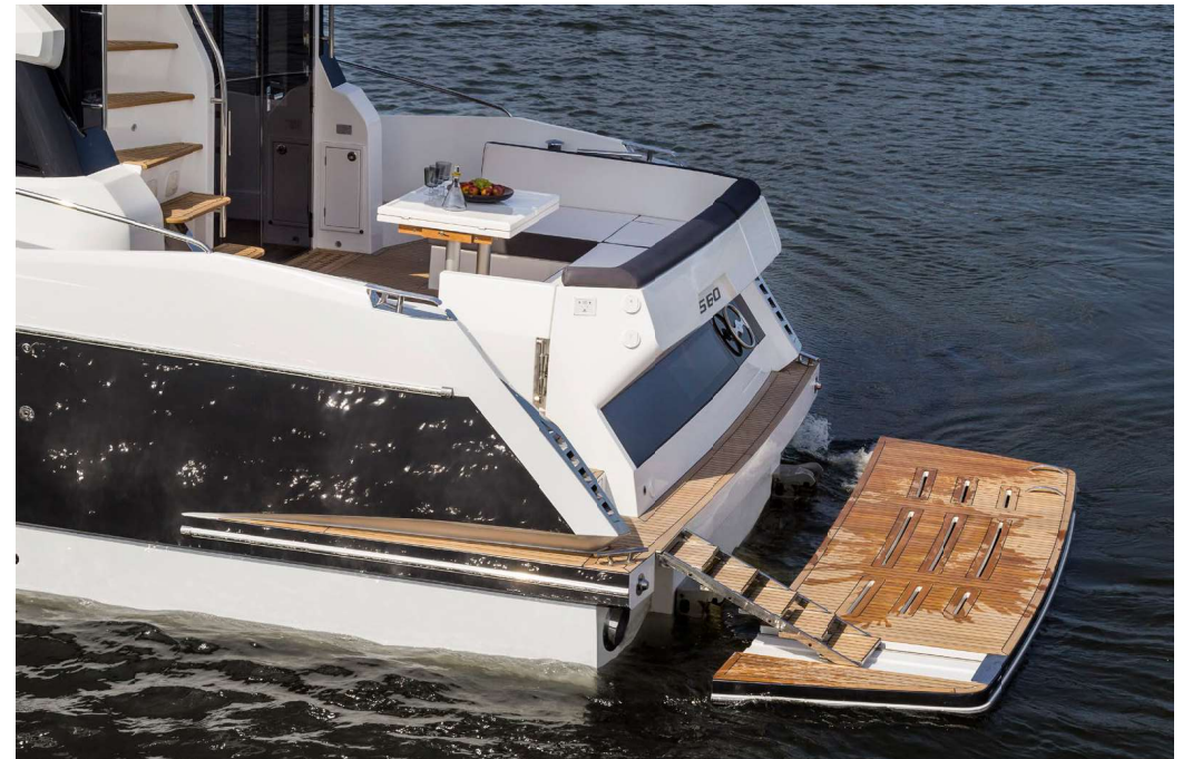
— A powerful hydraulic aft platform