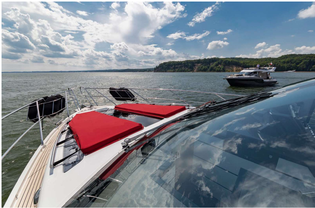
Bow rest area