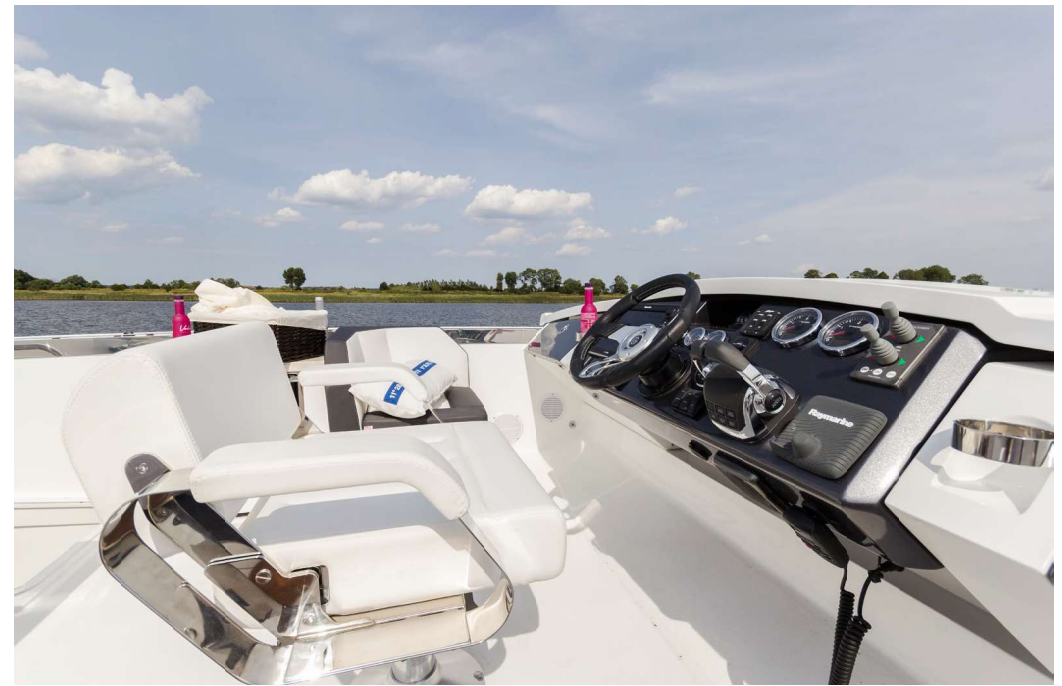
— Great visibility and full control from the top deck