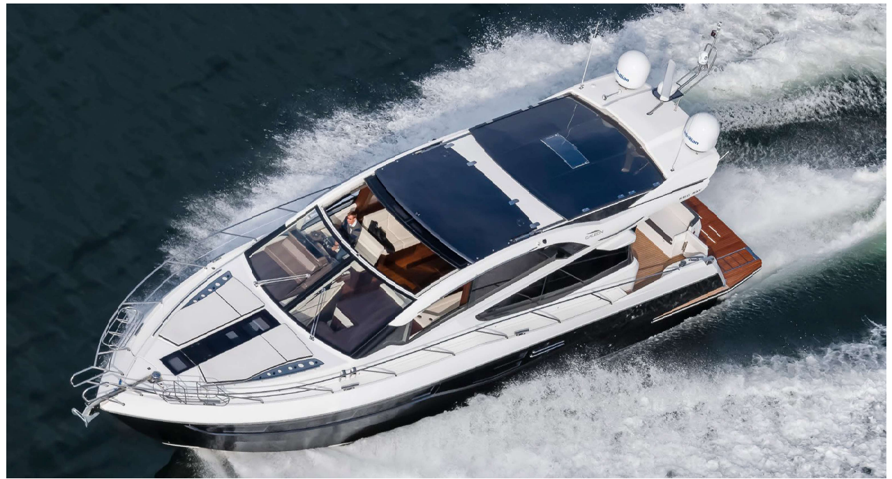
Open the sunroof even during cruising to air the interior —