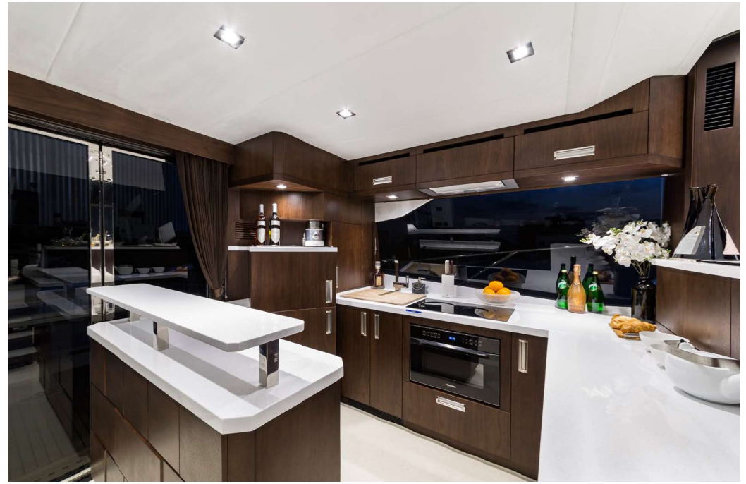
Find all the necessary equipment fitted