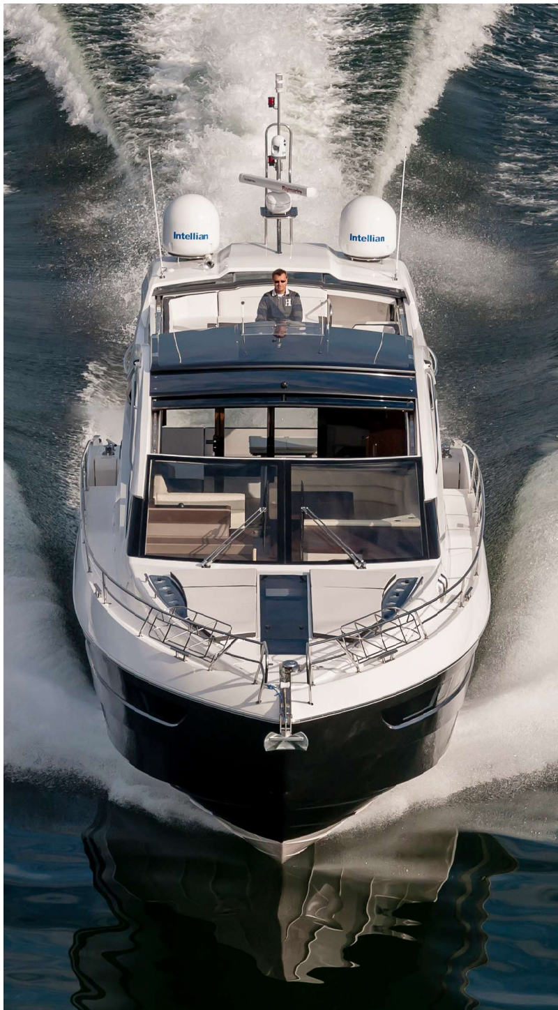
A stunning performer —