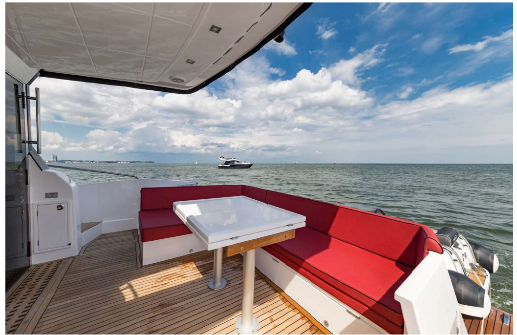
Cockpit leisure area with a table