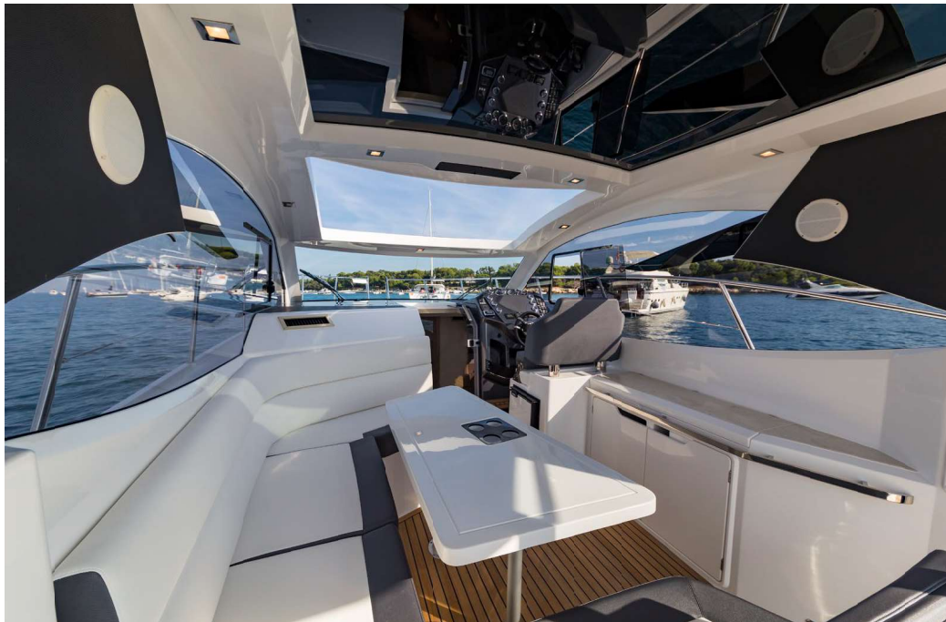
— A wet bar on the main deck