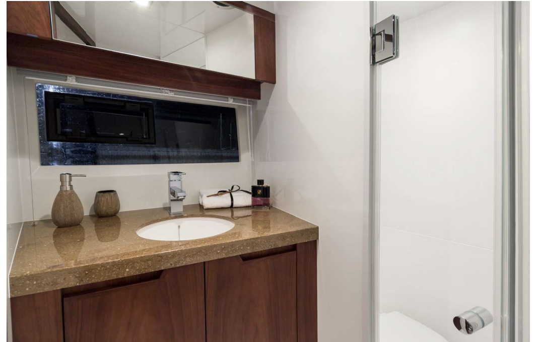
The bathroom holds a head and a shower —