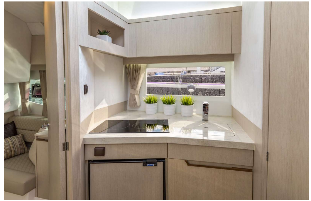
A convenient galley can be found down below —