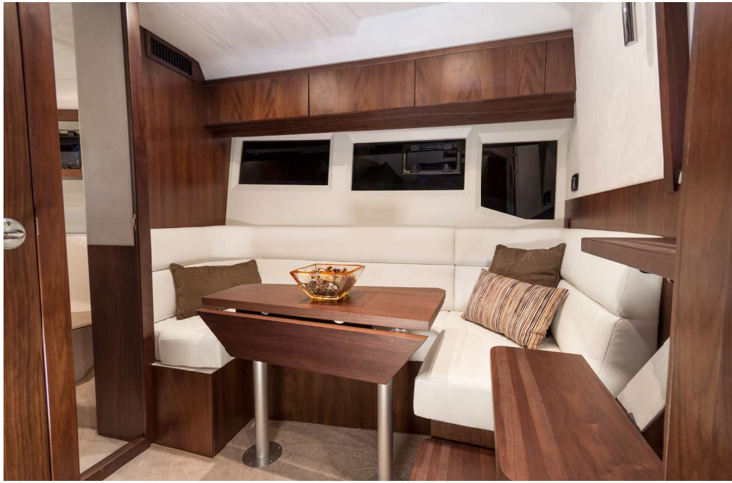
A rest and dining area in the saloon —