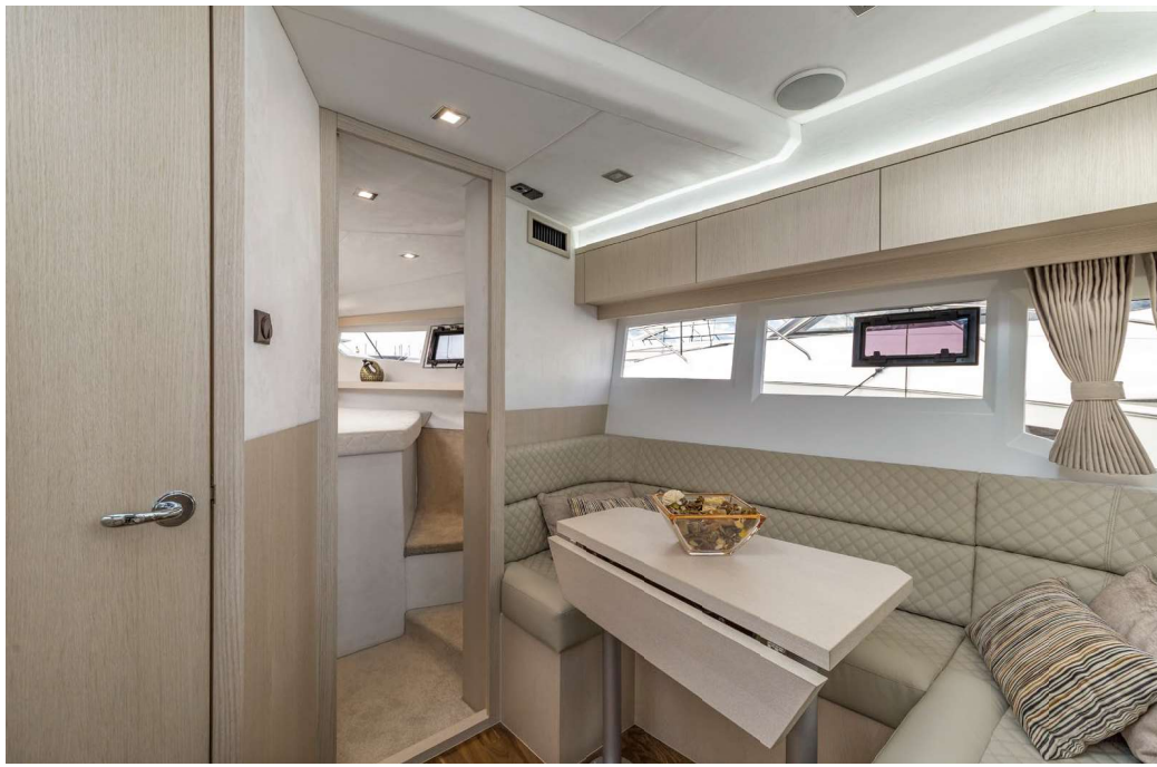
Extend the table or take it out completely to create extra space —