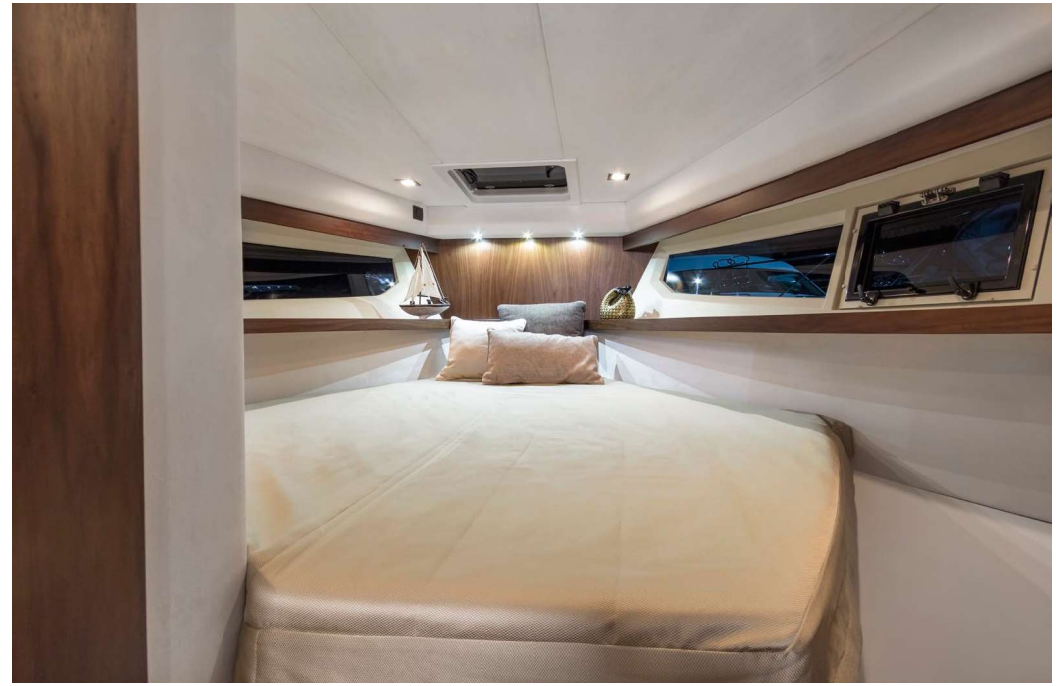
The bow cabin offers a double bed —