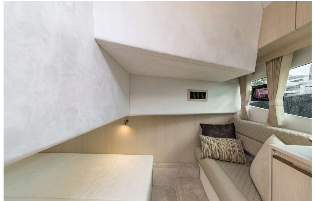
Double bed and a rest area in the guest cabin —