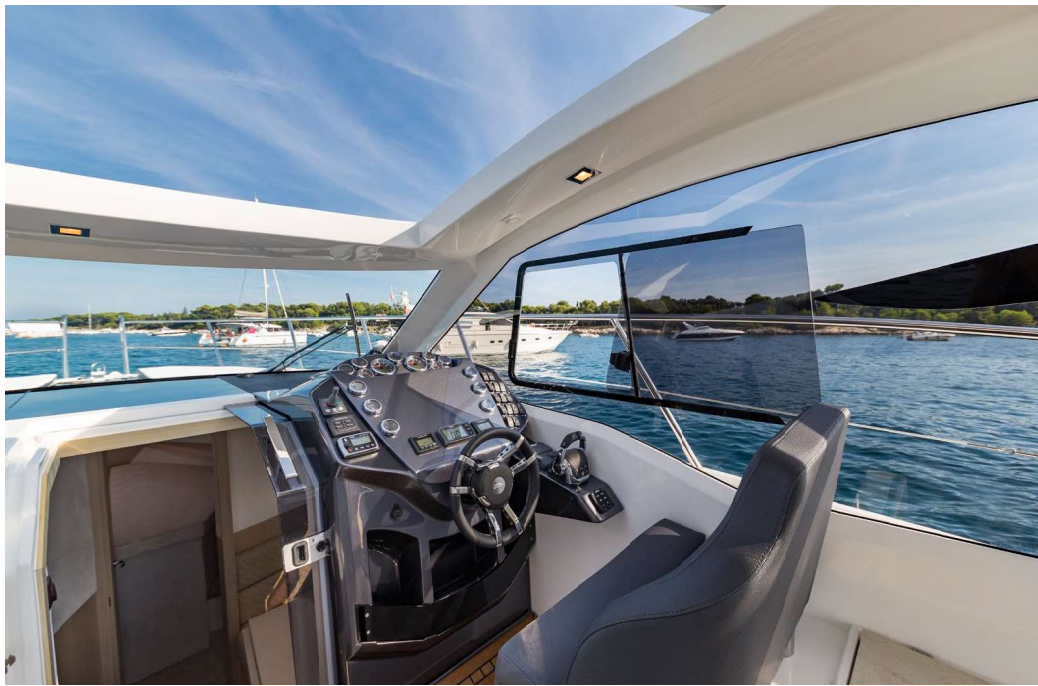
— Open the sunroof and slide the window to let the air in