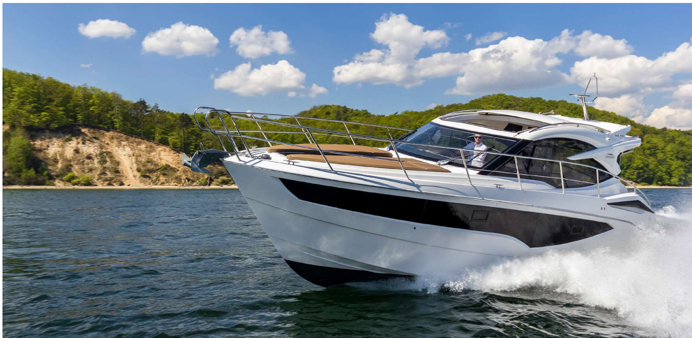
Visually stunning, the 365 is a true sport cruiser

A striking side profile of the 365 HTS promises a thrilling ride which the expertly designed hull can deliver in any weather conditions.