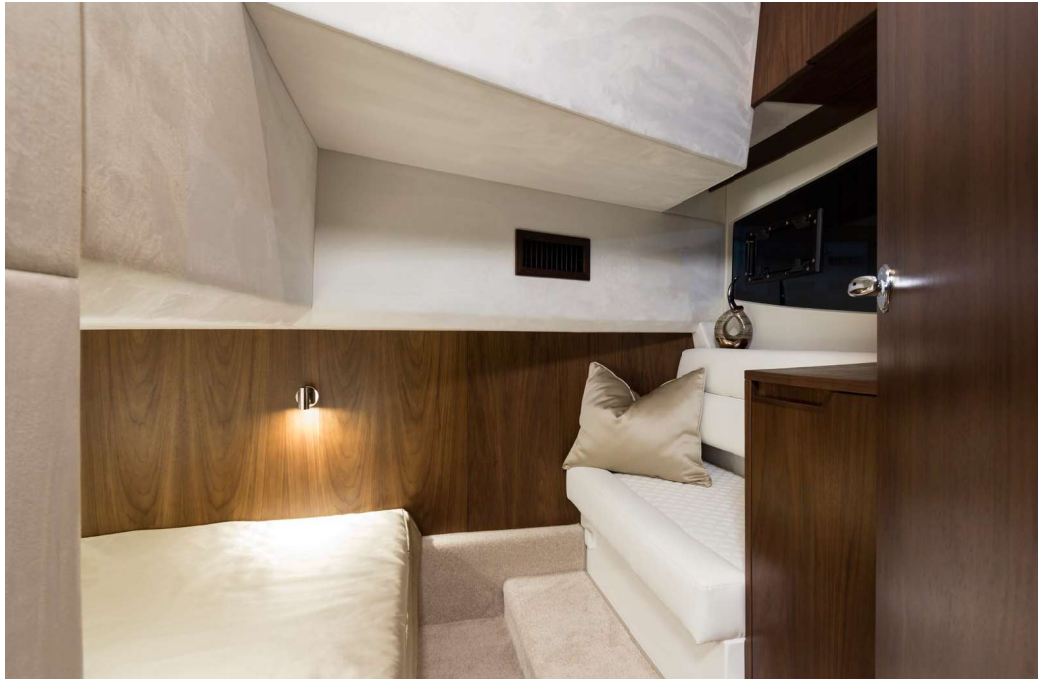
Double bed and a rest area for the guests —