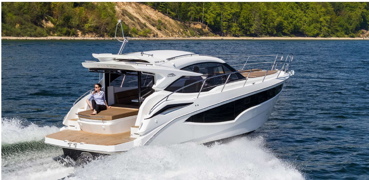
Open the cockpit window and enjoy the comfy sun pad