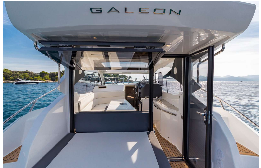
— Closed or open cockpit - you decide!