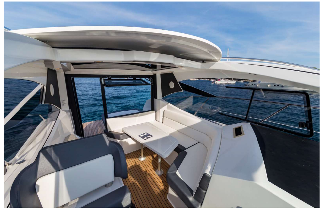
— Great visibility all around