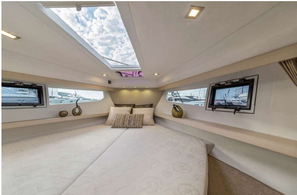
Forward cabin with a magnificent skylight above —