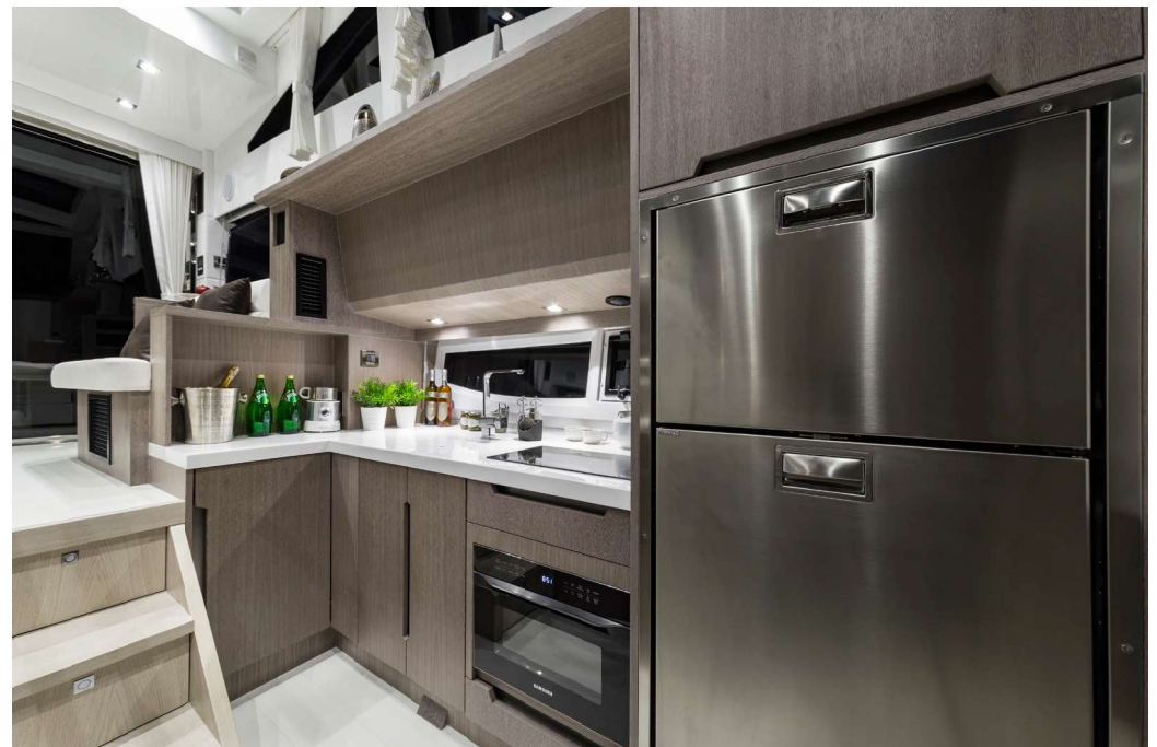
In the two cabin version the galley is moved down below —