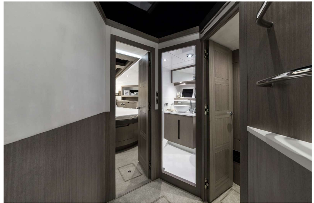
Two bedrooms await the guests —