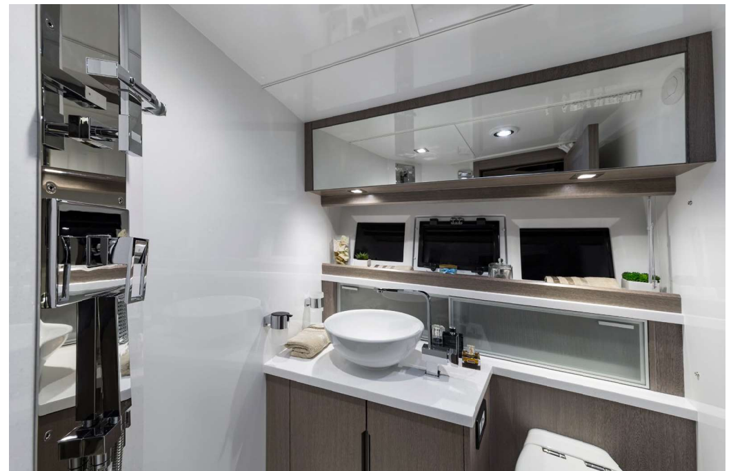
Bathroom with shower down below —