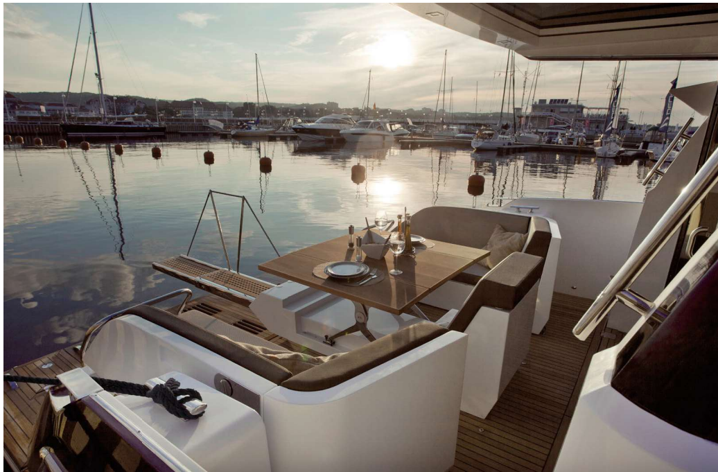
— Cockpit in dining mode with the pop-up table