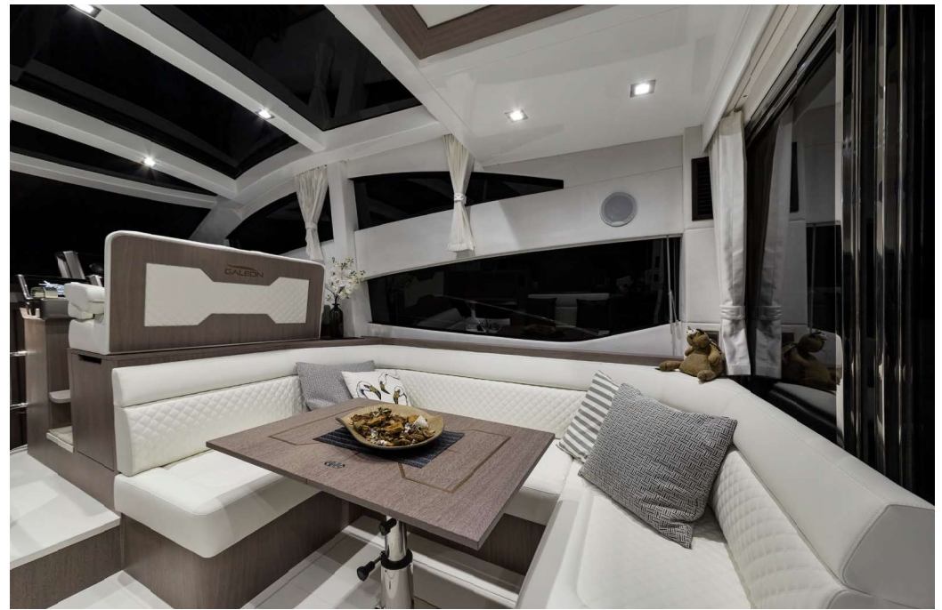
Dinette moved back —