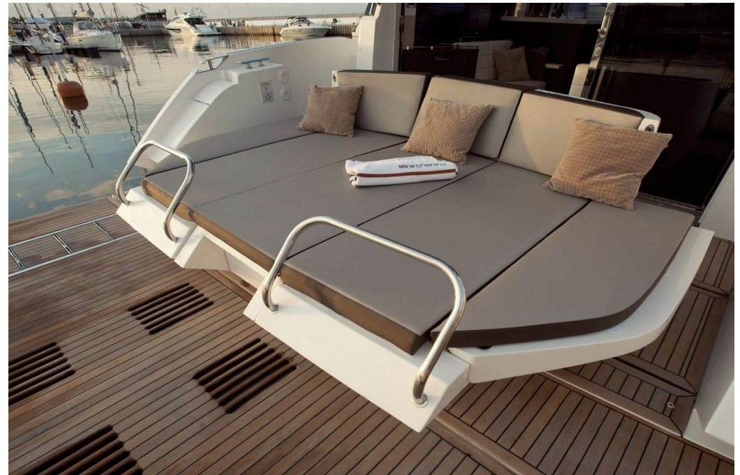
— Extend the sundeck if needed