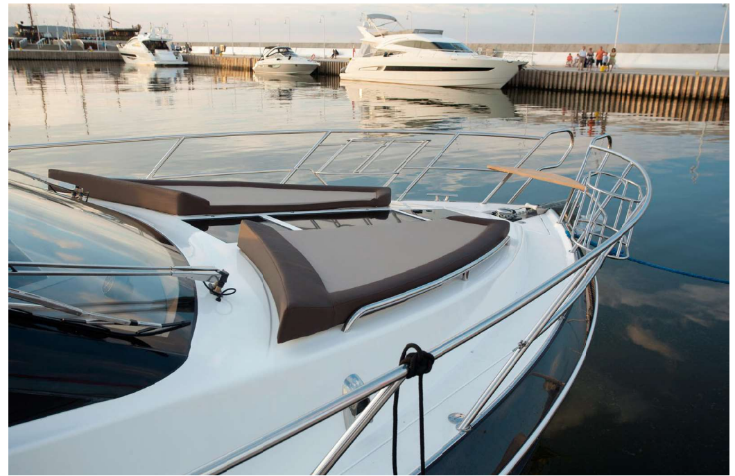
— Bow sundecks