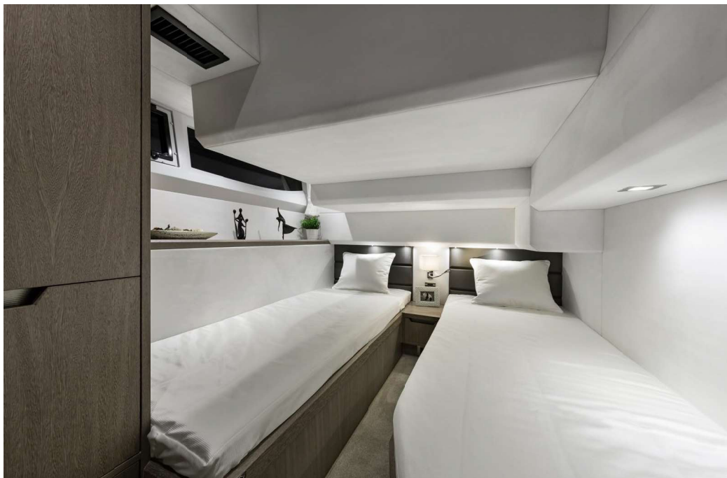
A twin guest bedroom —