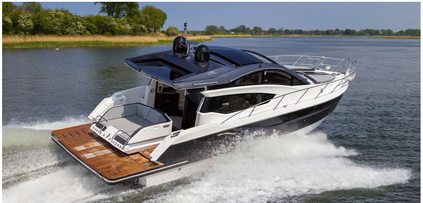
A transformable cockpit area