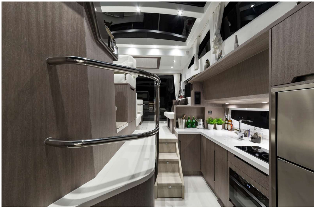
The galley can take place of one of the cabins —