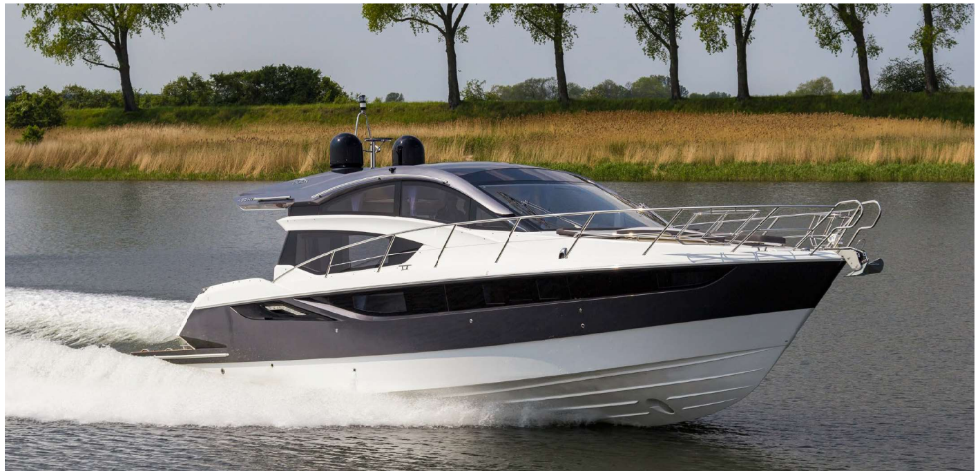
Great design and performance of the 430 hardtop

The 430 HTC offers a dynamic exterior with a large glass sunroof over the helm