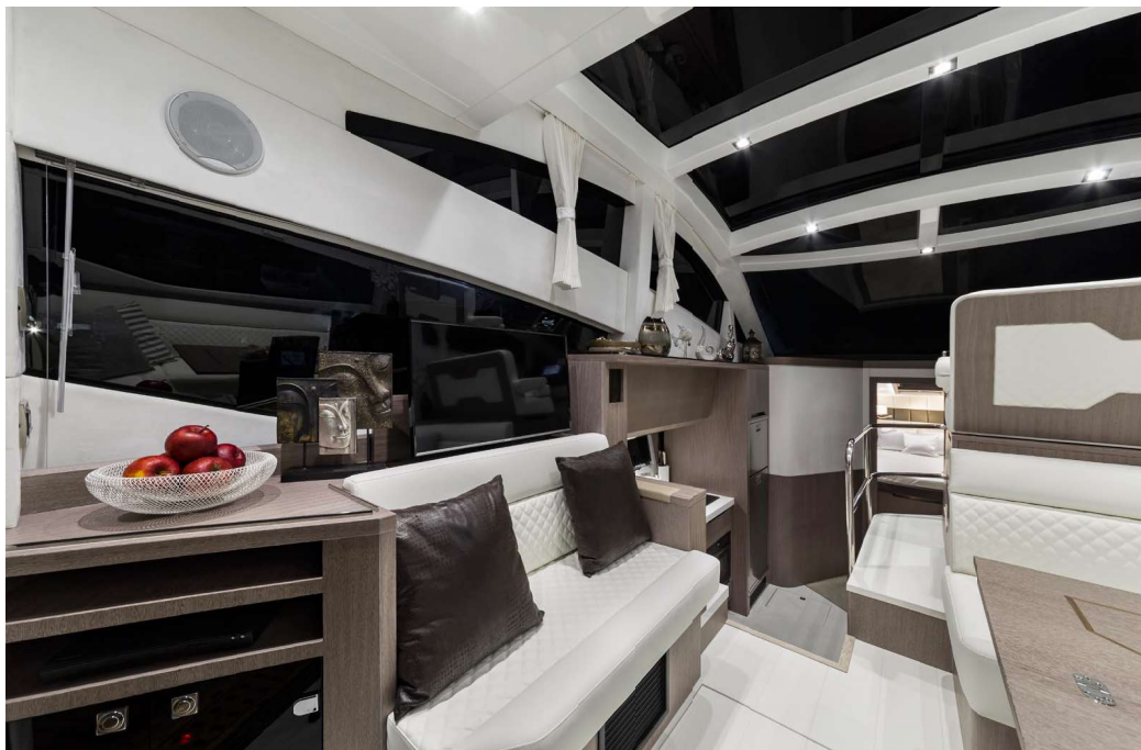
Rest area opposite the dinette —