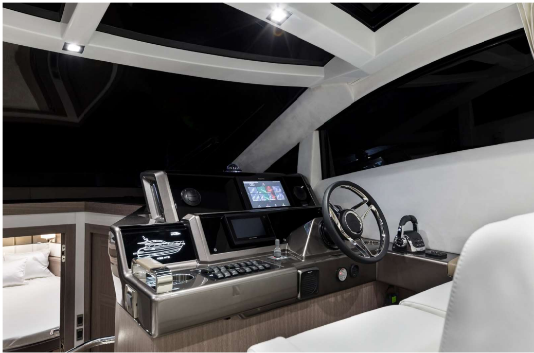
The helm station to control the yacht —