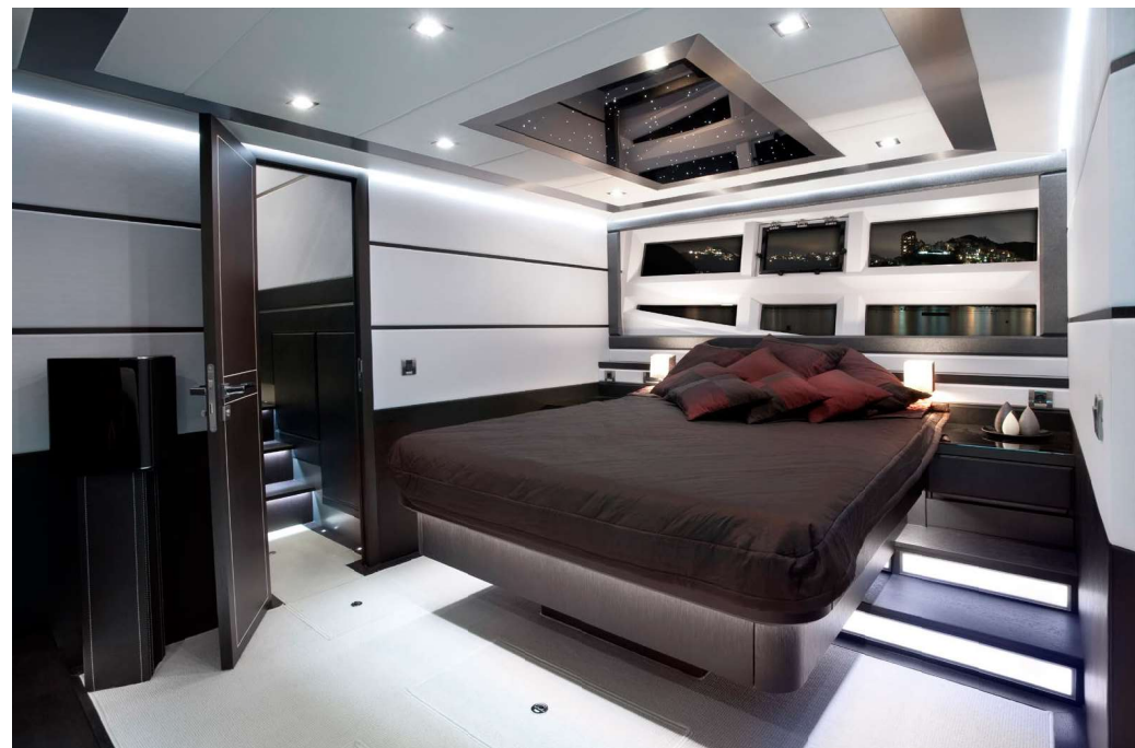
A well lit owner's cabin with private bathroom