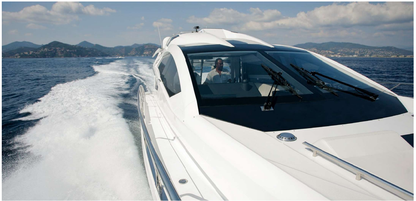
Sleek design lines of the 700