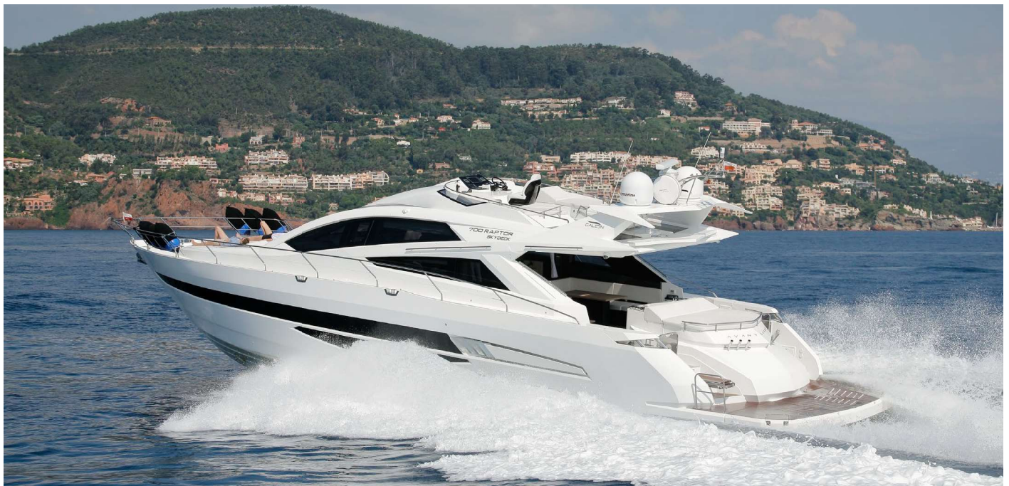
Incredible performance of the 700 SKYDECK —