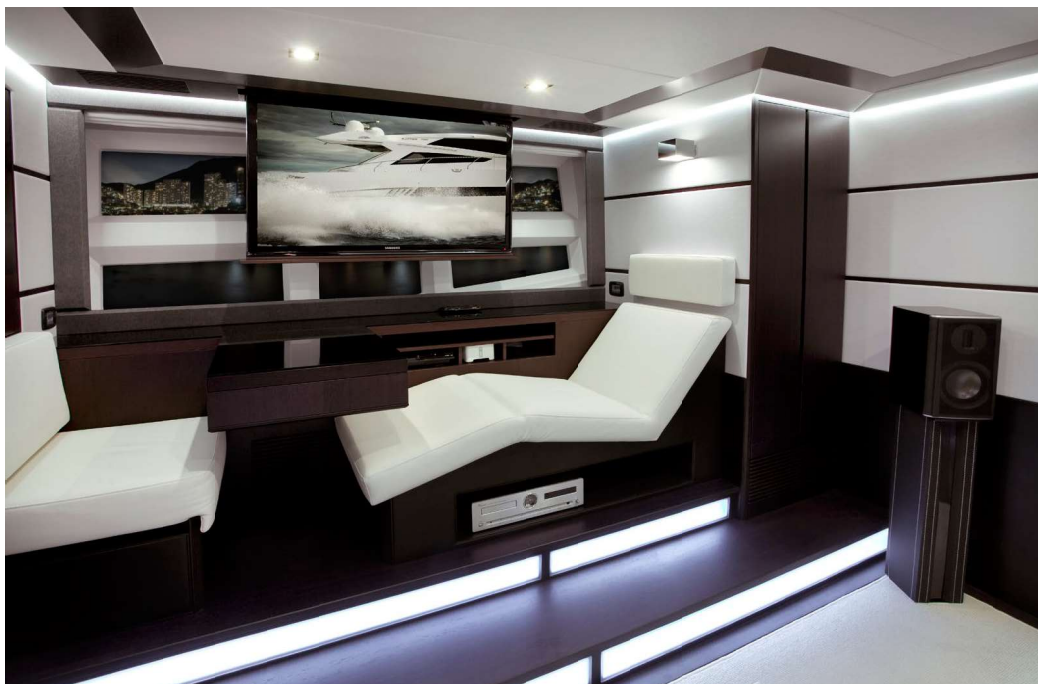
Lounge and make-up station in the owner's cabin