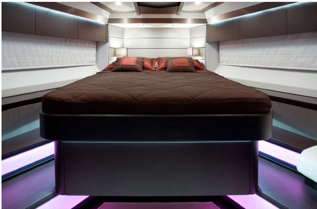
Forward VIP cabin offers ample space