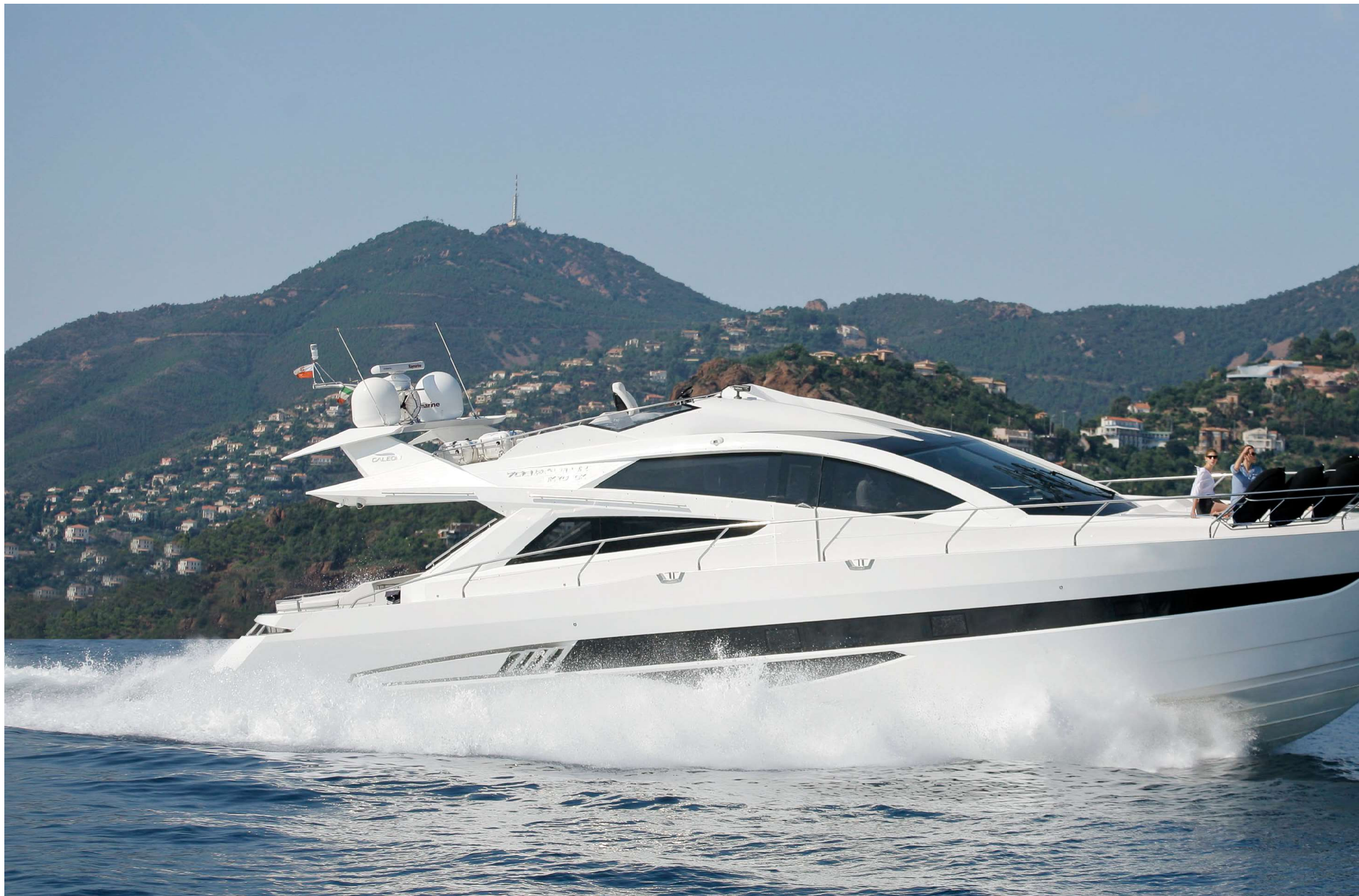
— Notice the sporty profile of the 700 SKYDECK