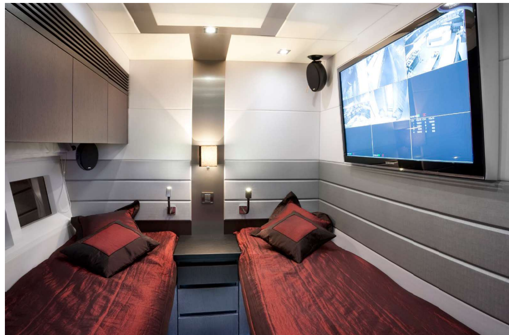
Twin guest cabin will sleep two or serve as extra storage