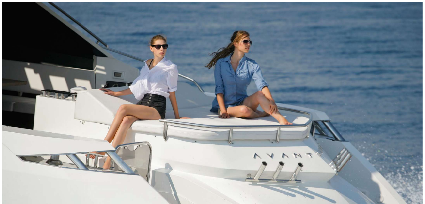
A convenient sun pad over the large garage