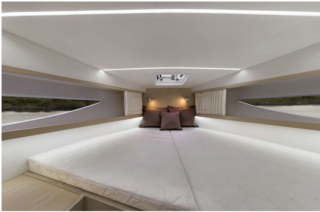
The forward cabin will sleep two —