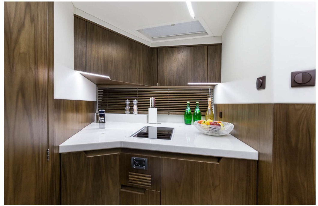
A well equipped galley area