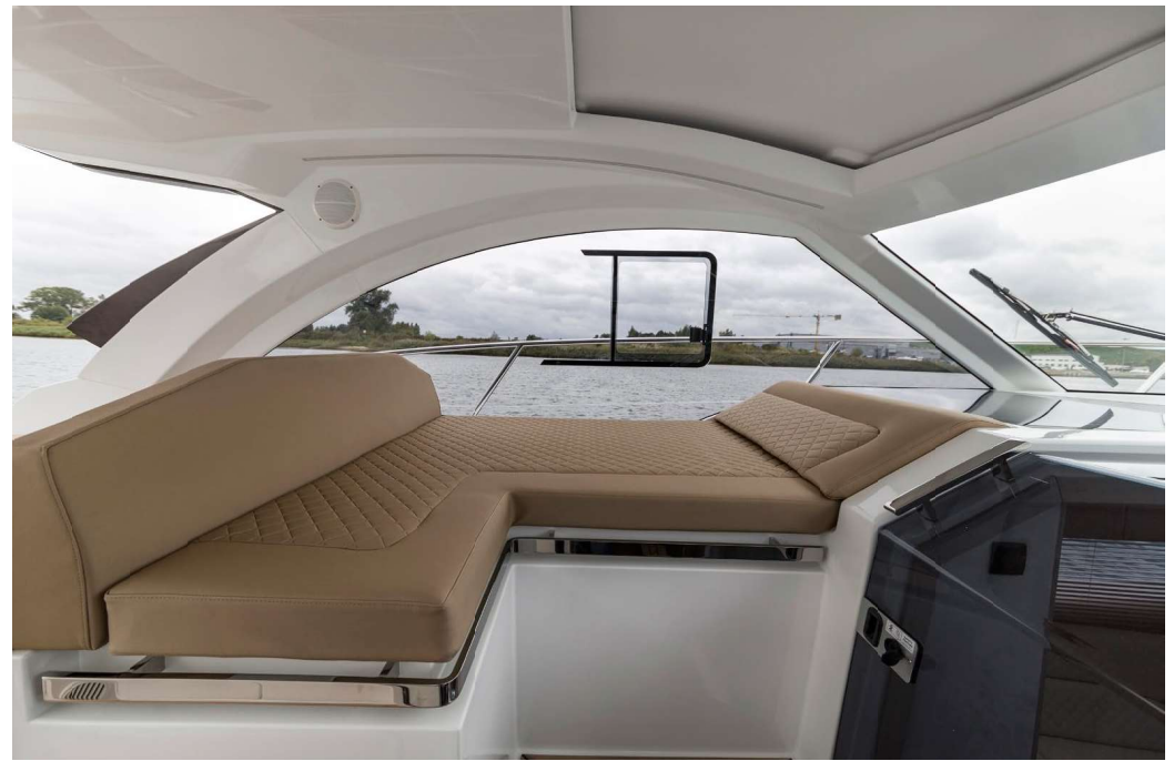
— Extra passenger space up front