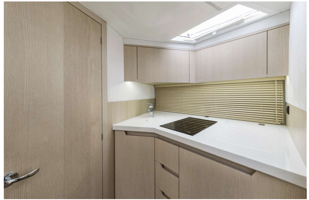
Galley area will hold plenty of supplies —