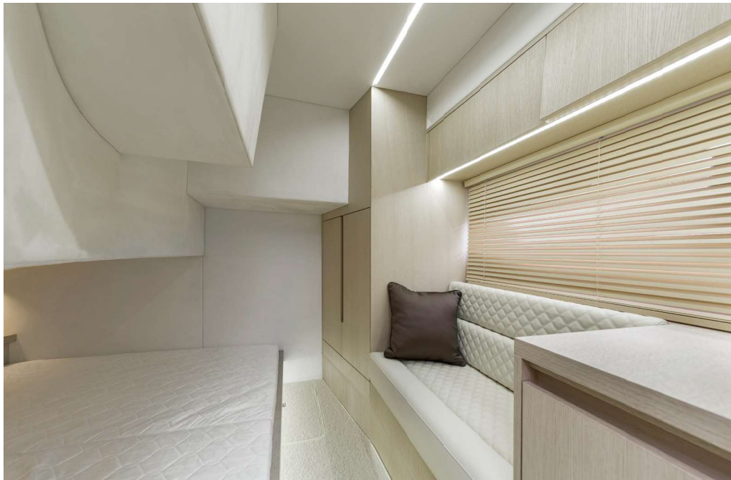
Guest cabin has a large double bed and holds extra storage —