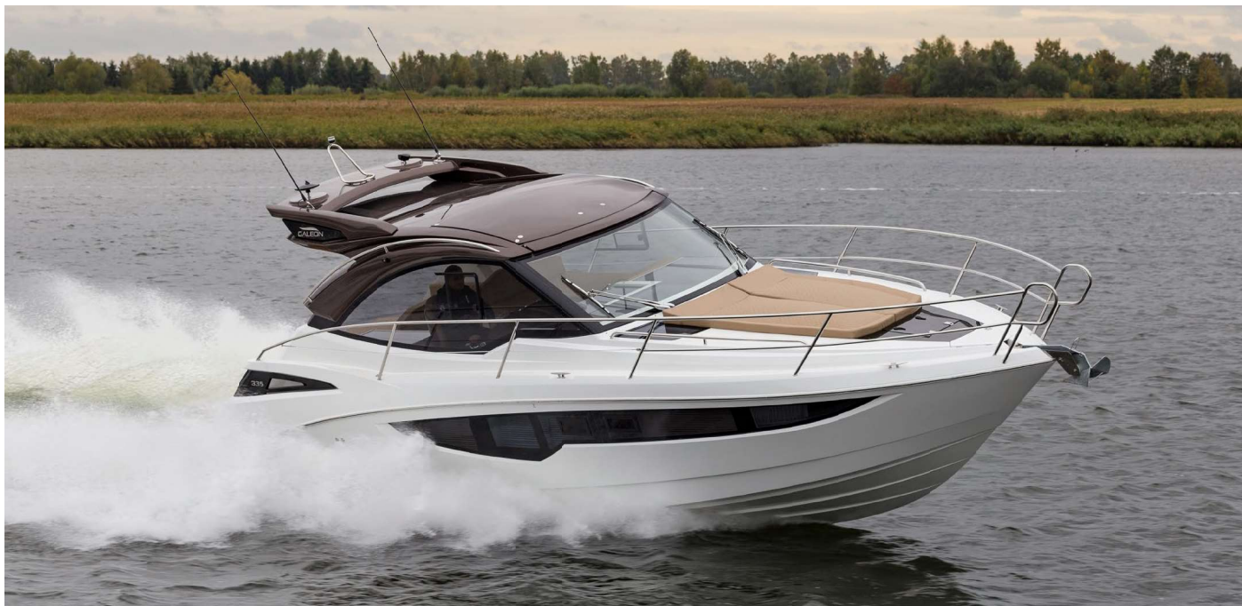
Striking design and smooth cruising of the 335 HTS

A new addition to the Galeon cruiser line-up offers great handling and sport like performance in any conditions