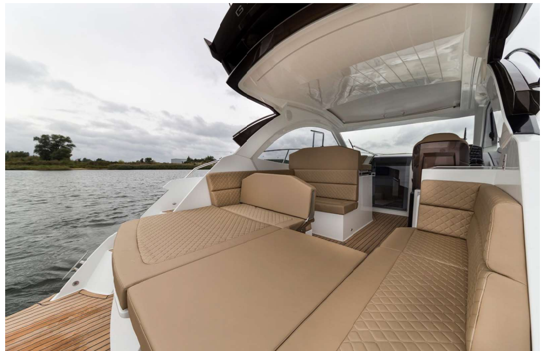
— Use the extra mattress to create a large sundeck facing the aft