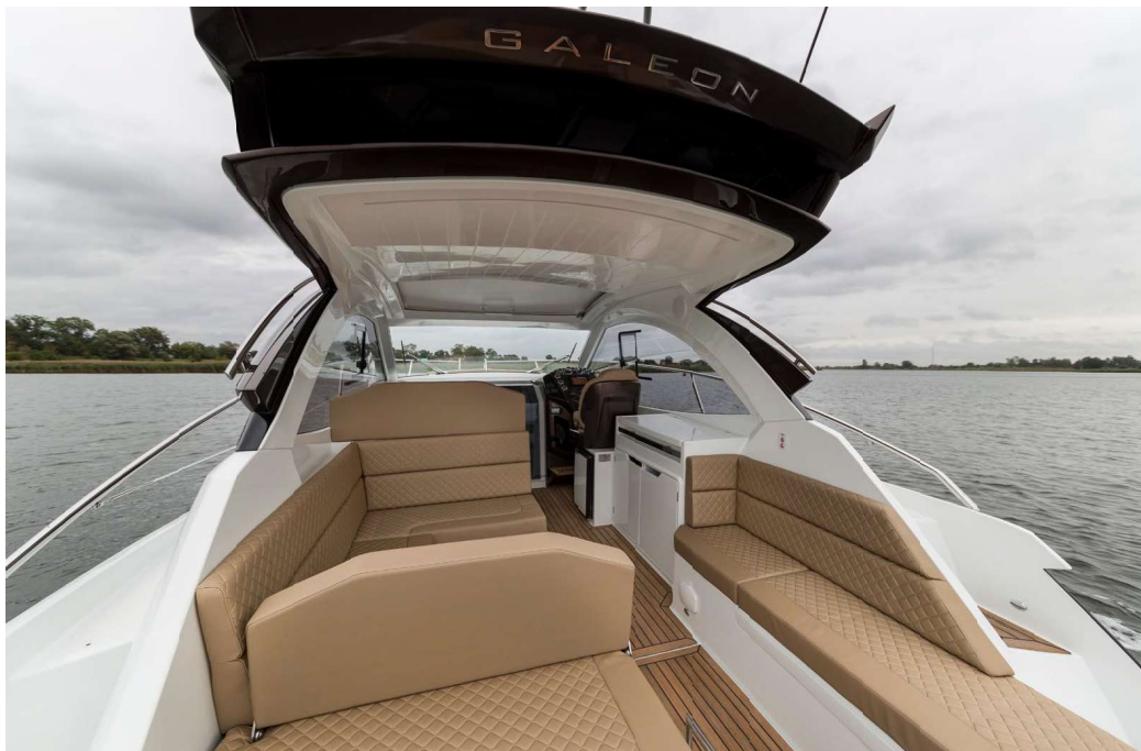
— Plenty of space for fun and relaxation on board the 335 HTS