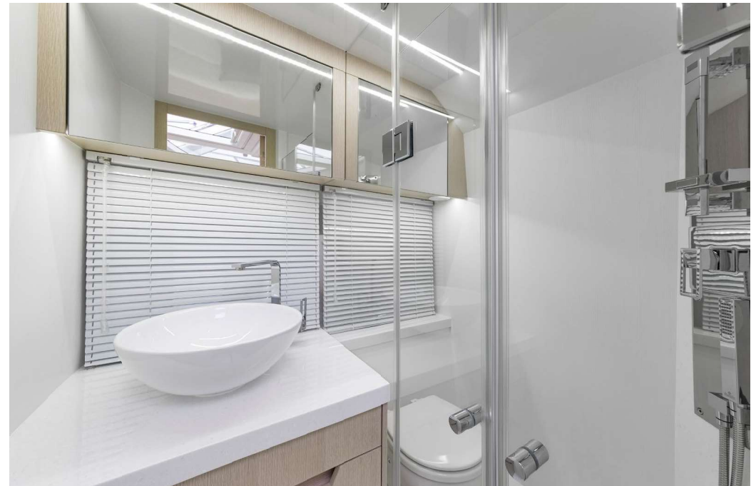
A closed-off shower will help to keep the bathroom dry and tidy —