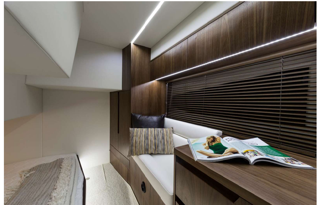
Second cabin with a double bed offers plenty of space