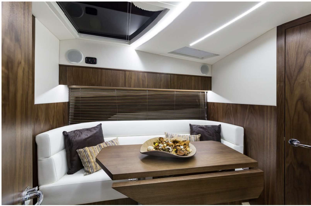
The dining and rest area down below