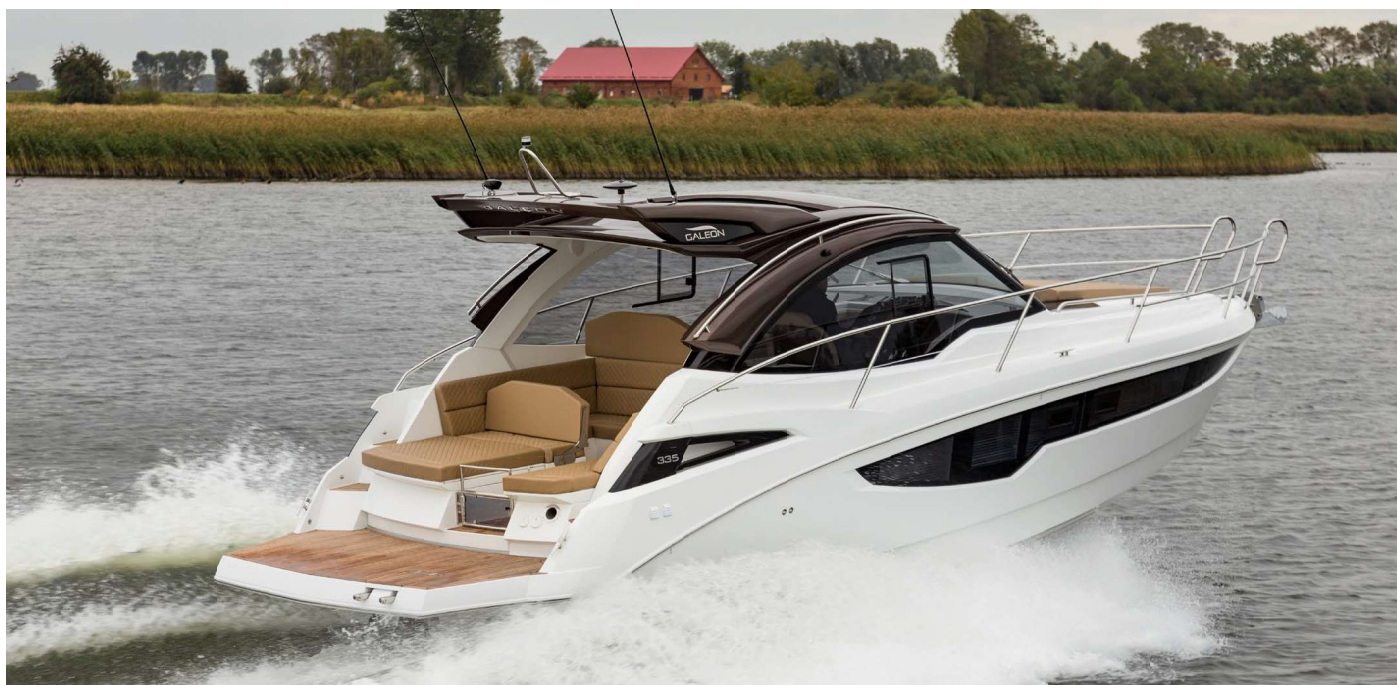
Notice the large bath platform for water based activities