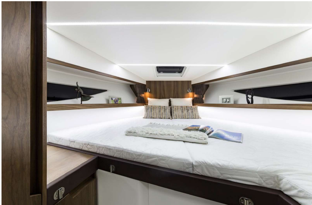
The forward cabin will sleep two with extra space for storage