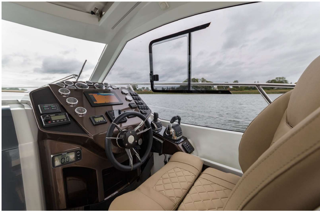
— Precise handling and great visibility from the helm