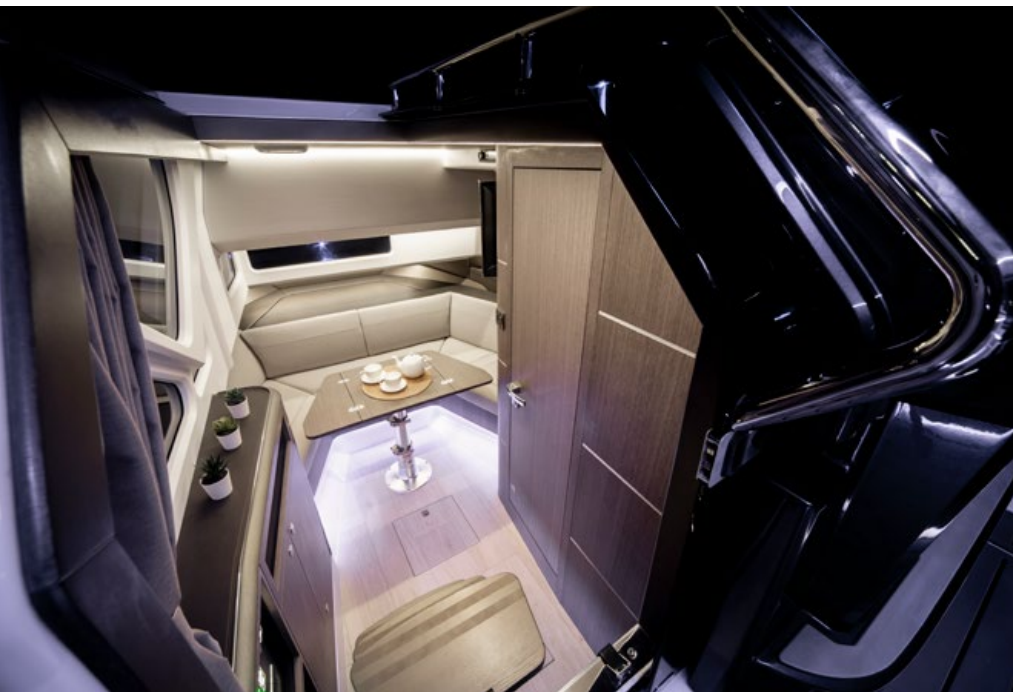
— Living quarters located below deck