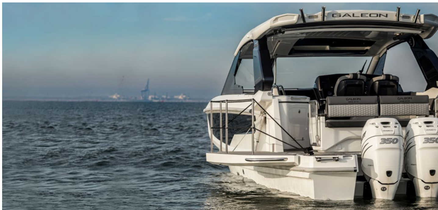
Twin outboards for maximum performance —