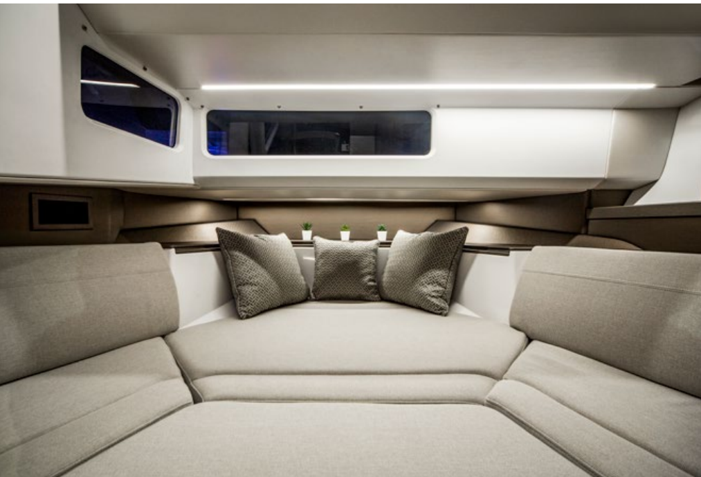
— The bow area can be turned into a double berth