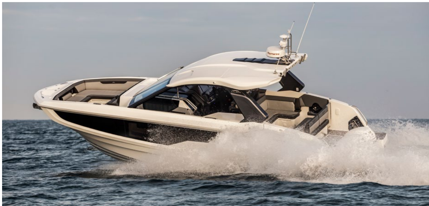
The bow area for the thrill seekers —

Flawless handling is a staple of this sporty day cruiser