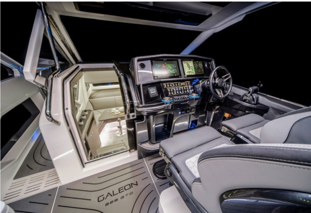
Twin sport seats at the helm —