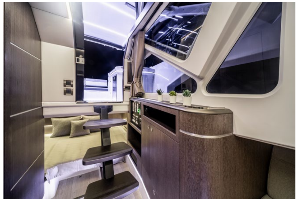
— Tiltable stairs for easy access