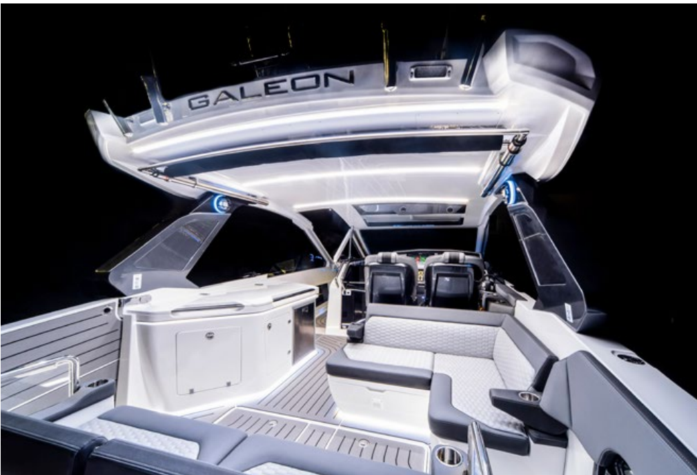
Plenty of space for leisure and activities —