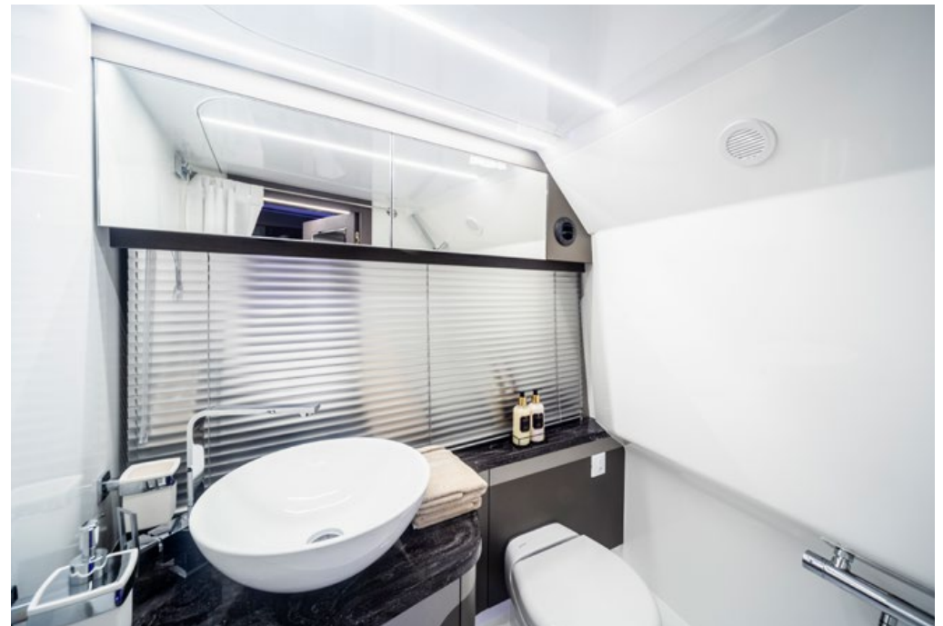
— A convenient bathroom