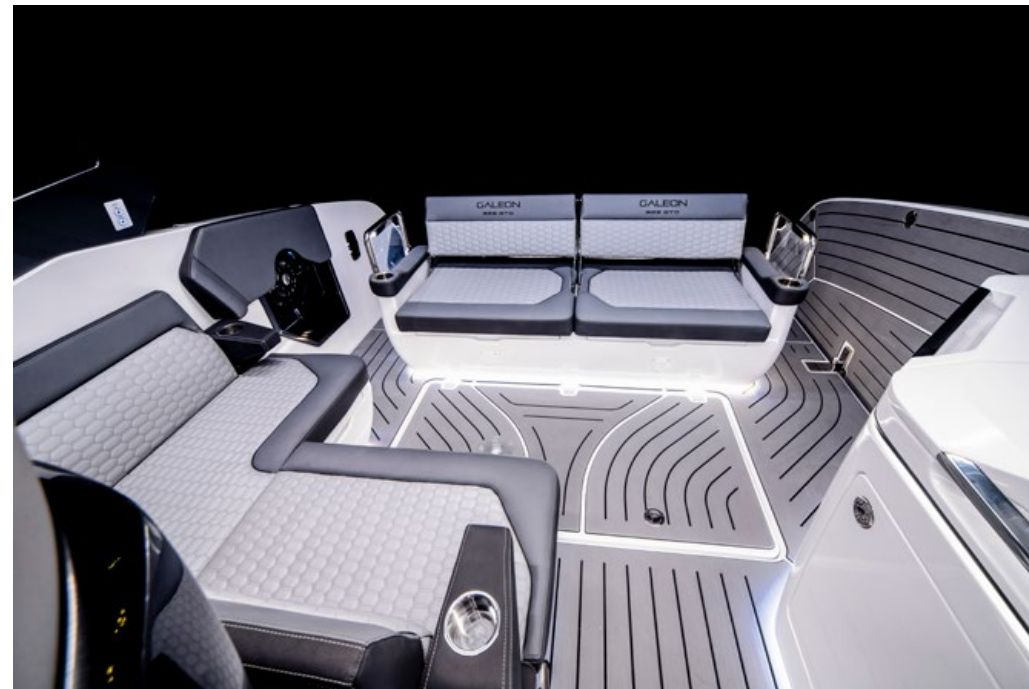
Aft seats can face inwards or outwards —