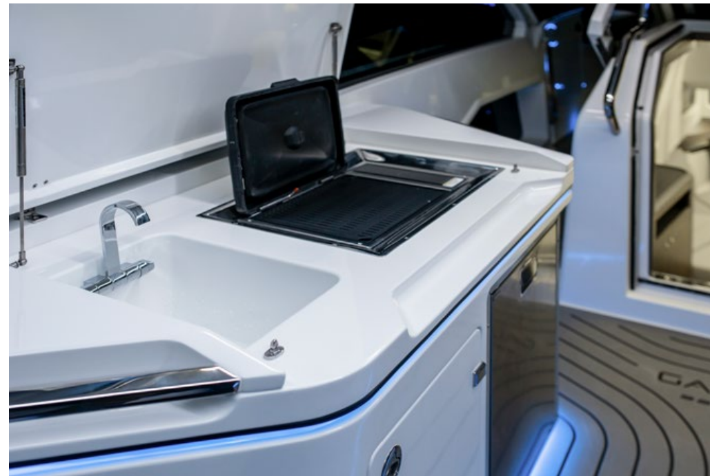
The wet bar fitted with a grill —