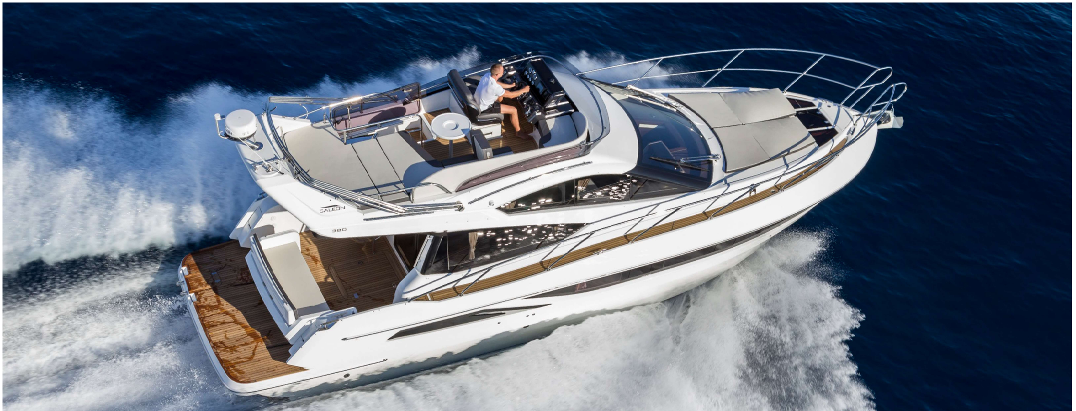
— The flybridge is well equipped to accommodate guests