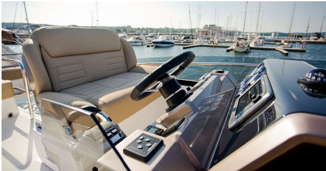
— Double seat at the top steering station