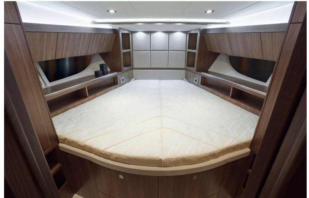
— Forward owner's cabin