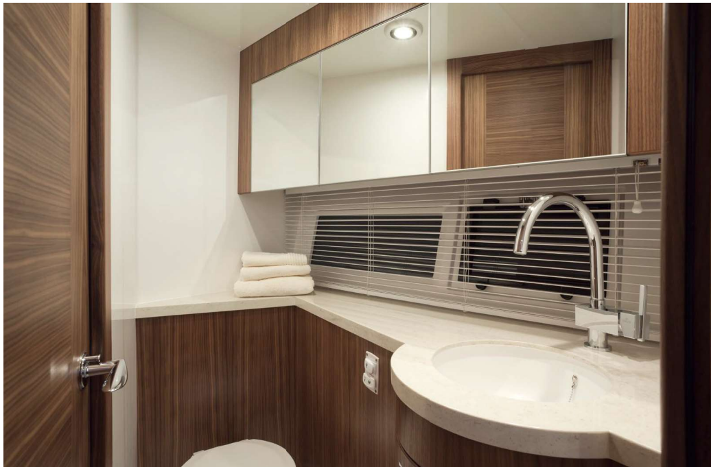
— Separate head and shower down below