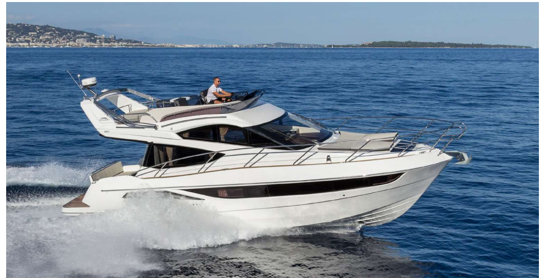
— Great handling and performance of the 380 FLY