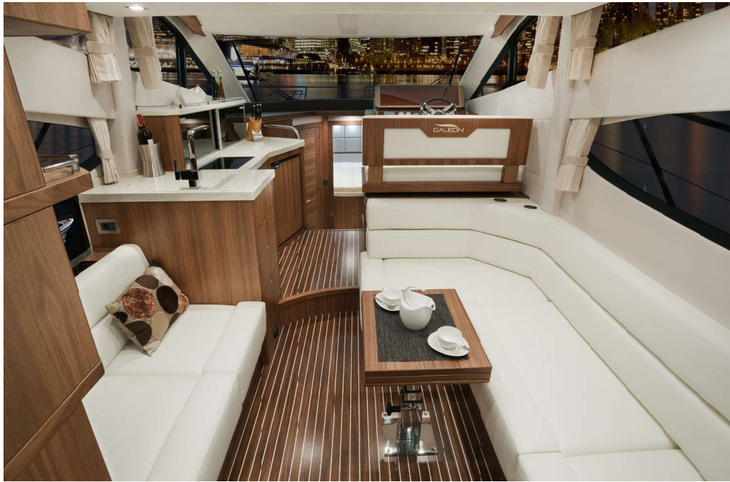
— A galley, dinette and helm station can be found in the saloon