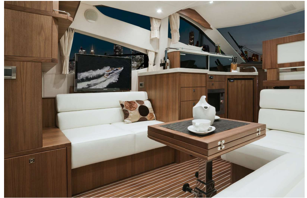
— Guest rest area on the main deck