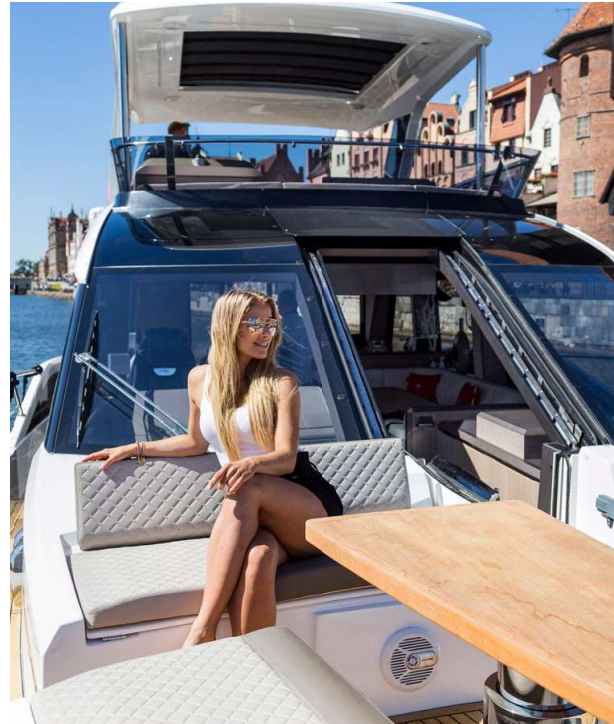
The innovative front entrance provides unrestricted access to the bow