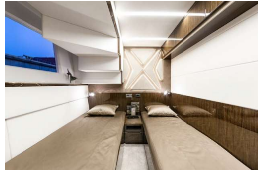
Twin guest cabin will suit large families and charter guests