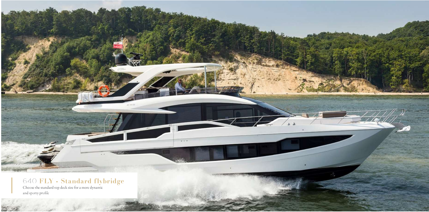
640 FLY - Standard flybridge Choose the standard top deck size for a more dynamic and sporty profile