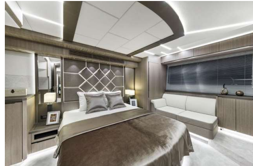
Luxurious finish and incredible volume down below

640 FLY - Lati Grey Find three master sized cabin down below, all with private bathrooms