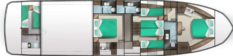
Four cabin Charter layout ver. 3