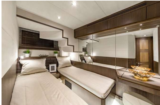
A smaller, twin bed cabin