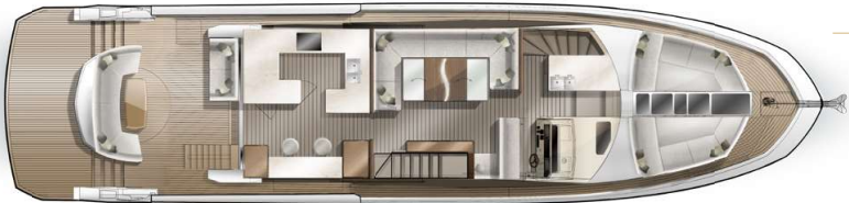
Roto-seat, Beach Mode closed ver. 2