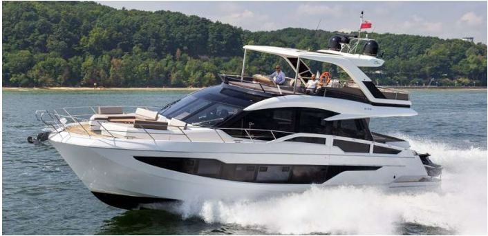
Easy bow access and back rests allow guests to sit in front during cruising