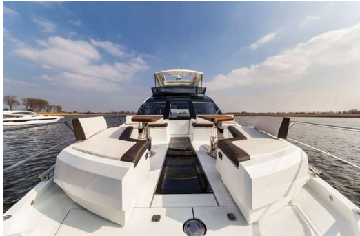
Extend the bow area thanks to sliding seats and tables