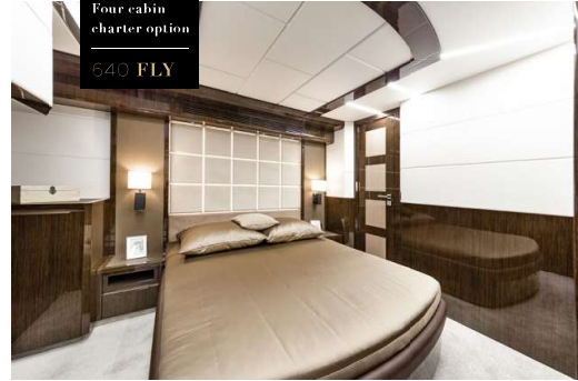
Two large cabins and two smaller cabins are available in this setup