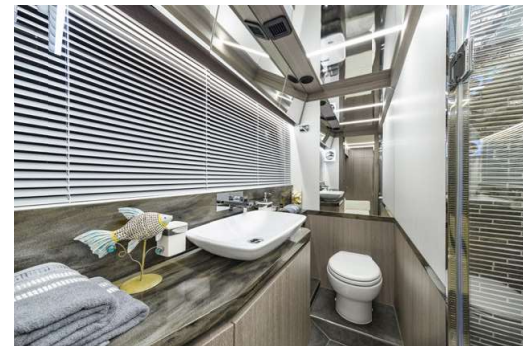
Large windows for those incredible views...