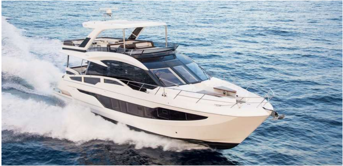
The carbon construction of the top deck and bimini allows for better weight distribution