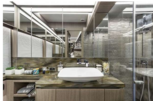
High quality fixtures in all three bathrooms