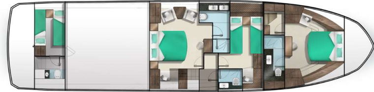
Super Master layout ver. 2