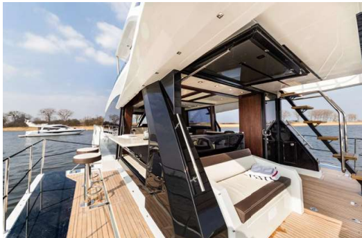
Even the back window can be opened to easily serve the wet area