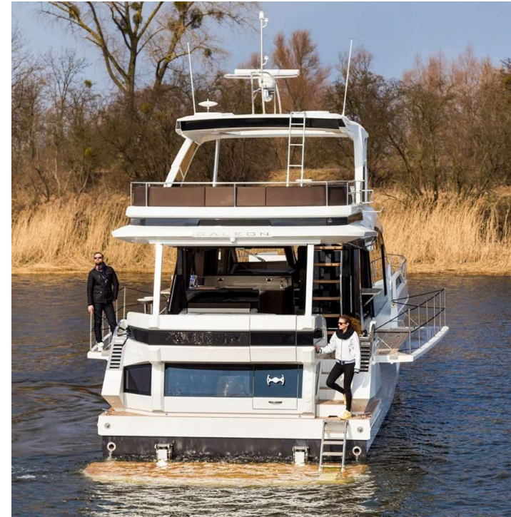
Hydraulic platform and access to the crew cabin

The 640 comes equipped with the revolutionary Beach Mode option extending the usable space in the cockpit