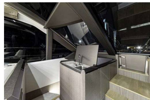
The middle panel of the front window can be opened for easy bow access