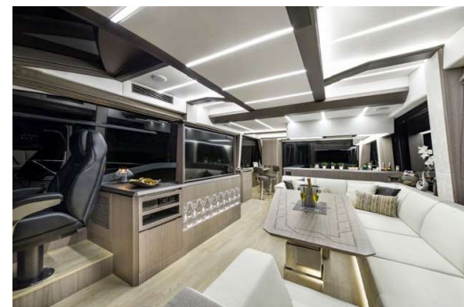
Entertainment area with a large pop-up TV