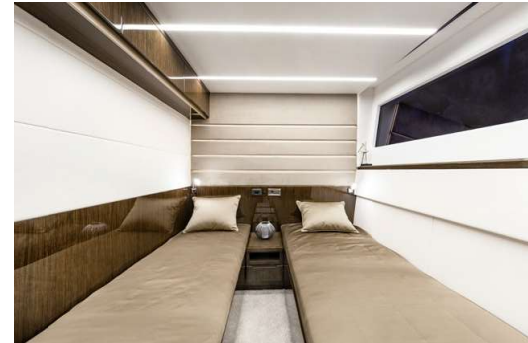
Two extra berths will come in handy on many occasions