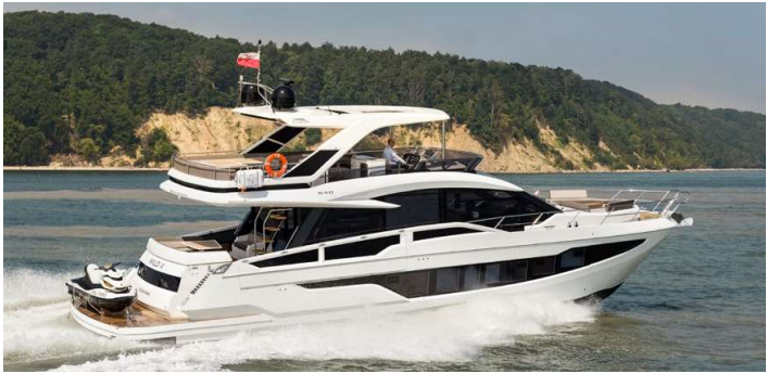
The hydraulic platform will easily fit most water paraphernalia