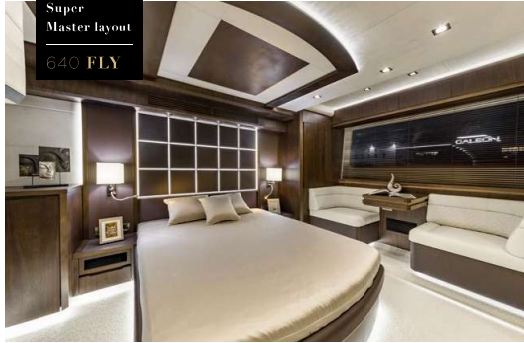
The super master layout offers a larger midship cabin