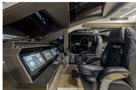
A high-tech helm with two sport seats