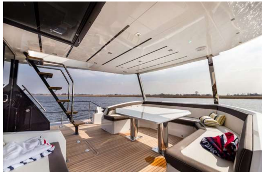
Cockpit area is vast with the Beach Mode open