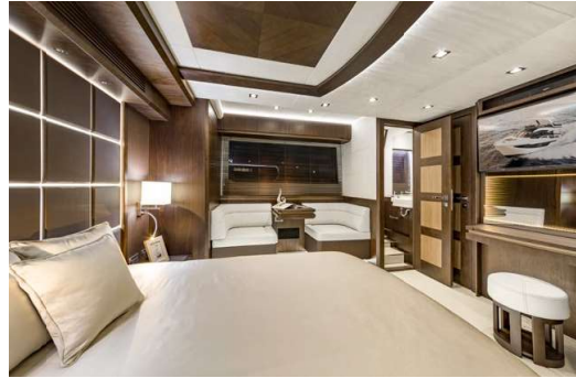
Separate head and shower in the super master setup