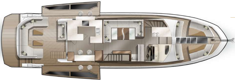
Standard seat, Beach Mode open ver. 1