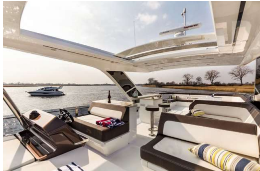
The carbon bimini top can be opened with a touch of a button