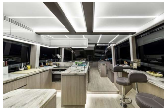
Both port and starboard windows slide forward

A large living area with a proper kitchen will please all guests on board the 640