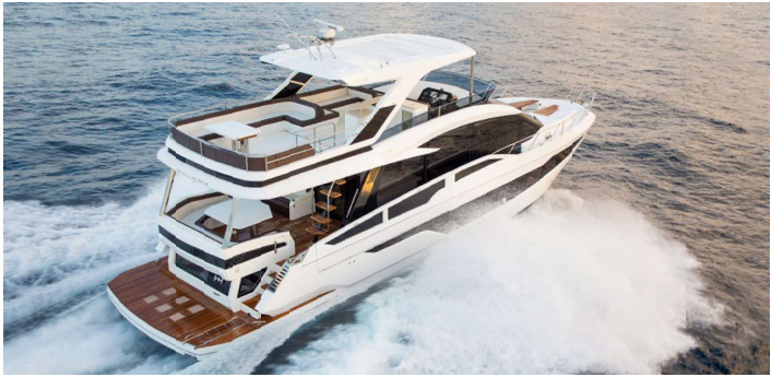
Incredible space on all three decks