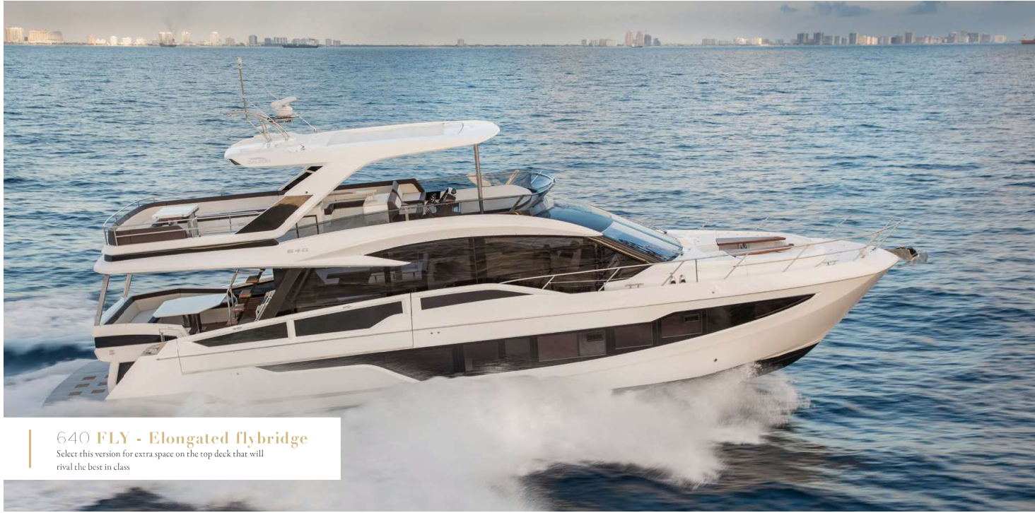
640 FLY - Elongated flybridge Select this version for extra space on the top deck that will rival the best in class