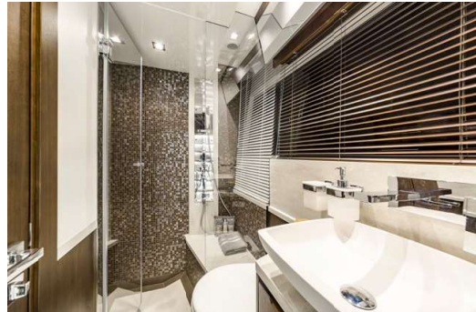
Guest bathroom down below