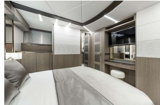
Guest cabin holds plenty of storage