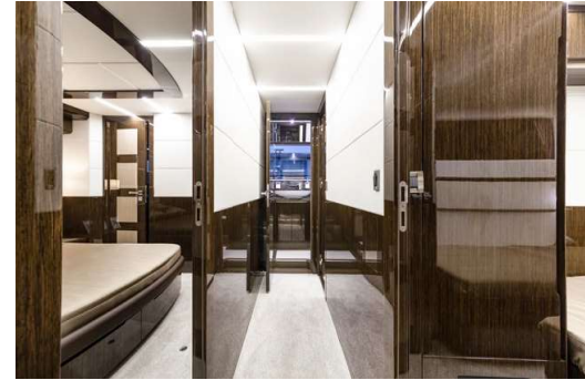
Midship access to three of the four cabins down below