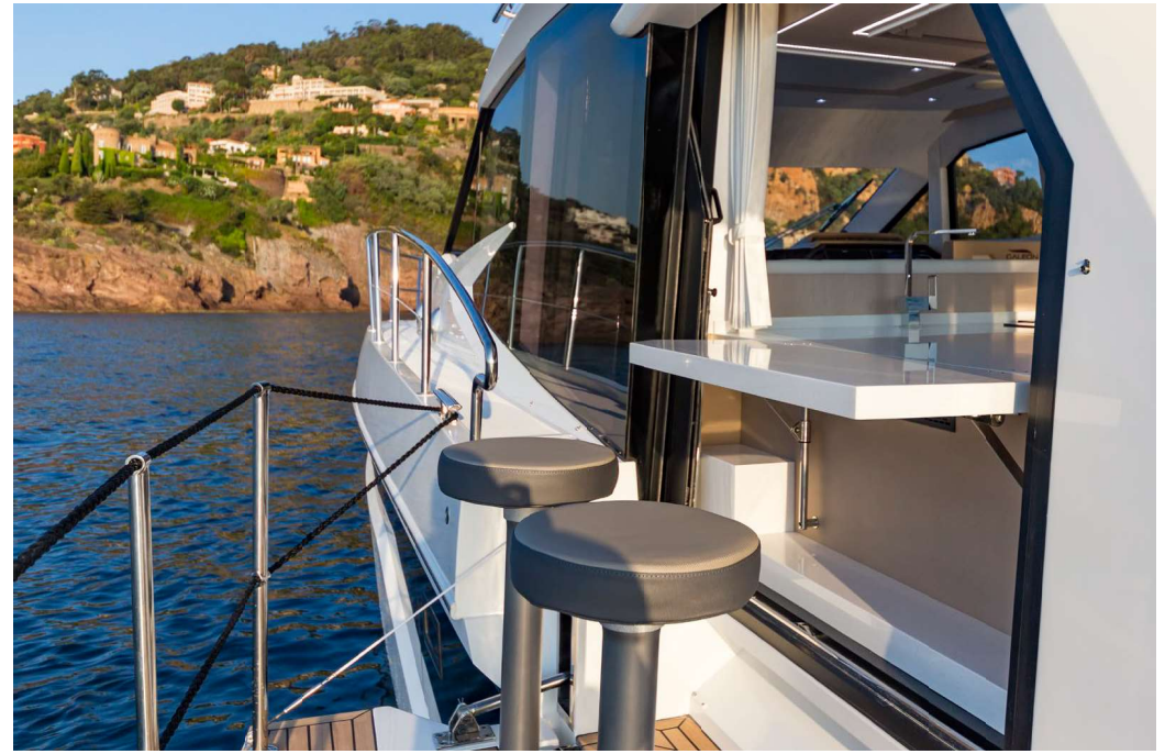
— Serve refreshments from the outside bar