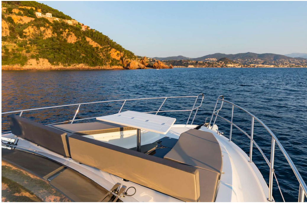
— The bow can be turned into a sundeck or a sitting area