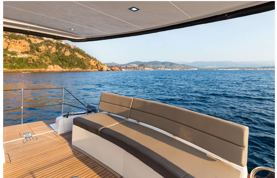
— A large cockpit area